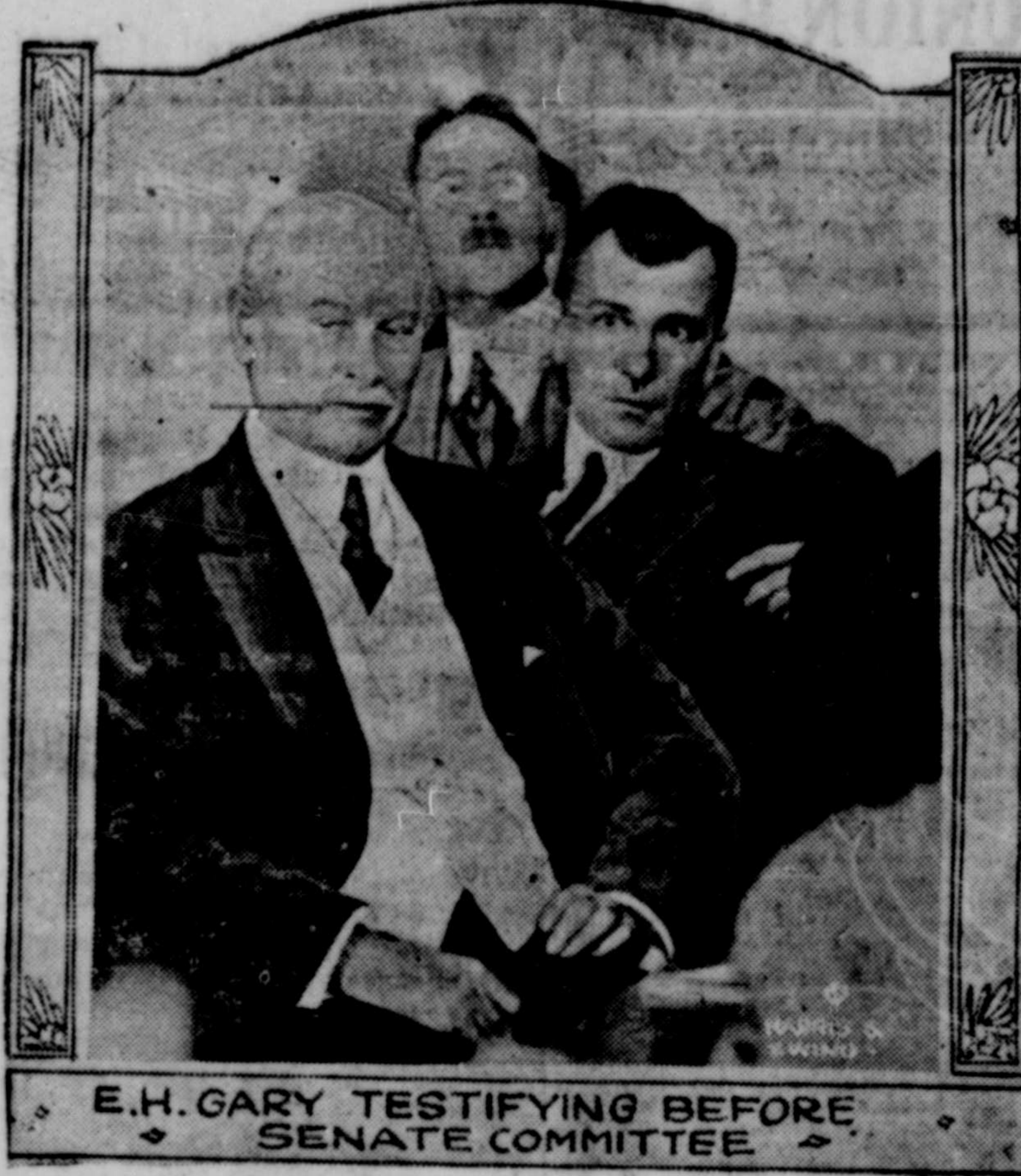
E. H. GARY TESTIFYING BEFORE SENATE COMMITTEE

Eliot H. Gary, chairman of the board of the United States Steel Corporation, in his statement to the Senate committee says that he will not meet any workmen's representatives and advocates federal regulation of concentrated capital and combined labor. He declares that unions are a menace to the country and refuses to arbitrate the steel strike. Continuing he said: "We put ourselves squarely upon the issue that this is a question of the open or closed shop. Now, as to what will bring about the closed shop we must decide from time to time, depending upon the facts presented. At the present time the union leaders have brought about this strike, which is no more or less than an attempt of a minority to secure control of the interests of the large majority, including not only the employers but the employees."