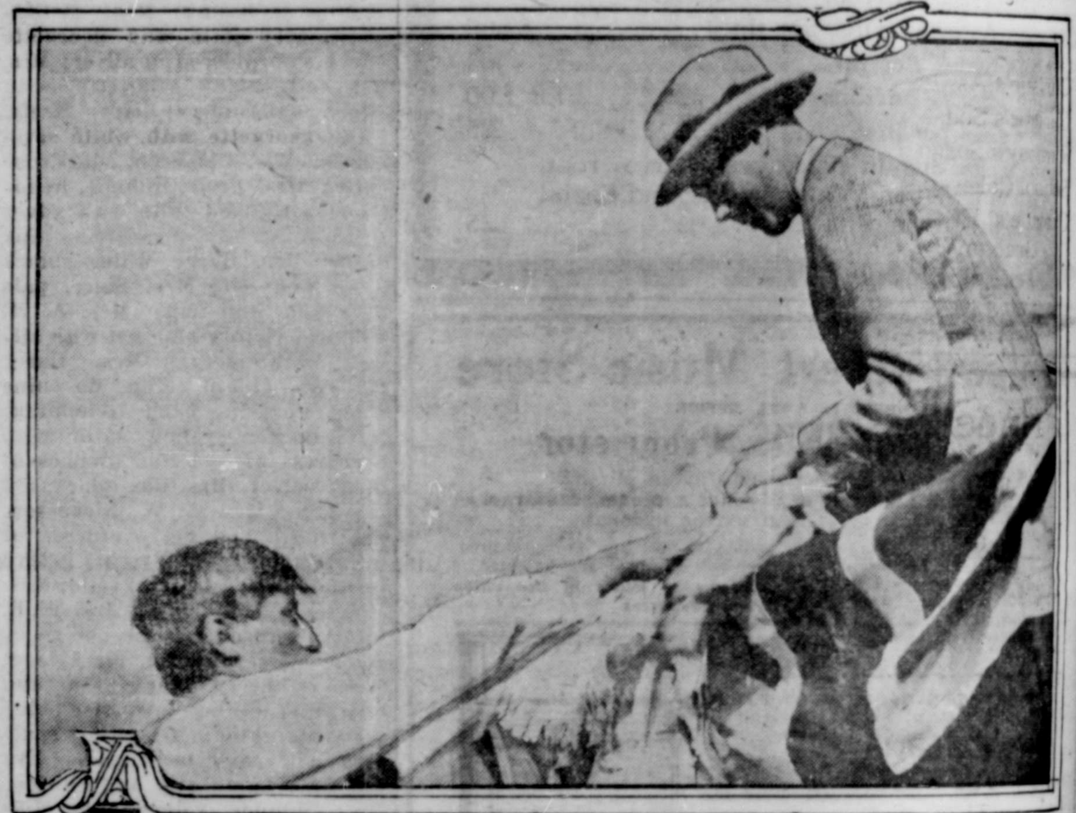
PRINCE OF WALES AND INDIAN CHIEF

The above picture shows the young Prince of Wales accepting the robe presented to him by the young Indians of Banff, Alberta, upon the occasion of his being made "Chief Morning Star" of the Stony Indians tribe.