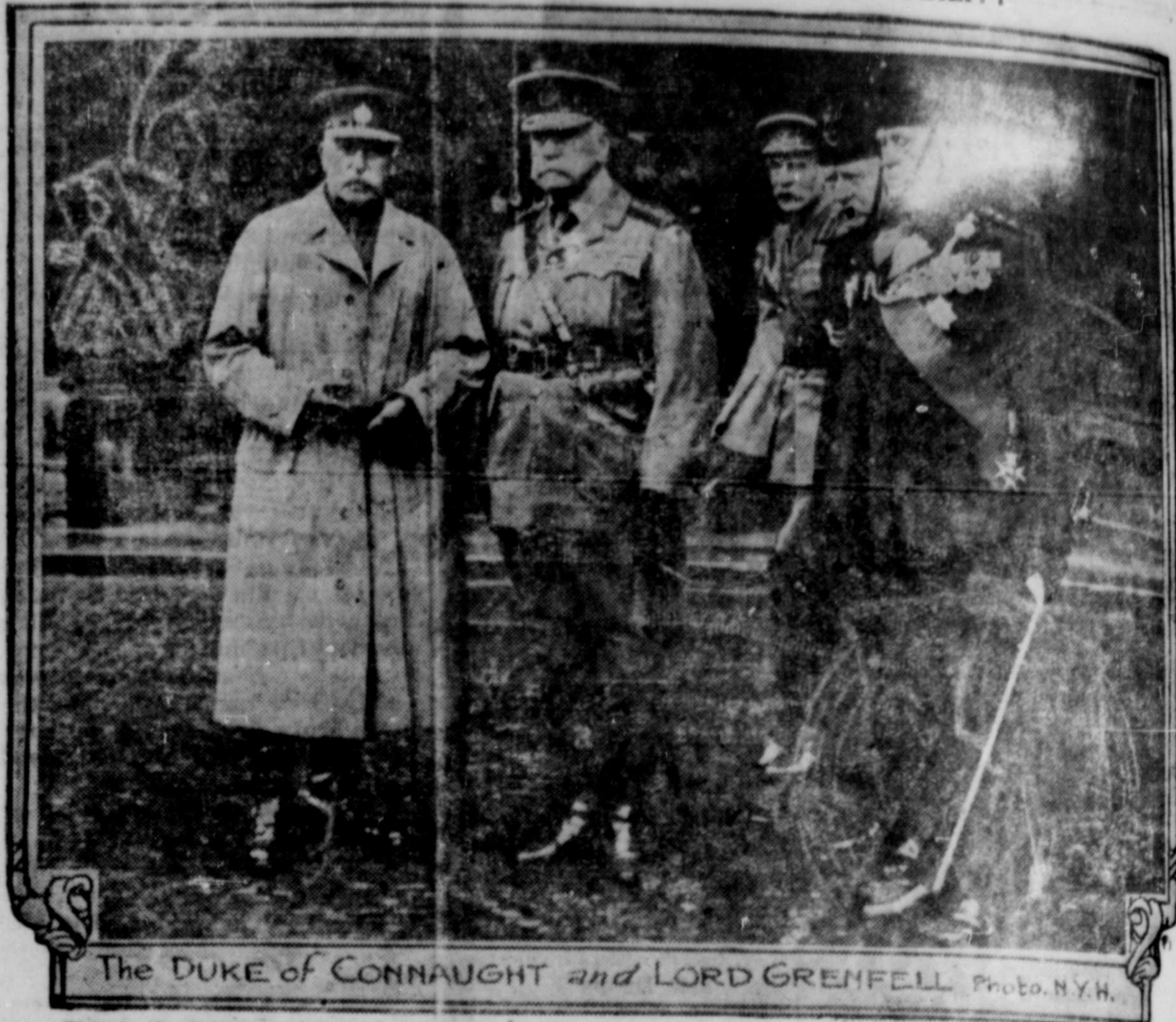
The DUKE OF CONNAUGHT and LORD GRENFELL.

This is the latest snapshot of the Duke of Connaught, taken at the services for English heroes at the Westmin Abbey. Lord Grenfell is at his left. The Duke was one of the most earnest workers during the cruel world war and is very popular throughout England. Lord Grenfell who is also shown in the picture, is none the less popular.