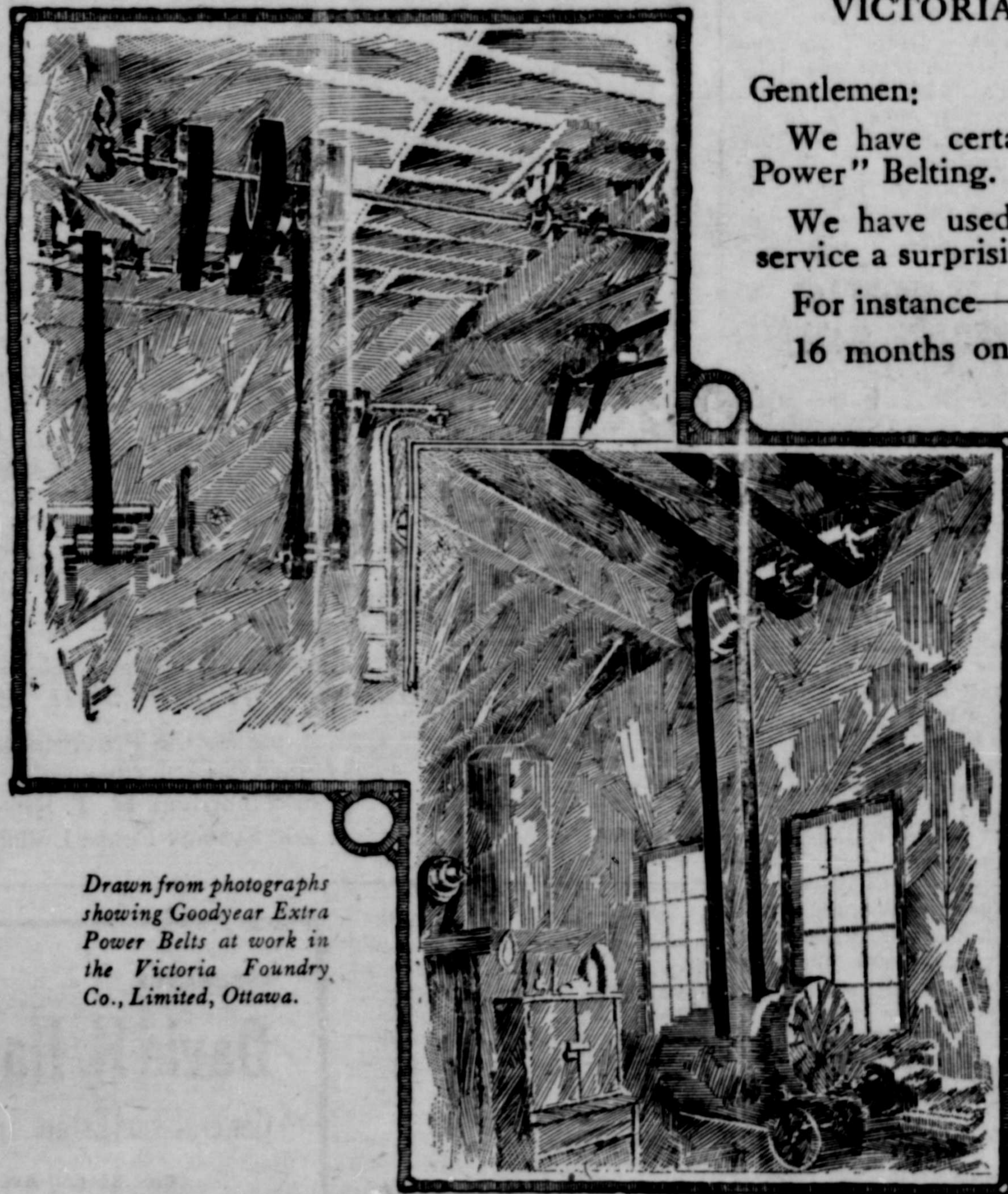
Drawn from photographs showing Goodyear Extra Power Belts at work in the Victoria Foundry Co., Limited, Ottawa.

Halifax, St. John, Quebec, Montreal, Ottawa, Toronto, Hamilton, London, Winnipeg, Regina, Calgary, Edmonton, Vancouver