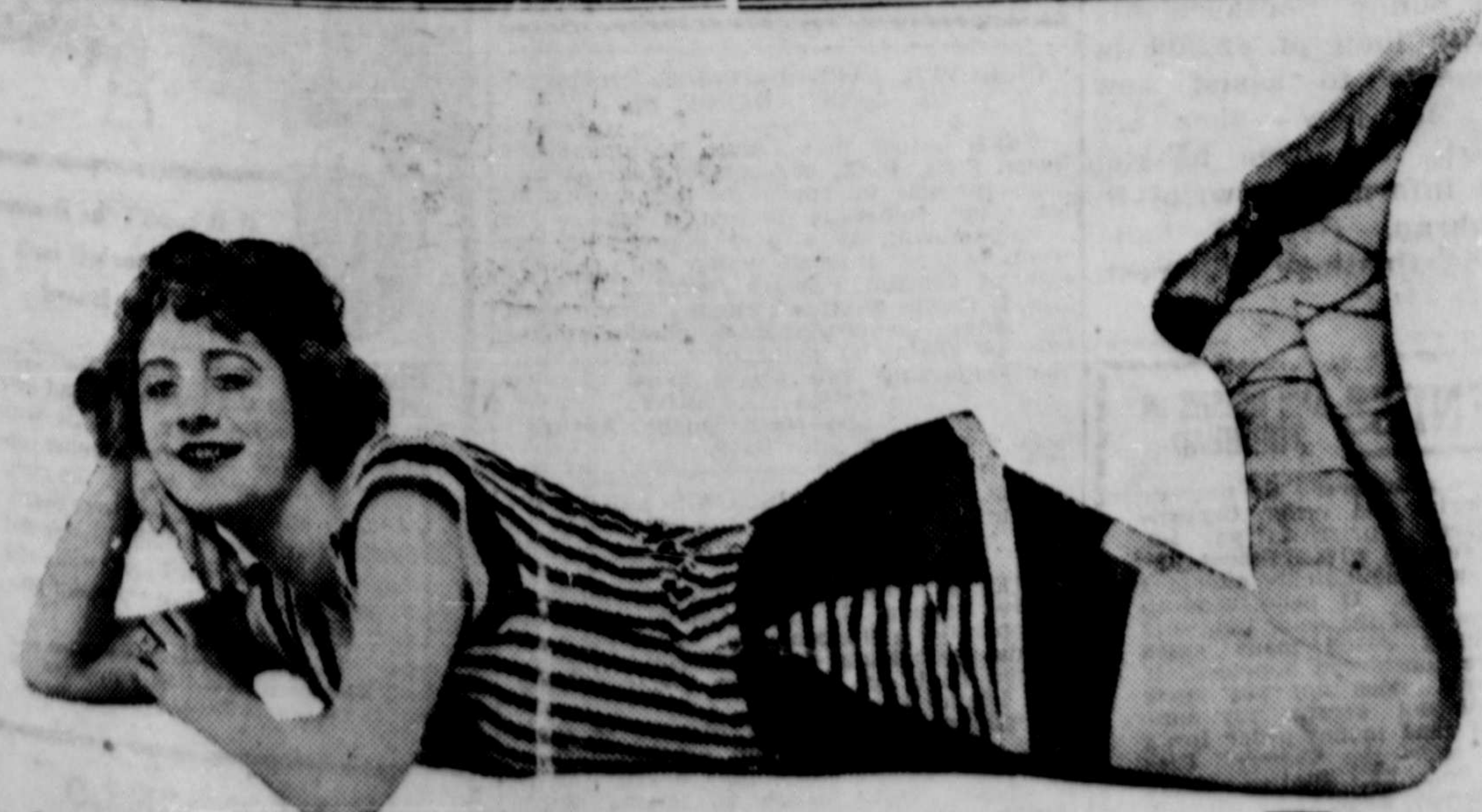
One of Fisher's "Folly Girls" appearing at the Westholme Theatre this week

Advertise in "The Daily News" The Paper that gets Quick Results!