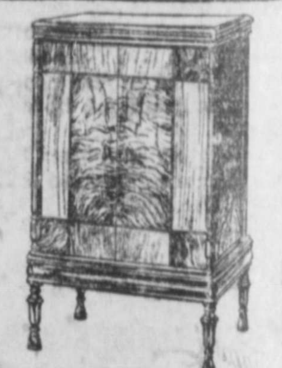
VICTOR-RADIO with ELECTROLA RE-45 The complete modern musical instrument. All-electric Radio and Victor Record reproduction. $375 complete with tubes.