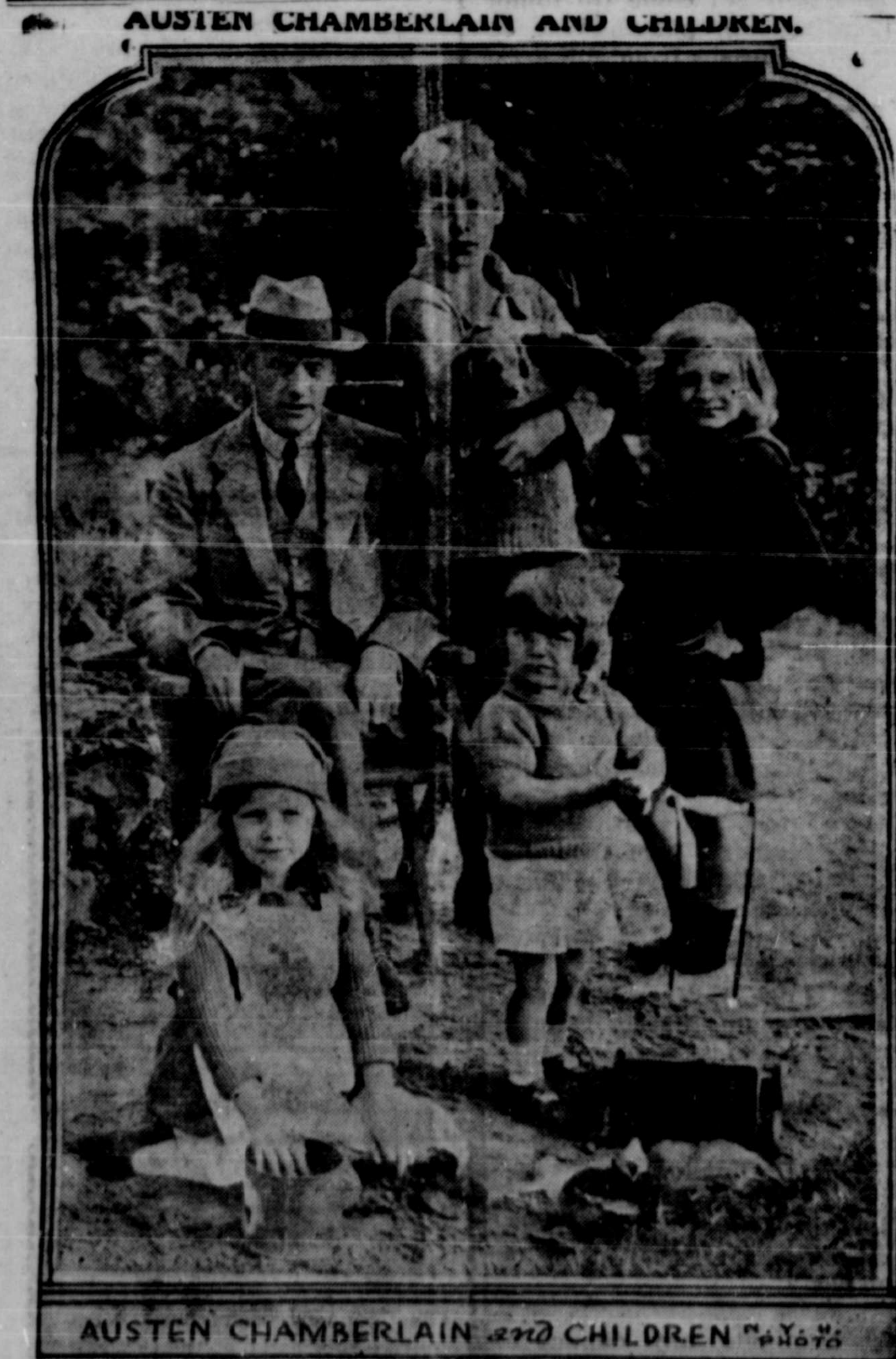
AUSTEN CHAMBERLAIN and CHILDREN England's Chancellor of the Exchequer is a home-loving man, as may be seen by a glance at this photograph, showing the statesman on the grounds of his Sussex home surrounded by his children. Mrs. Austen Chamberlain is also seen gathering a basket of flowers in her garden.