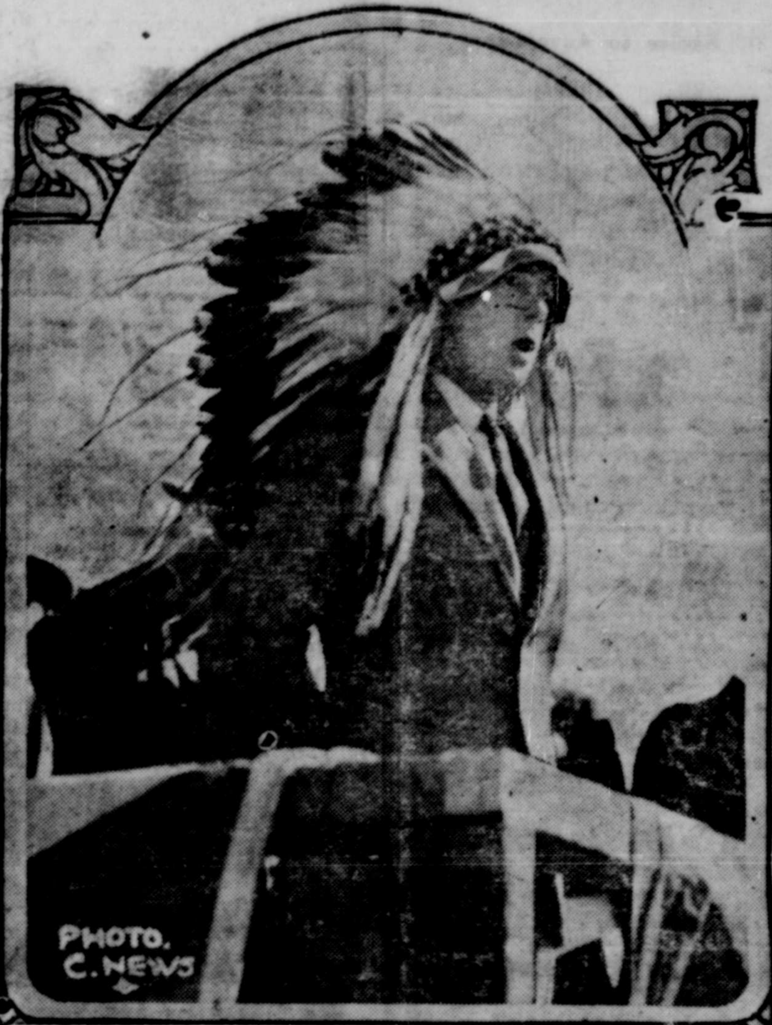
Indians of the Lethbridge district, Alberta, Canada, have bestowed upon the Prince of Wales the title of "Red Crow," or "Chief Many Smiles." All the old Indian ceremonies were used in the proceedings, which took place when the Prince and party stopped there.