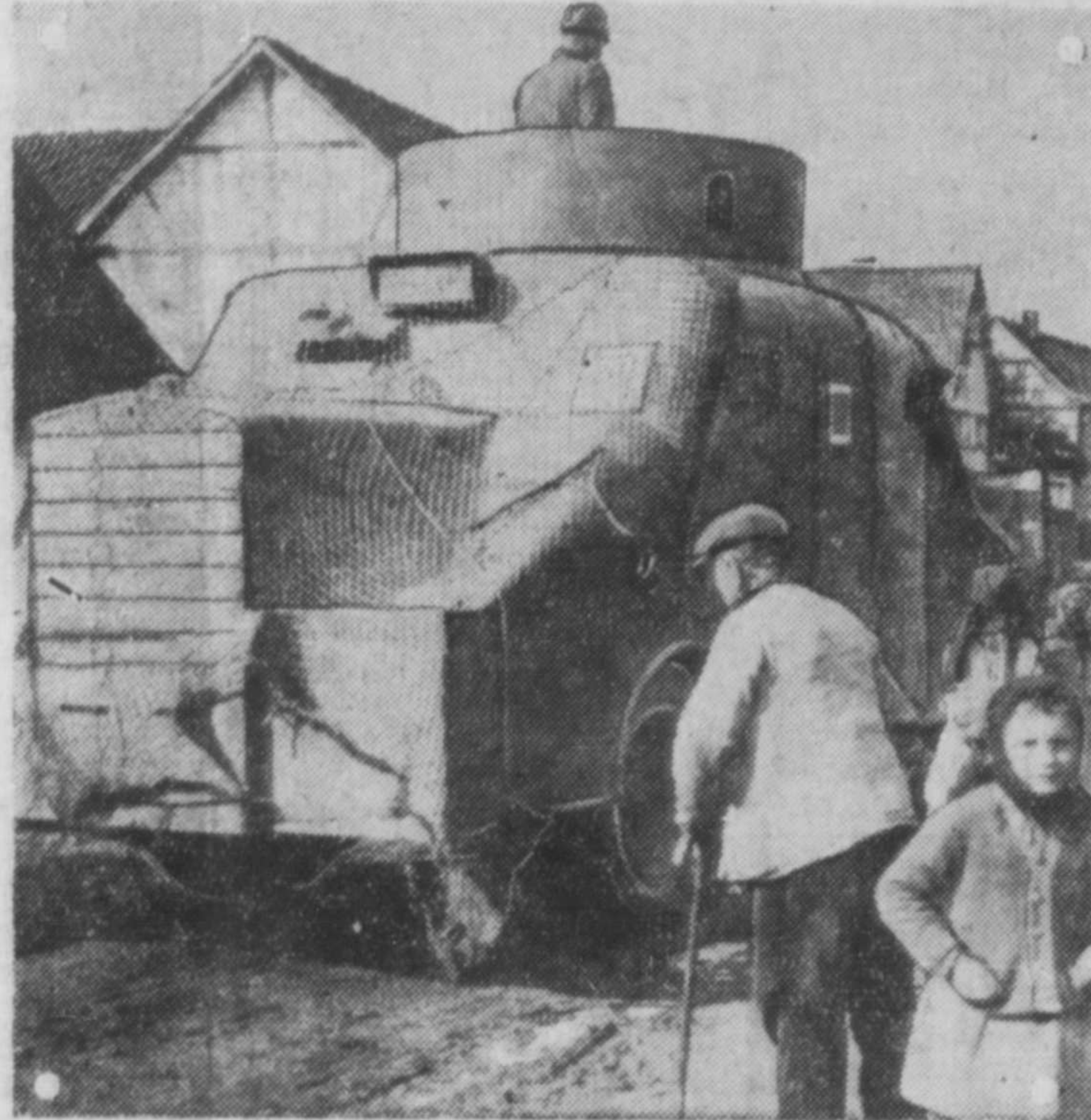
First great autumn manoeuvres of the Reichswehr, for several years, took place, recently, at Konigshofen, Germany.