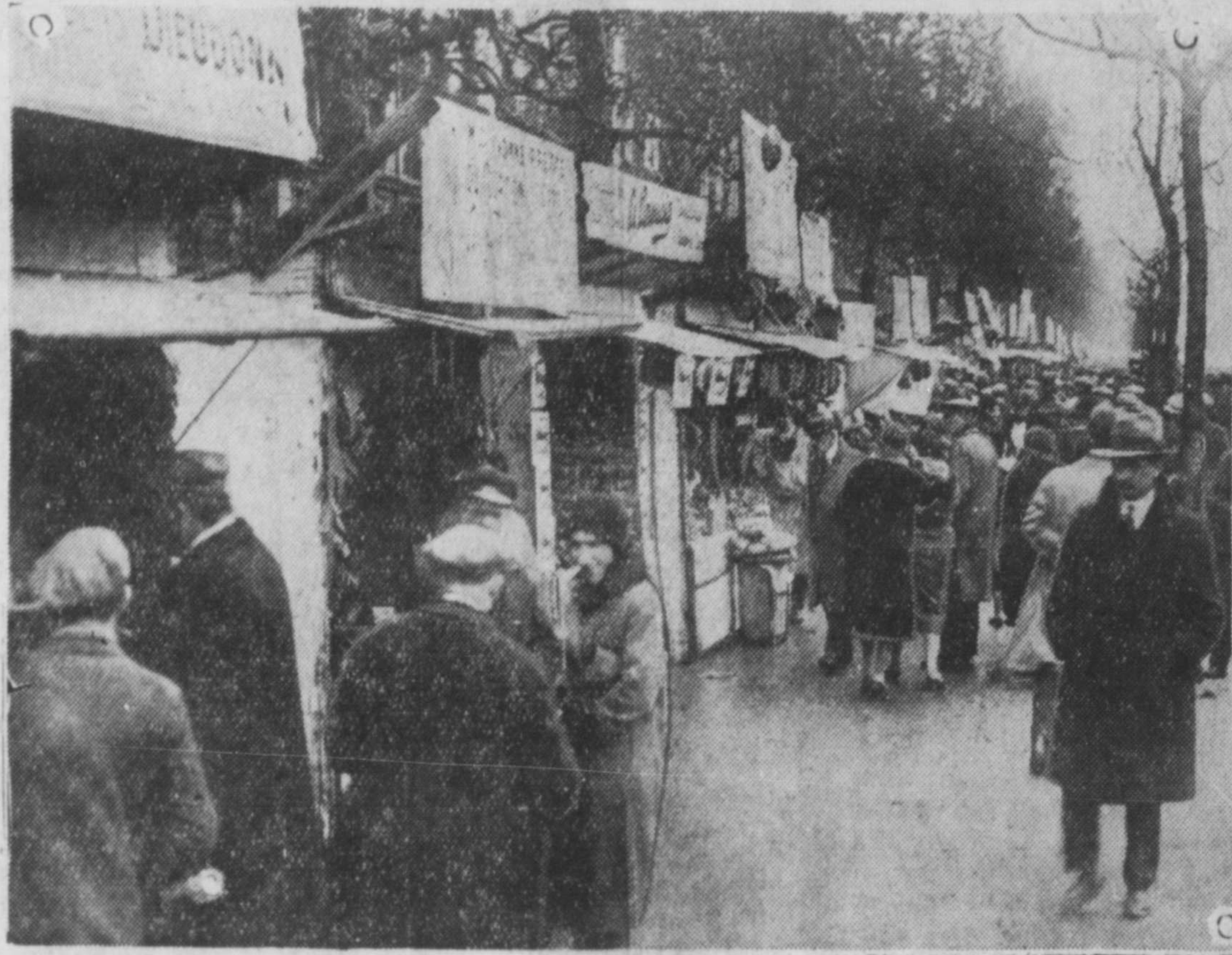
View of Paris' annual Sausage Fair, showing booths along street where hams and sausages from the provinces are on display up a site where once stood the famous Bastille-prison-fortress.