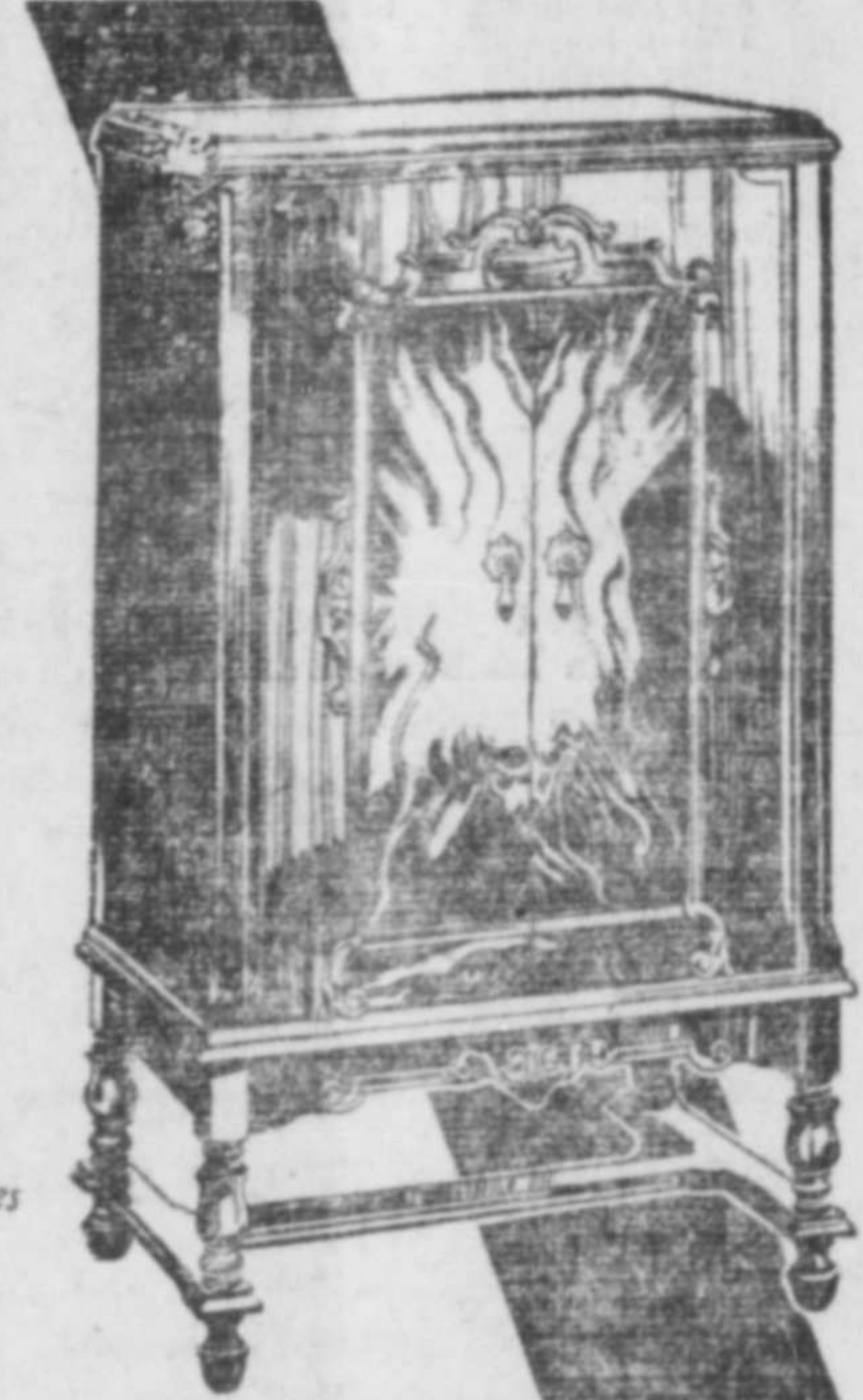
VICTOR RADIO HOME-RECORDING ELECTROLA RE-57 $397.50, Complete with tubes