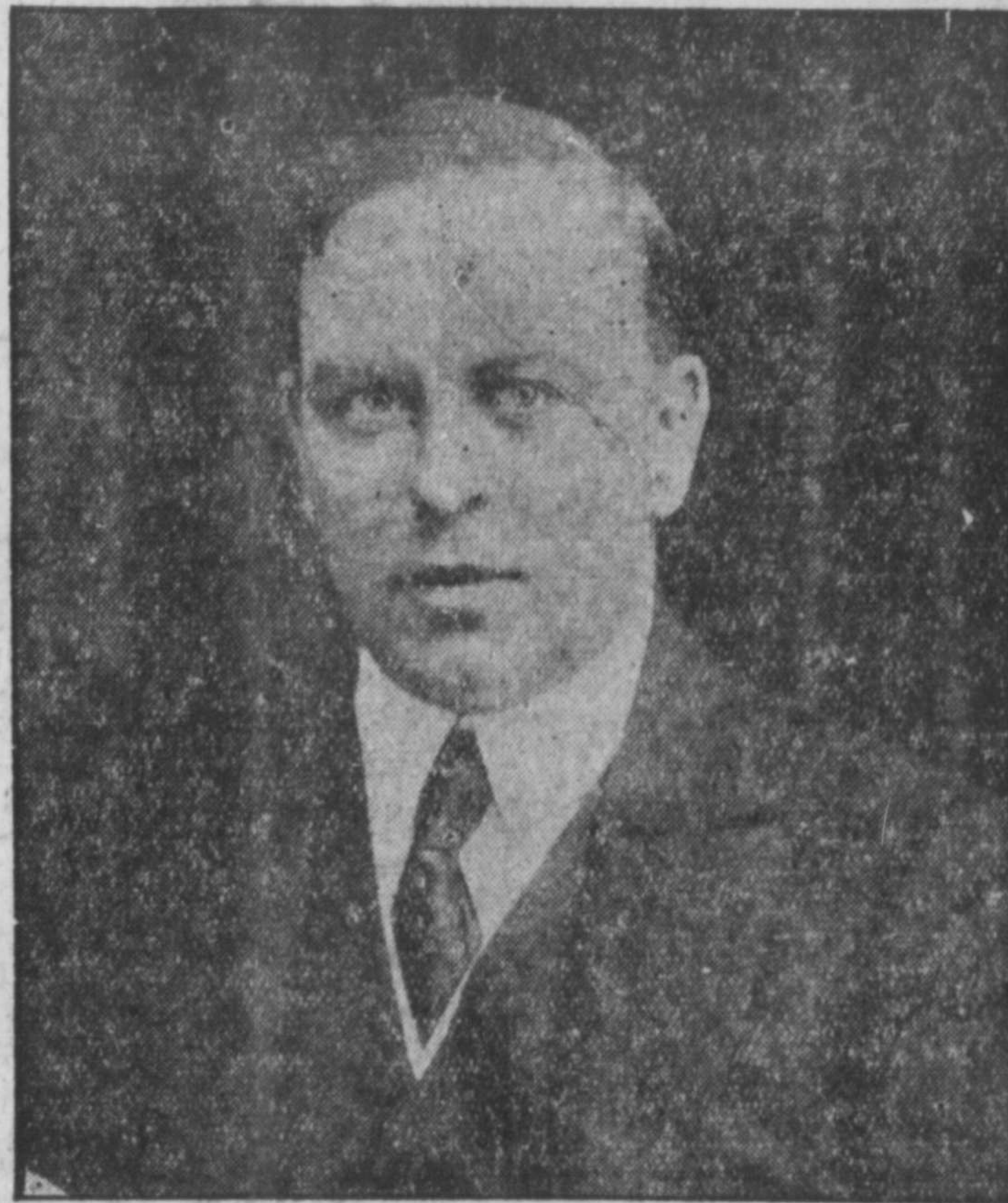
Premier King, from whom announcement of election is expected soon.