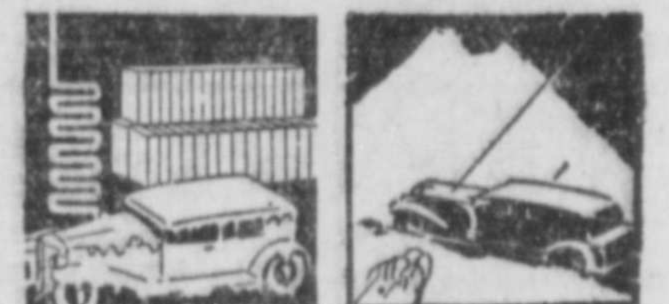
As a final check cars are run into the cold room of a great ice plant. These choke tests are made to verify its 26% quicker starting ability.