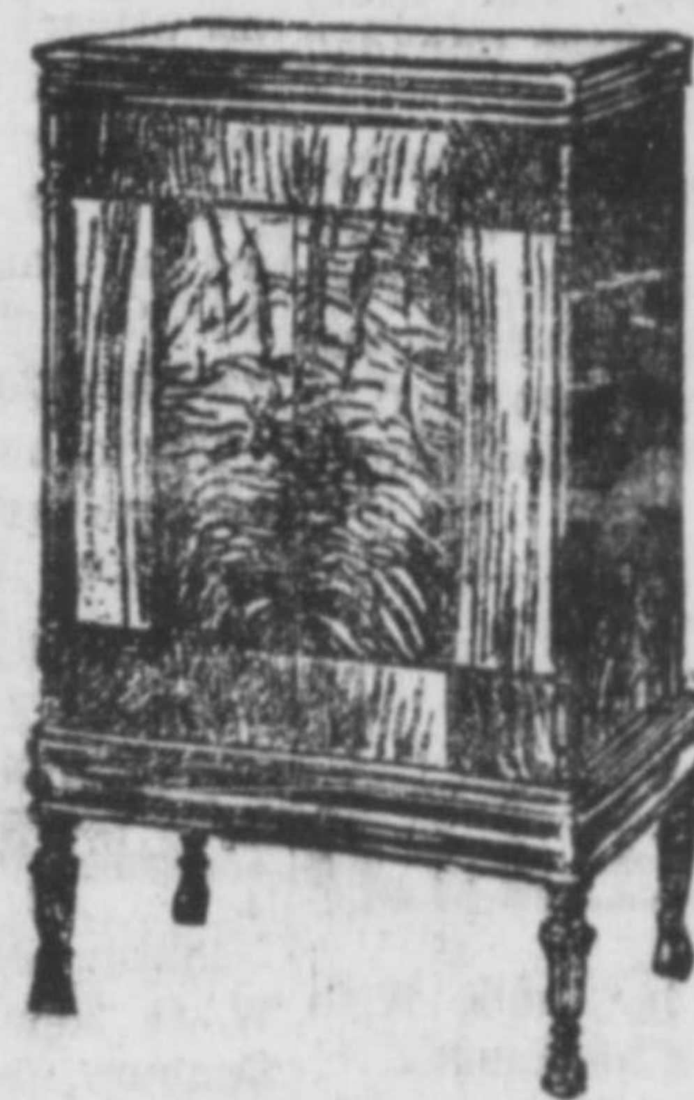
The famous RE-45 — Music from Air or Records with equally wonderful tone-quality. Price, complete with tubes — $375.00.