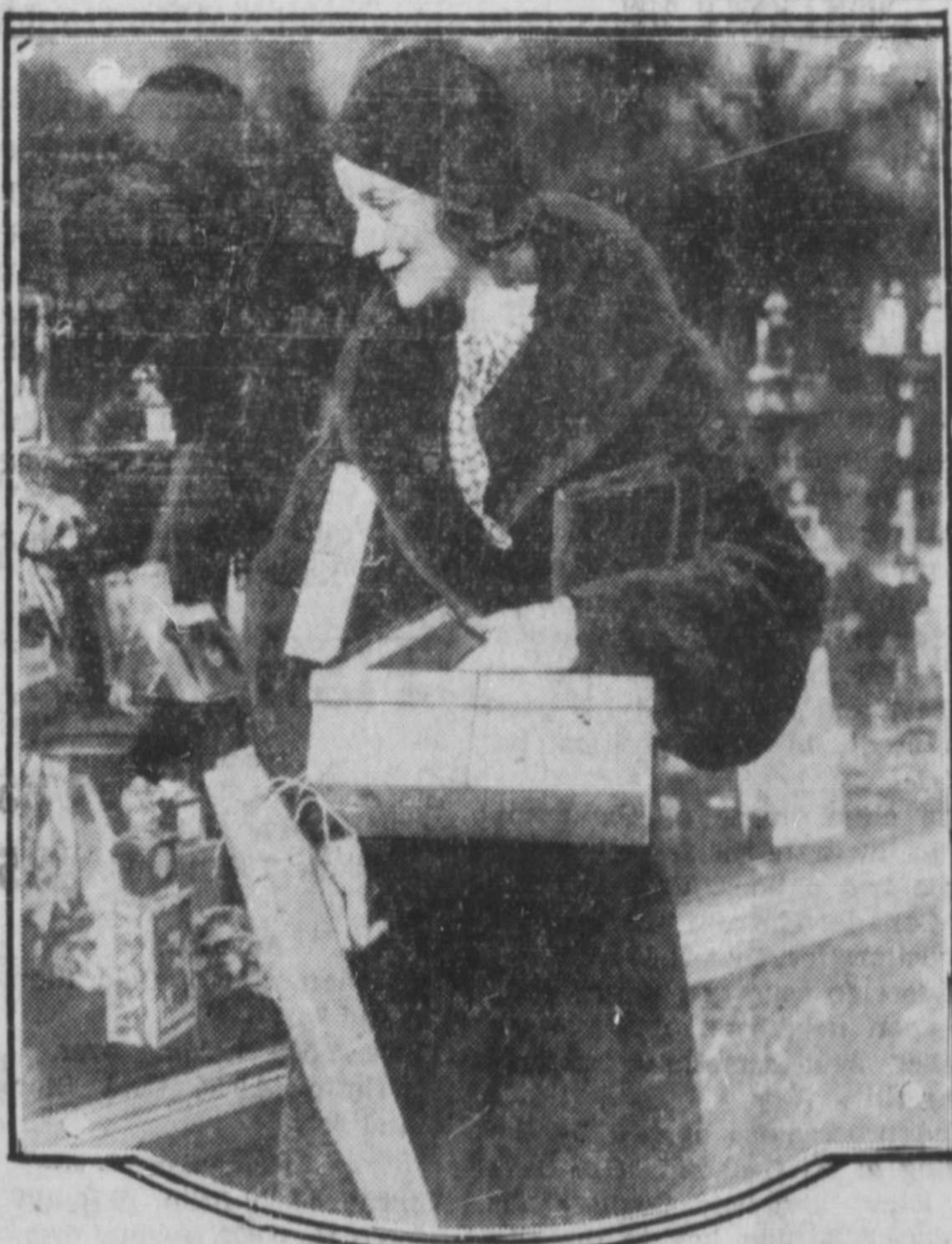
This young lady, engaged in shopping, is Evelyn Laye, starring in one of Nel Coward's plays