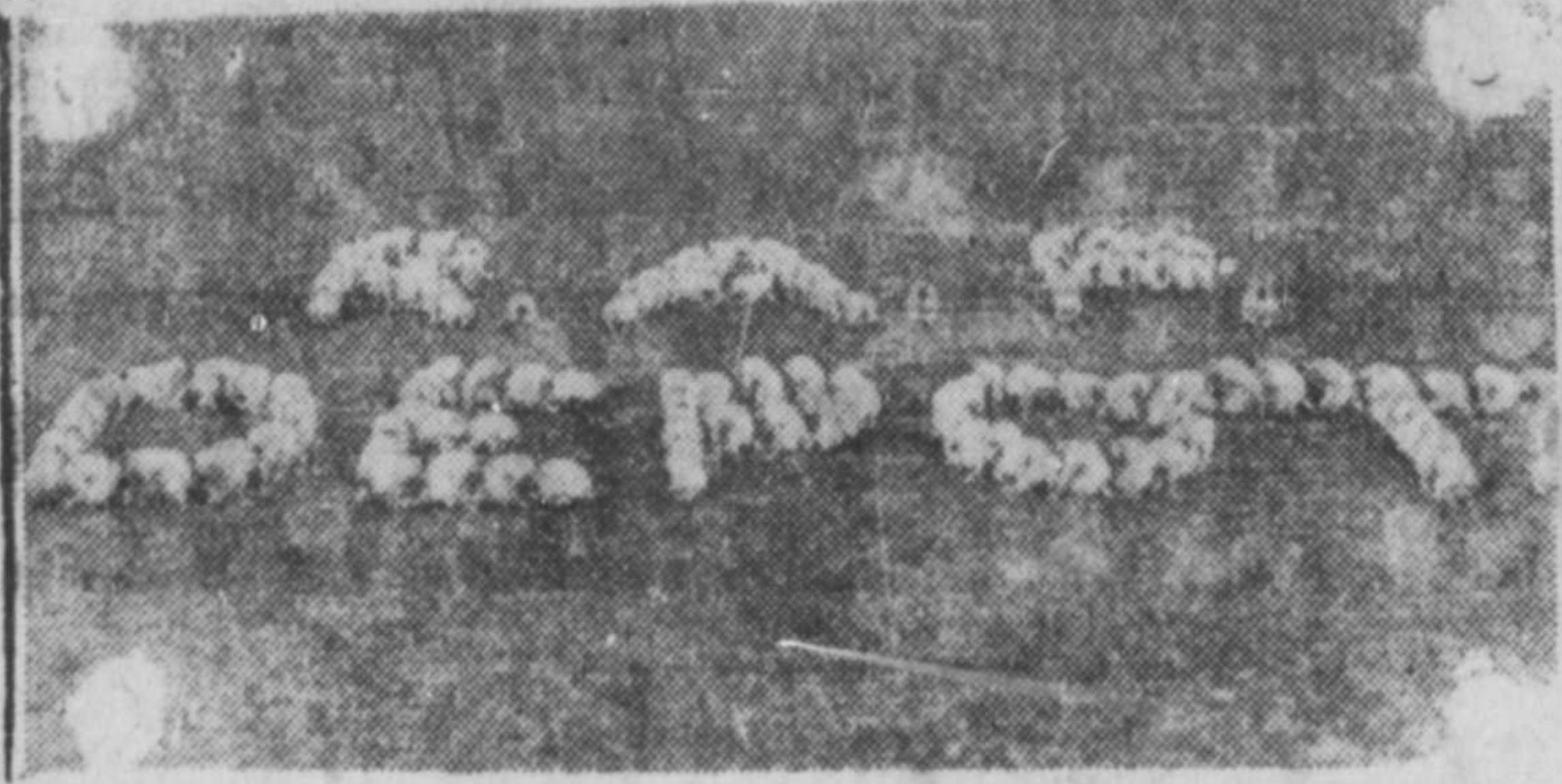
Members of Royal Air Force depot at Uxbridge, Eng., spell out their initials while training for royal tournament at Olympia.