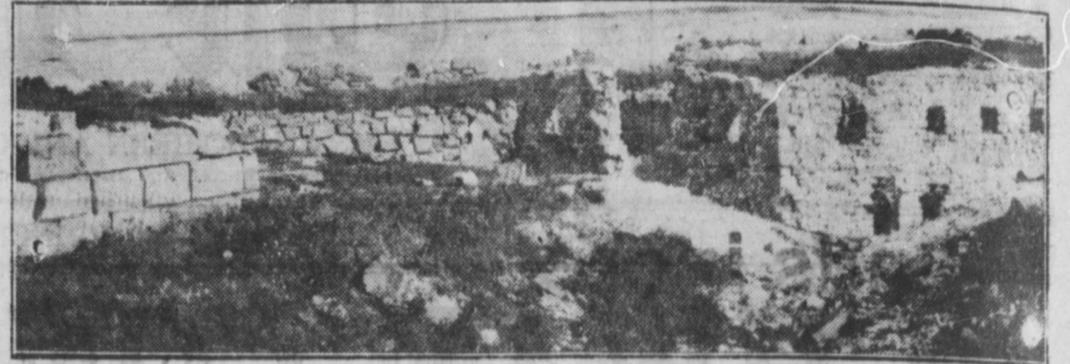
The ruins of old Fort Prince of Wales, opposite Churchill, at the end of Hudson Bay Railway