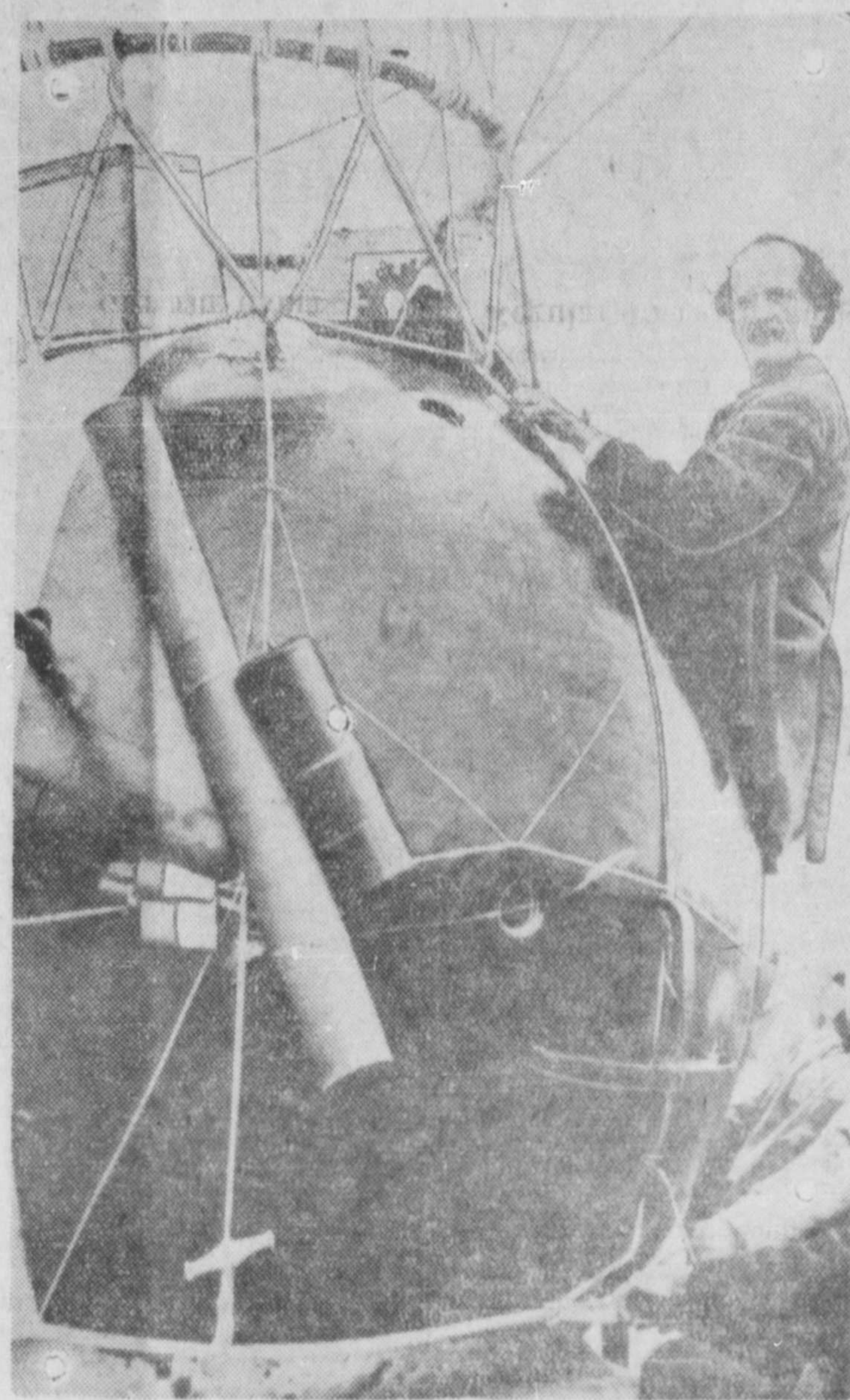
Prof. Piccard of Germany climbing out of aft-metal gondola after postponing balloon ascension to stratosphere ten miles from earth, because of technical difficulties at the start.