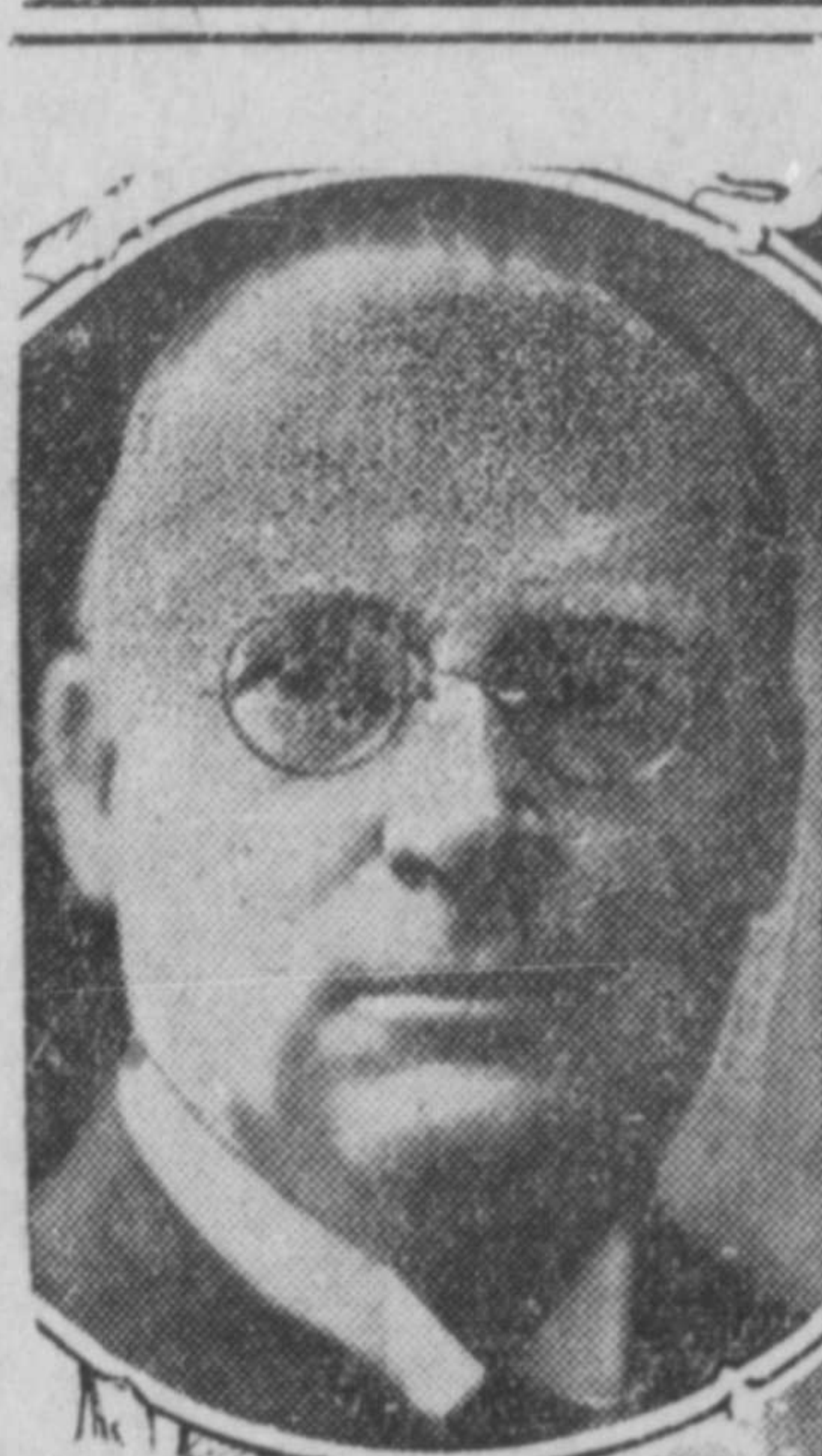
HON. R. B. BENNETT