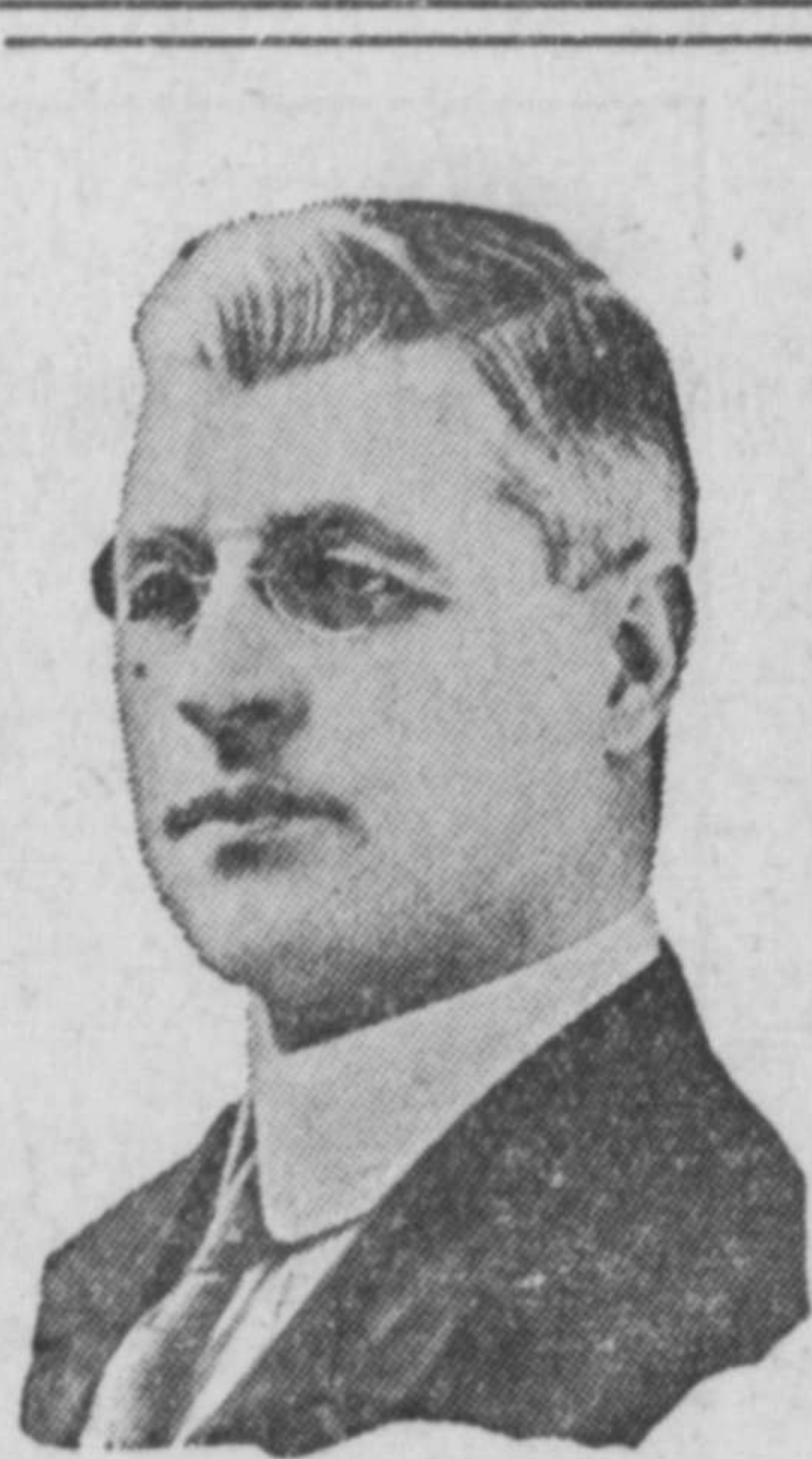
HON. HUGH GUTHRIE