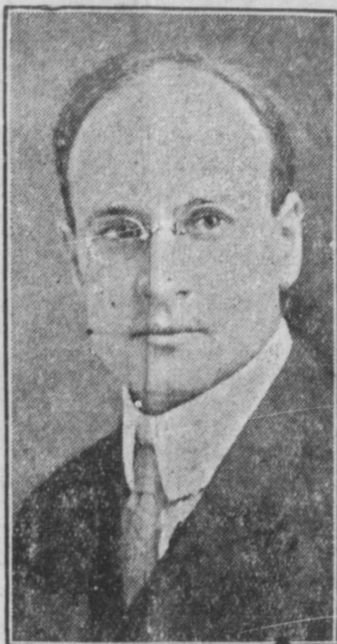
HON. H. H. STEVENS