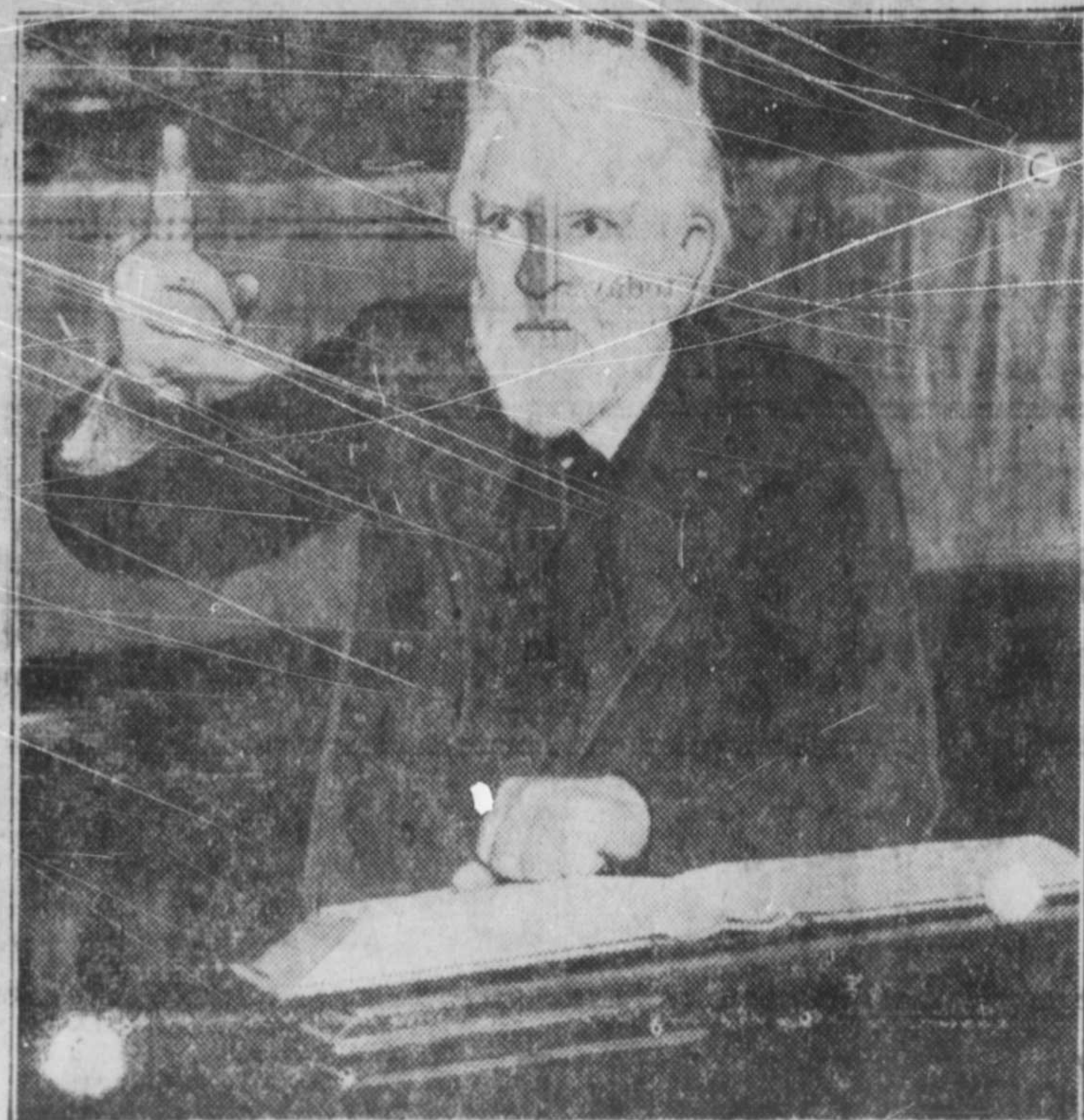
Edwin Markham, noted American poet, as he appeared in pulpit of Maplewood, Mo., Methodist church, recently, when he spoke on Gravity and Gaiety of poetry.

THE CANADIAN SHREDDED WHEAT COMPANY, LTD.