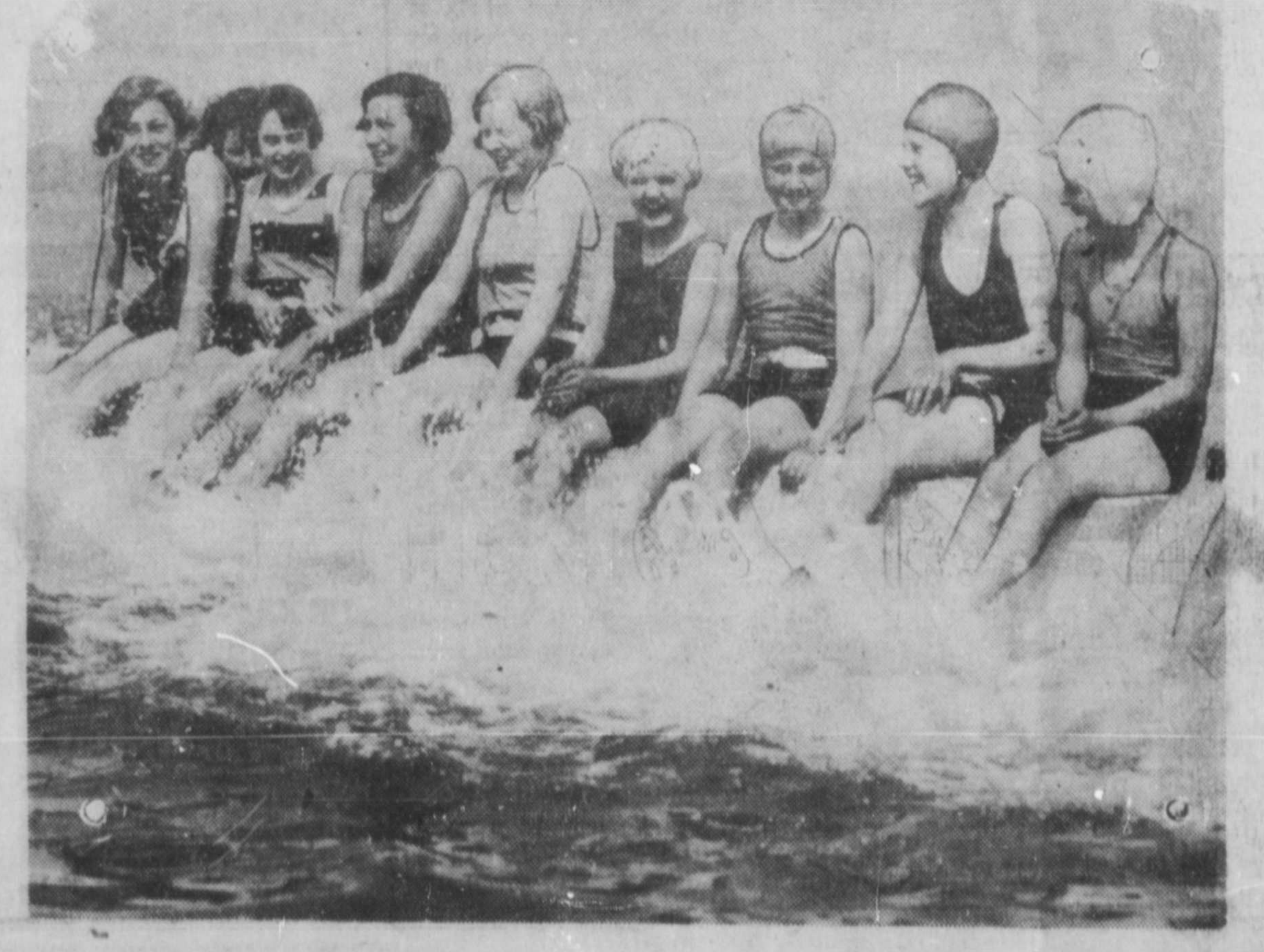
Row of happy Irish lassies splashing as they sit on breakwater at Bangor County Down, Ireland

McRae Bros. Records, Victrolas, Orthophonic Victor Radio Receivers.