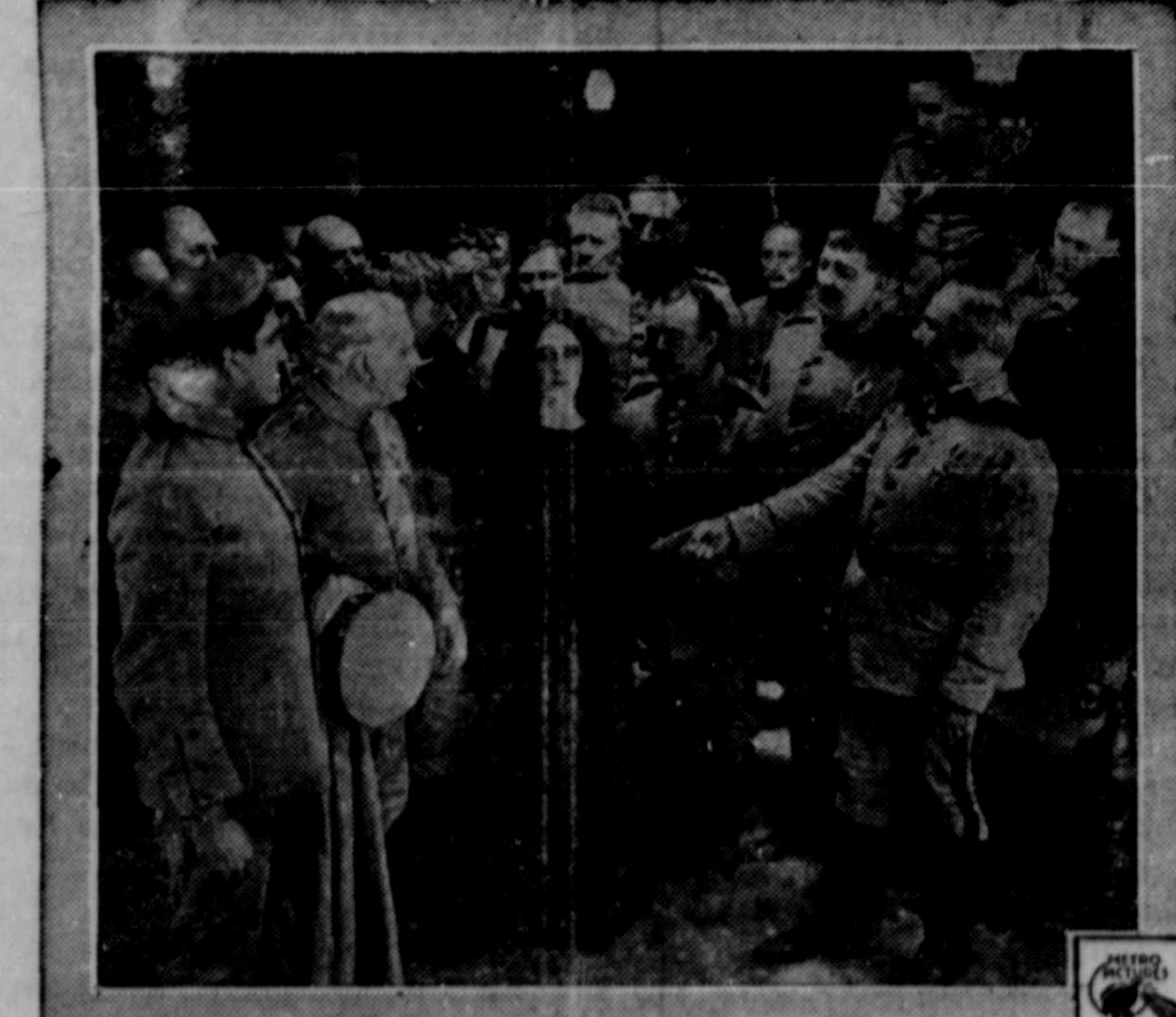
RITA JOLIVET in "LEST WE FORGET"

MARINE INSURANCE FIRE INSURANCE REAL ESTATE PHONE BLUE 68, WESTHOLME THEATRE BLOCK, P. O. BOX 66.