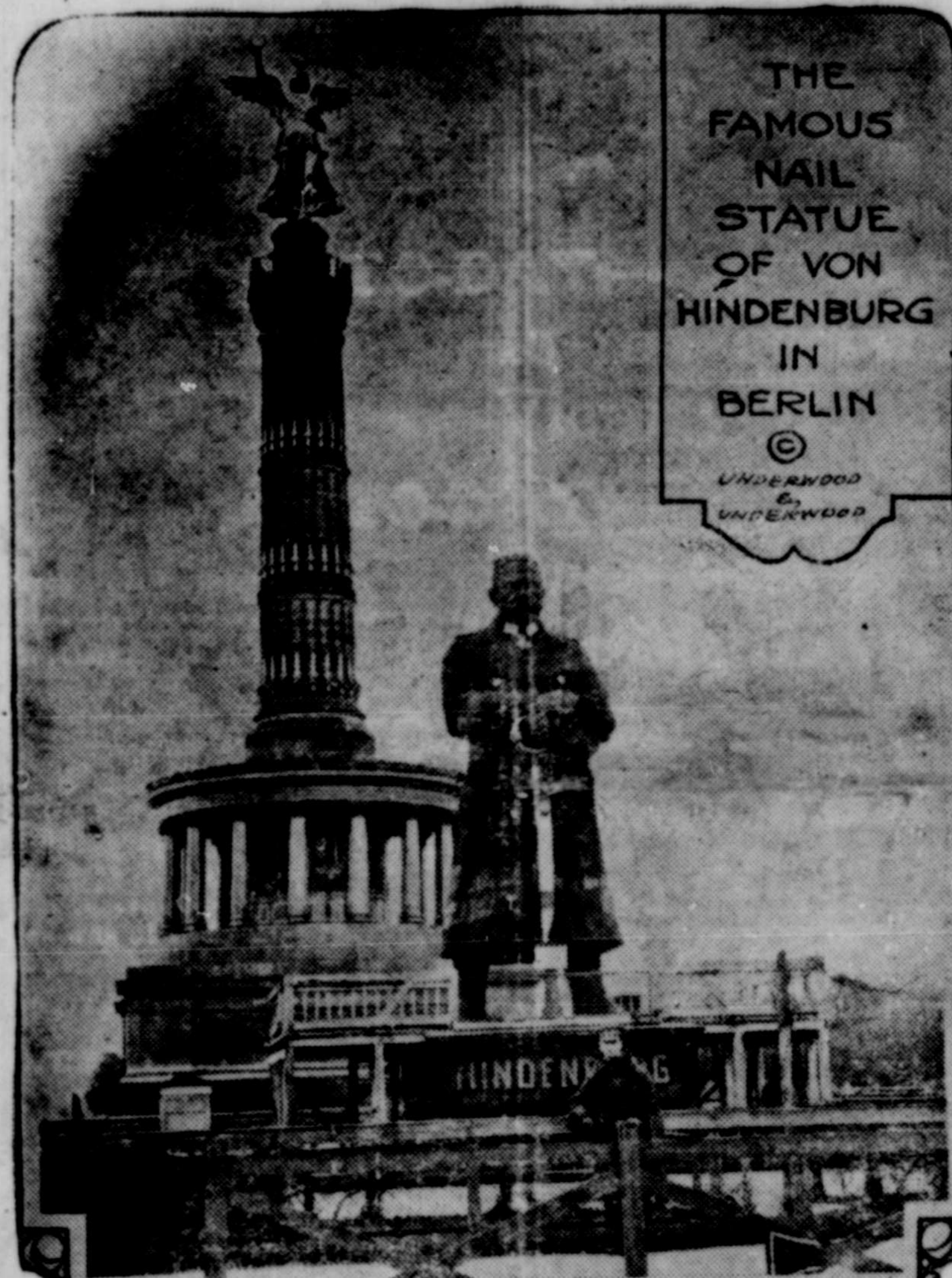
THE FAMOUS NAIL STATUE OF VON HINDENBURG IN BERLIN