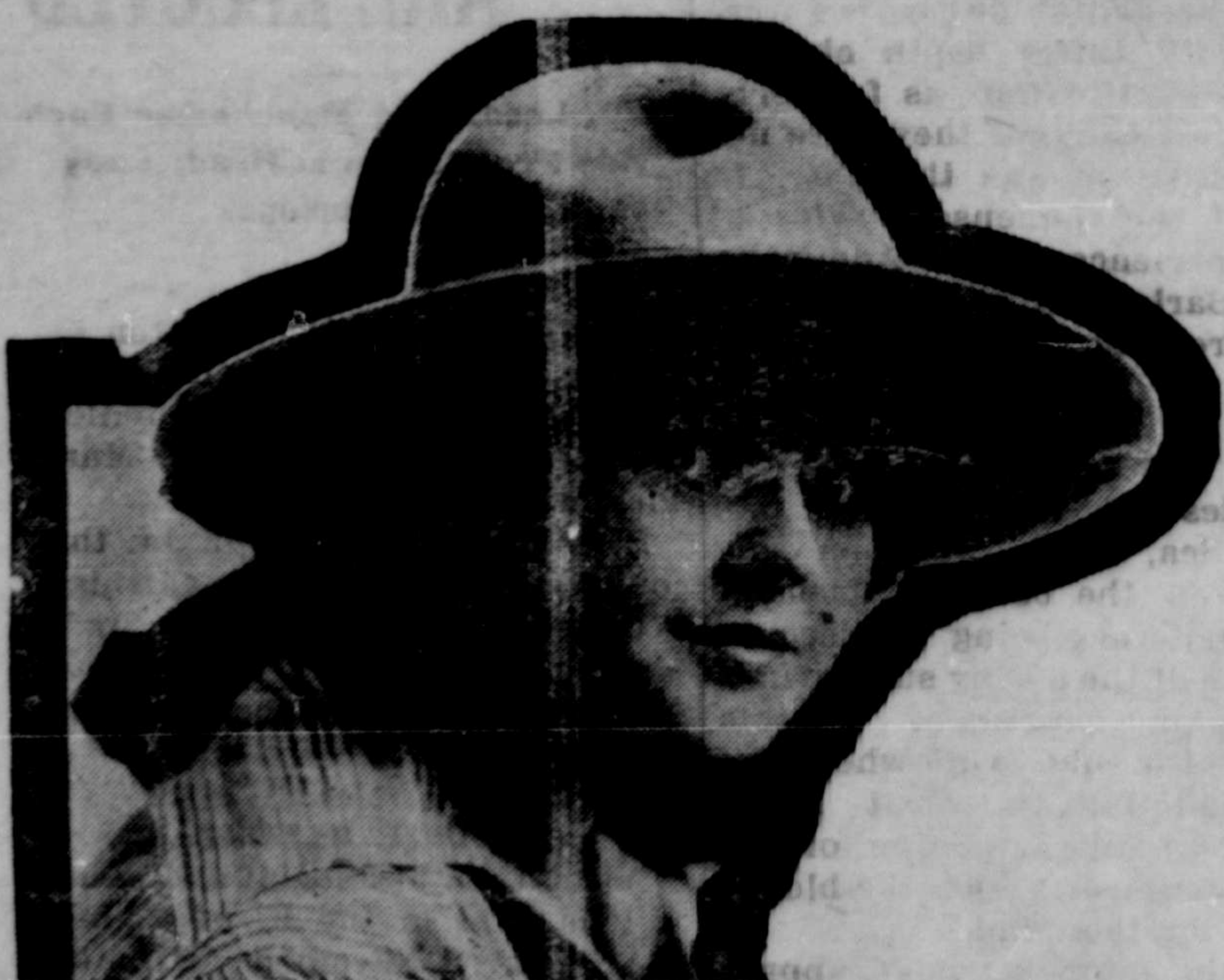
Carol Holloway appearing tonight at the Empress Theatre in the great circus serial, "The Iron Test"