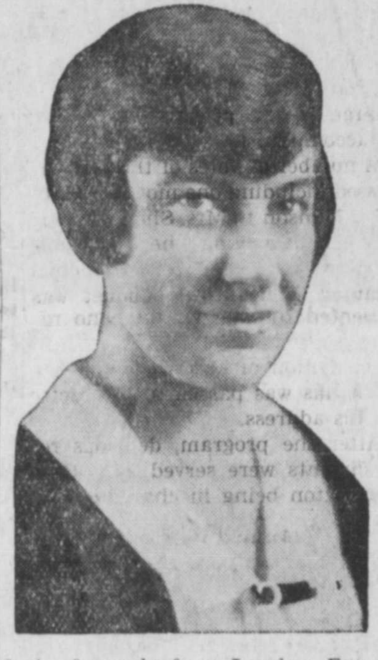
Lady, formerly from London, England will demonstrate here

how to make the best use of her new servants.