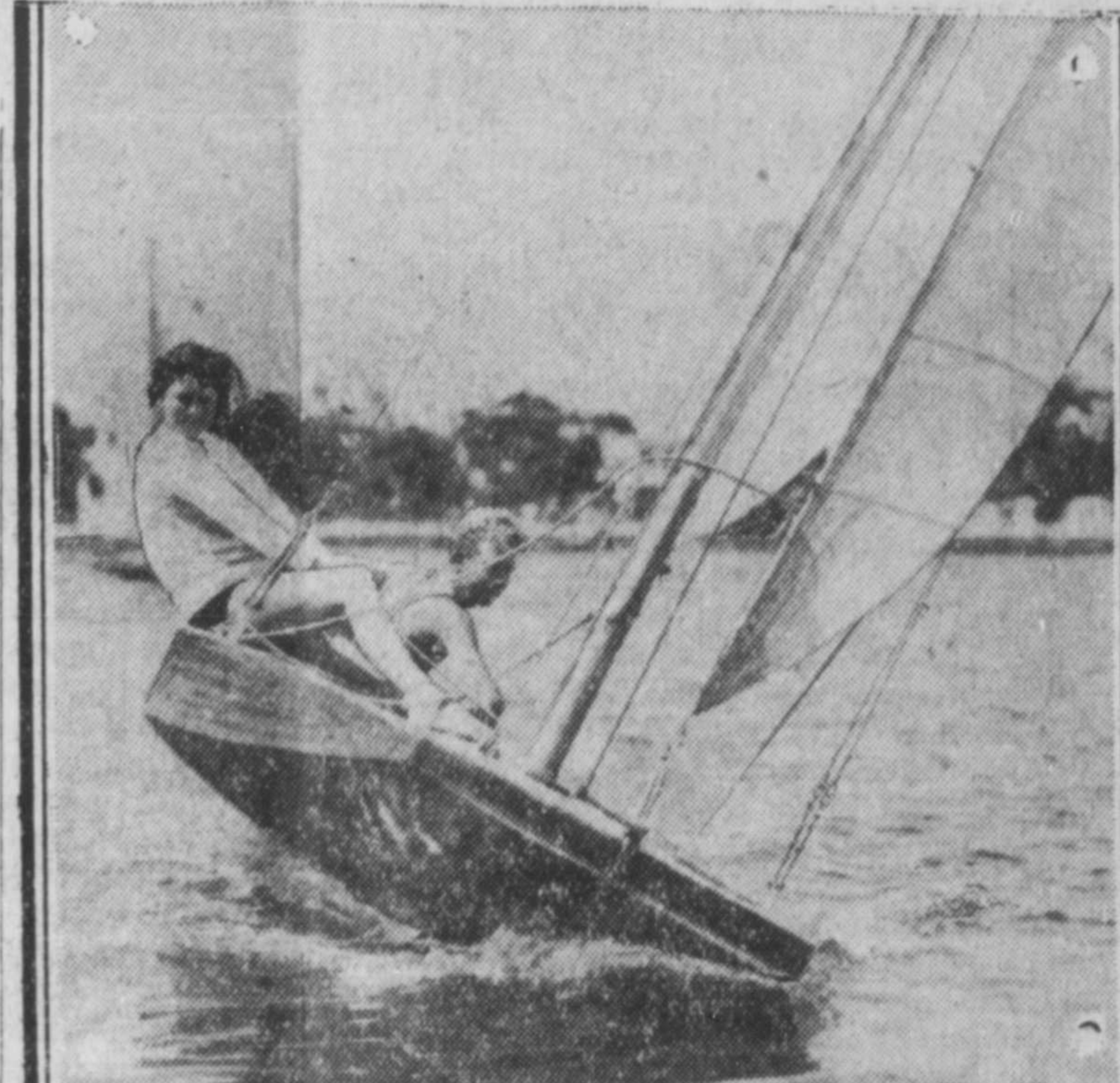
Tiniest of racing sail boats, Skimmers, sailed by young boys and girls, will be admitted to national competition for first time during fourth annual winter sailing championships off Los Angeles.