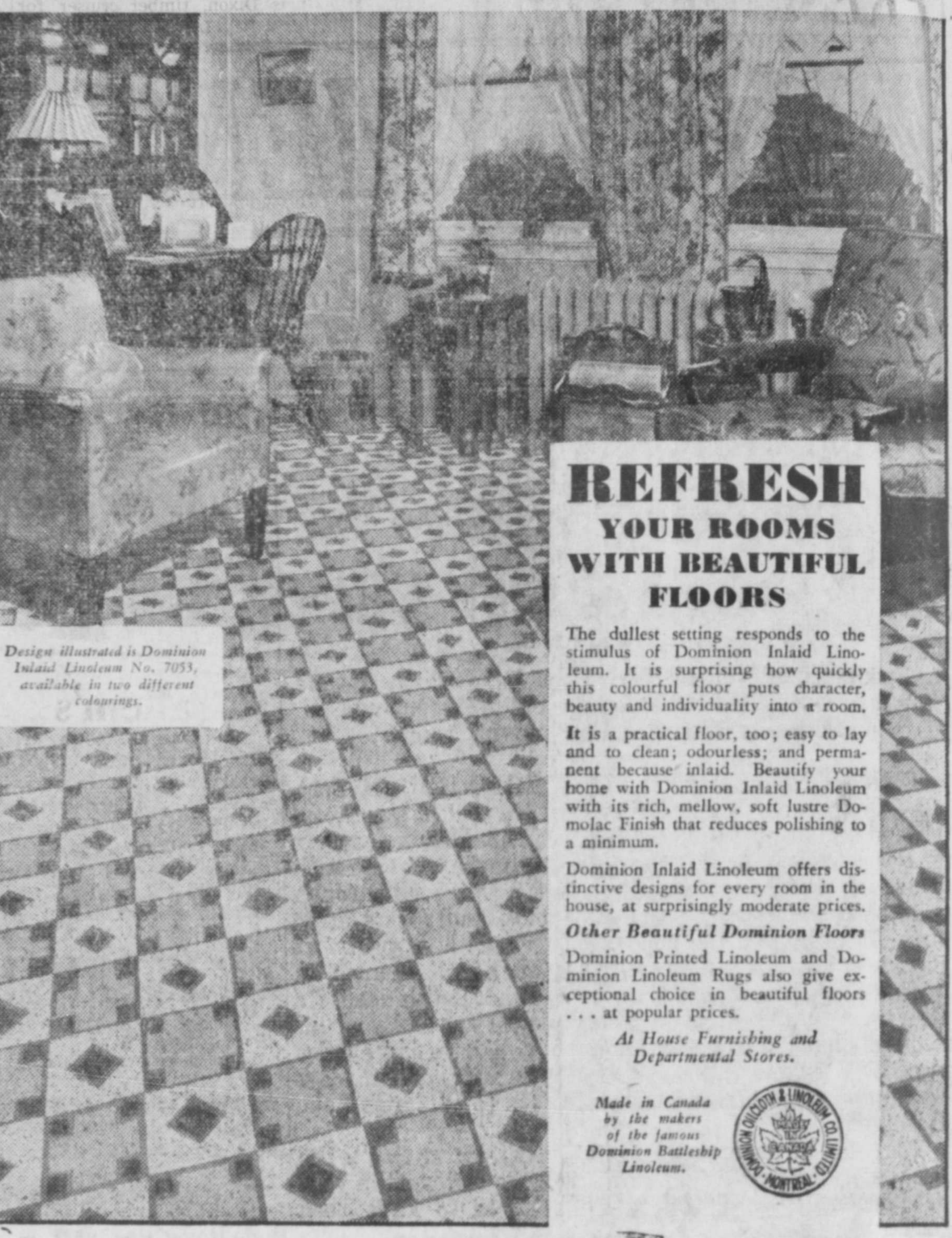
Design illustrated is Dominion Inlaid Linoleum No. 7053, available in two different colorings.