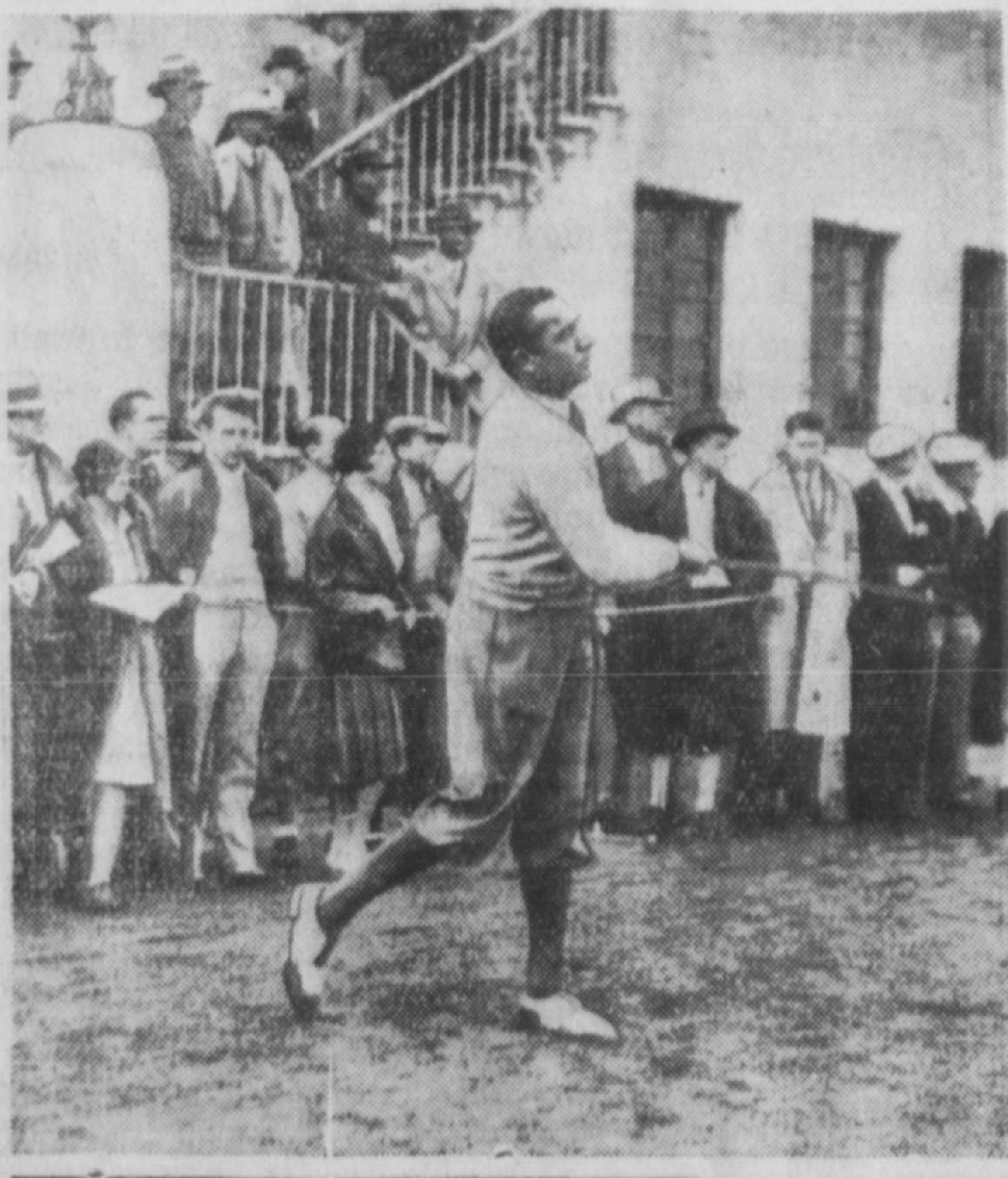
HAGEN TAKES COUNT

Walter Hagen, British open champion, driving, prior to abandoning quest of $10,000 Los Angeles open prize, won by Benny Shute.