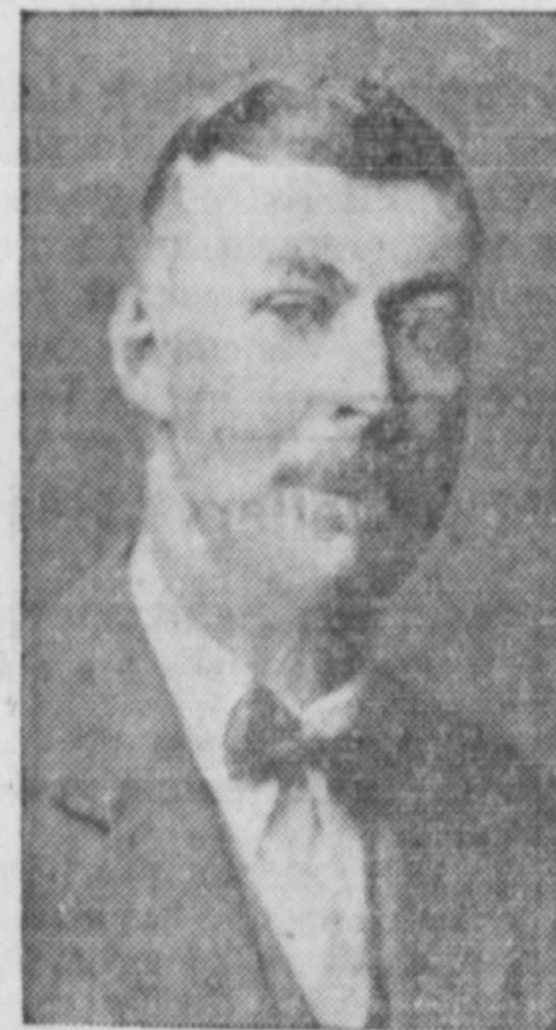
To be new minister of public works.

issued from the district court of Massachusetts