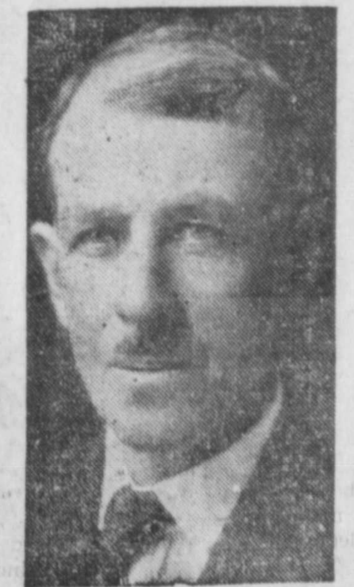
Who is to be removed to London.