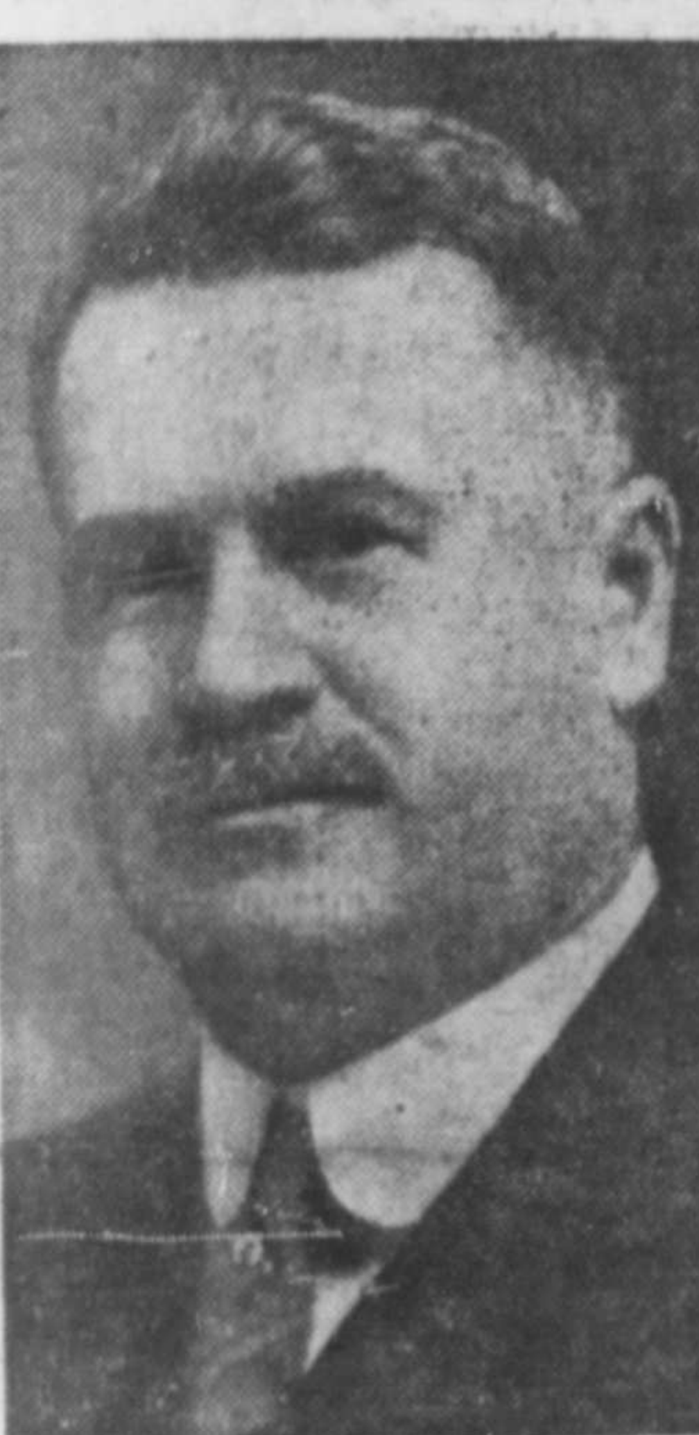
Who announces drastic changes in his cabinet.