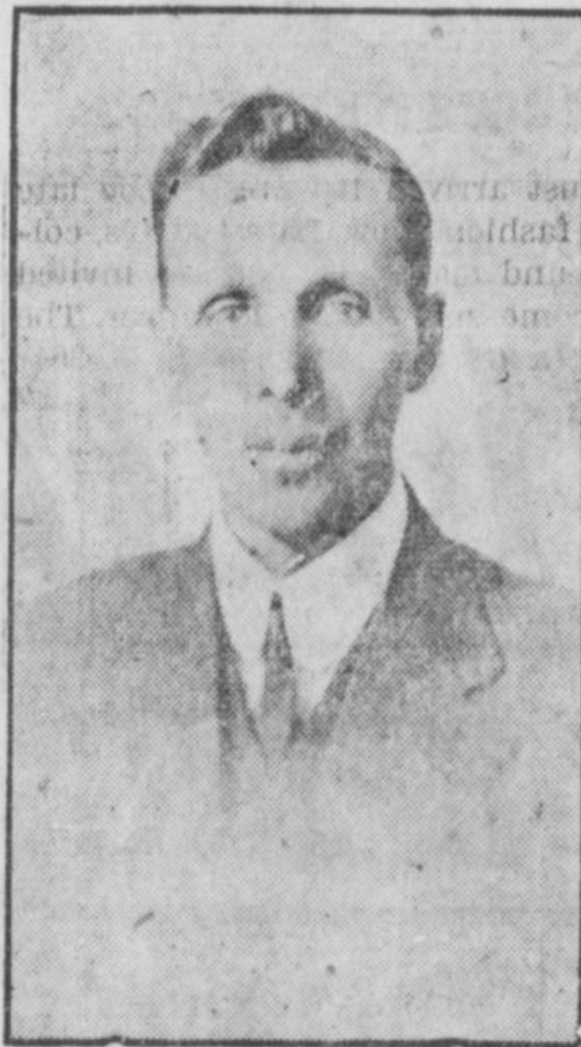
To be new minister of finance.