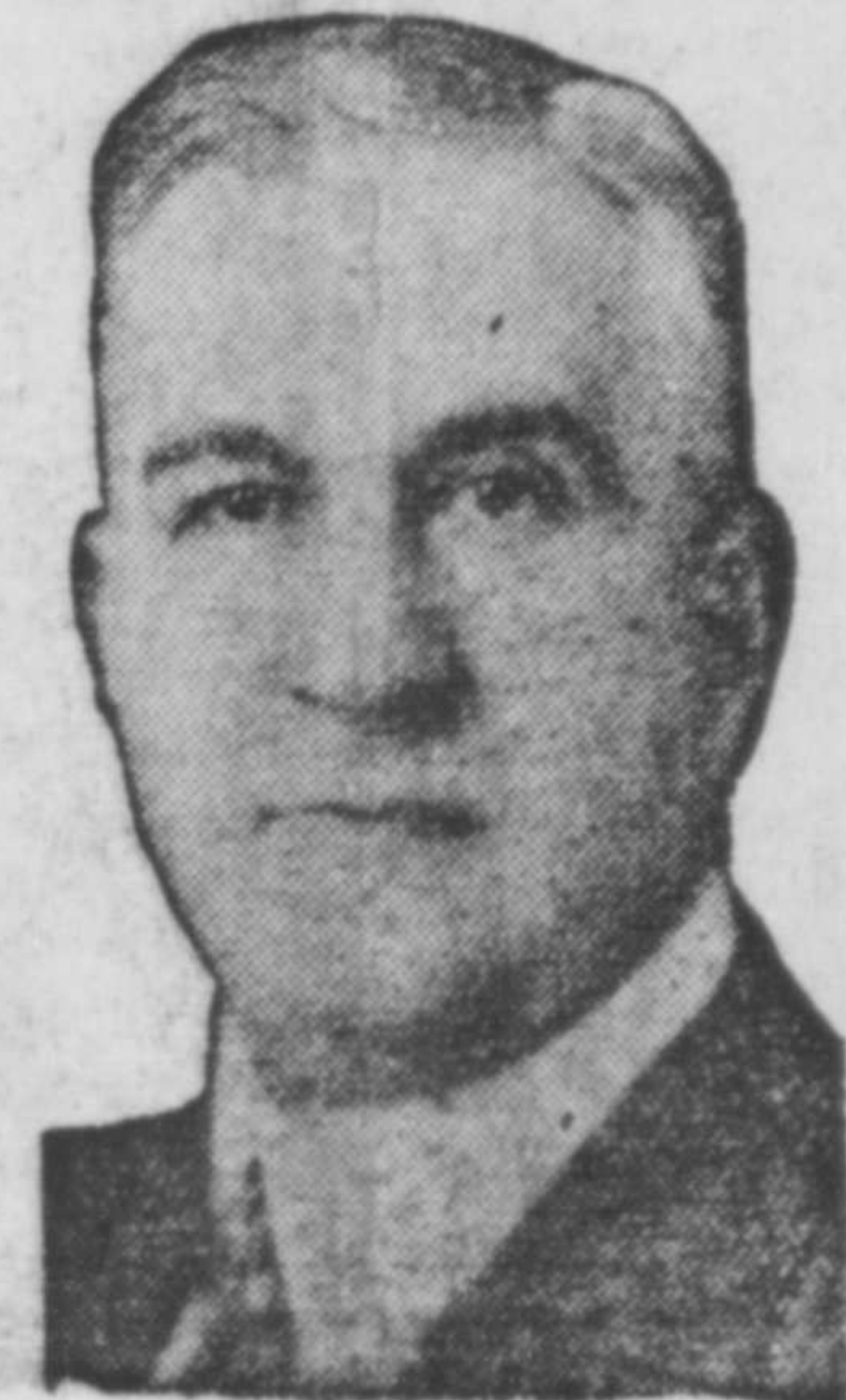
Demoted from minister of finance to president of council.