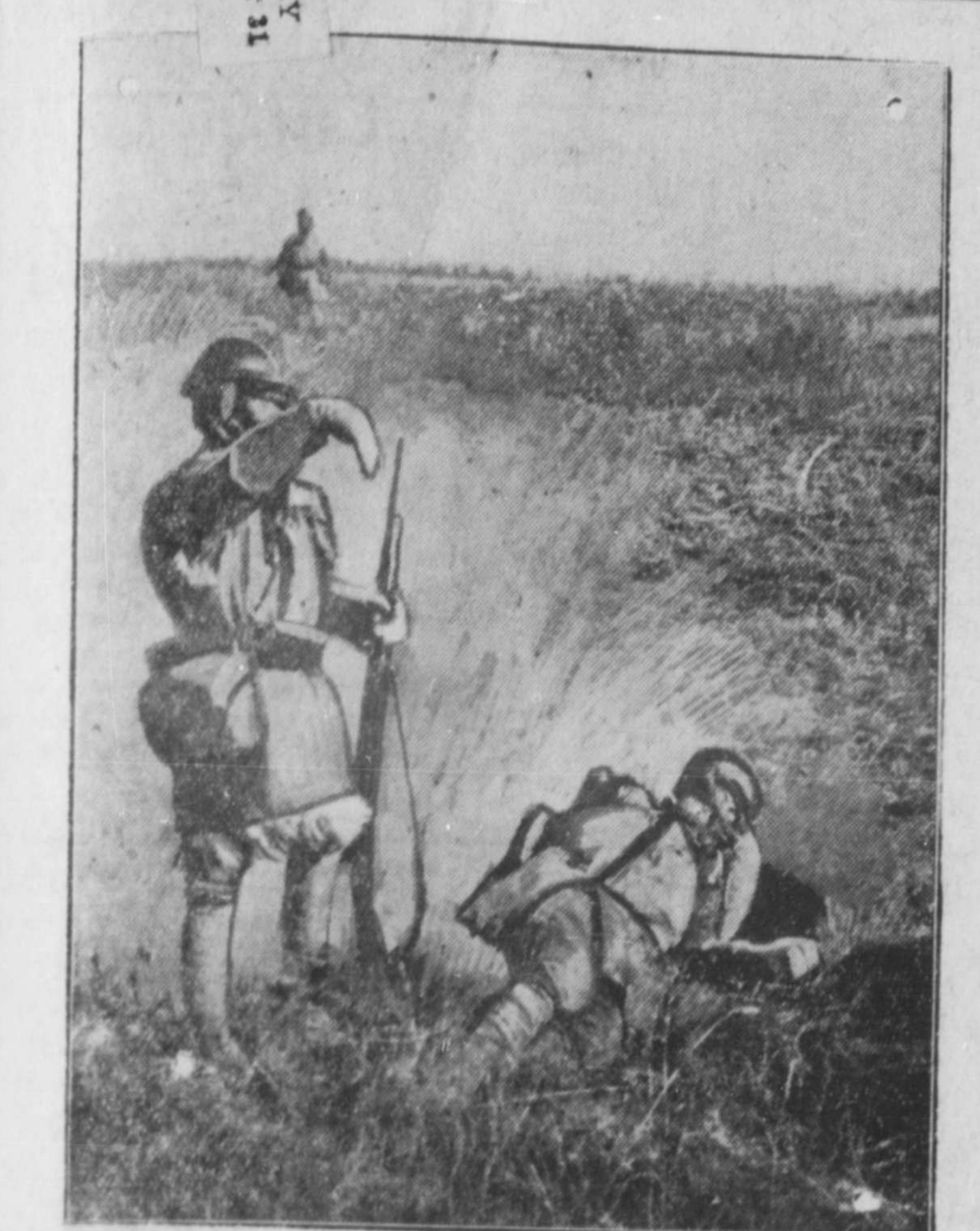
This is at Tsitsihar, too. A Japanese soldier gives the high sign for a stretcher bearer as his pal stops a note of protest from the Chinese defenders. General Shan is billeted just around the corner