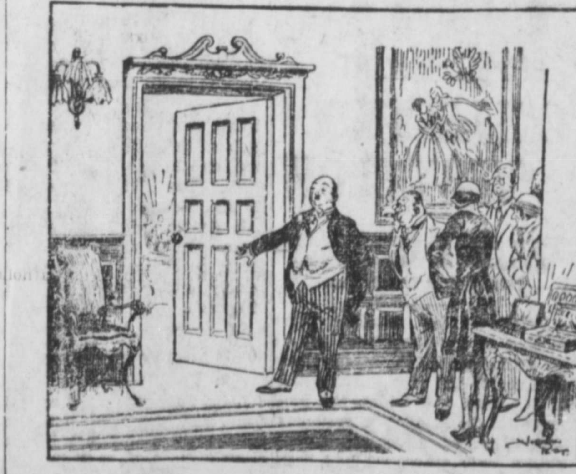
Millionaire father of the bride (showing the presents): "This next room is the toast-rack room—Humorist, London.