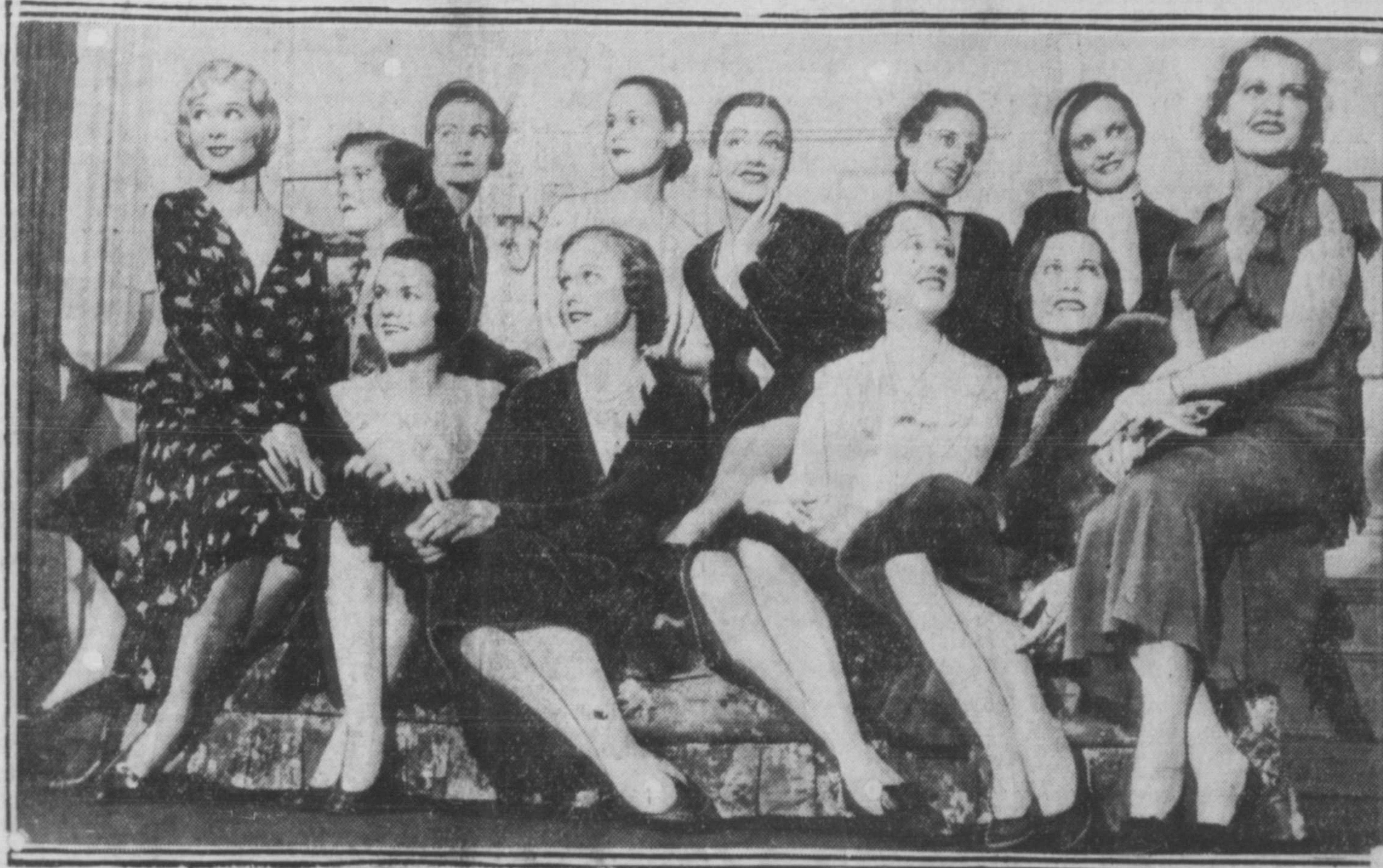
Mlle. Gabrielle Chanel, famous French fashion authority, selects 12 beautiful American girls to be mannequins in her Paris atelier at Hotel Pierre