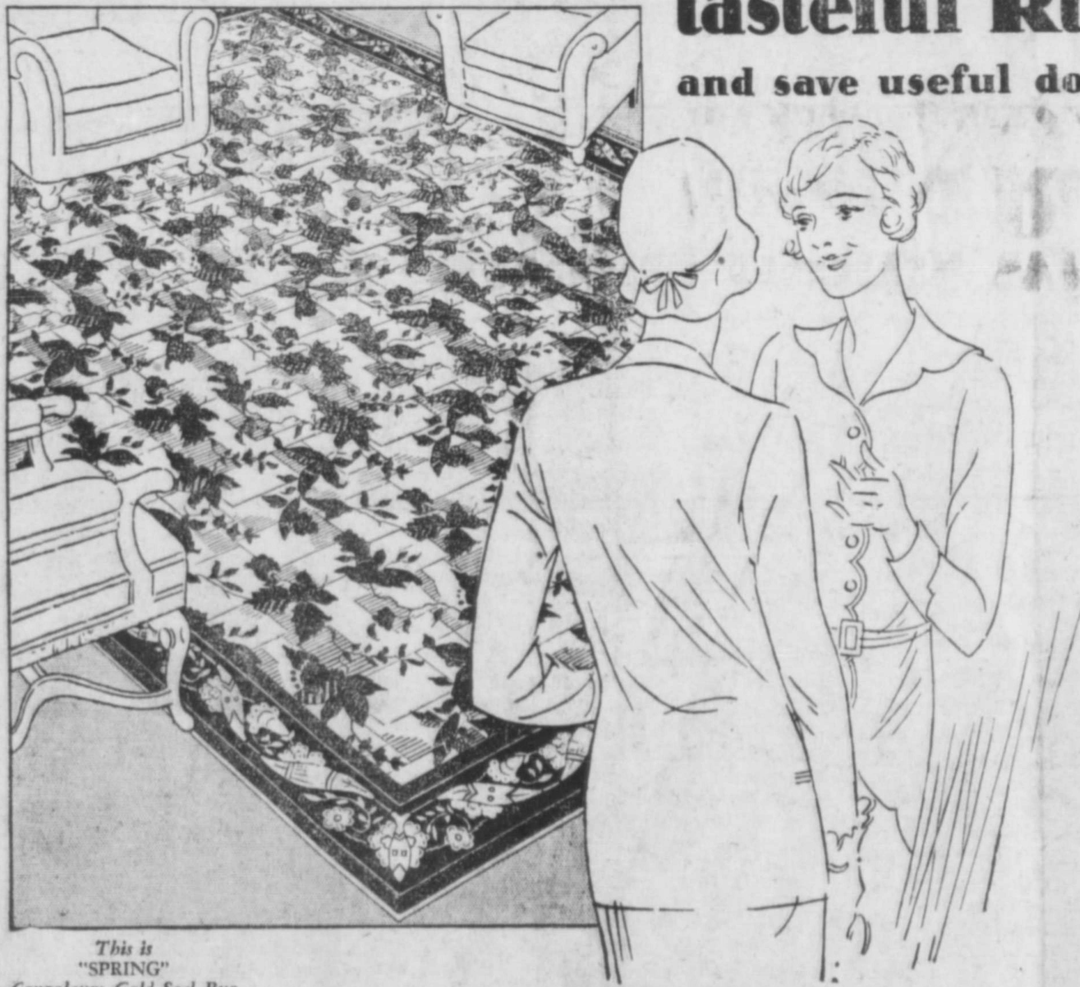
This is "SPRING" Congoleum Gold Seal Rug No. 613

A smart new CONGOLEUM Gold Seal Rug, with its harmonious colouring, will give your room a festive air you will be proud of.