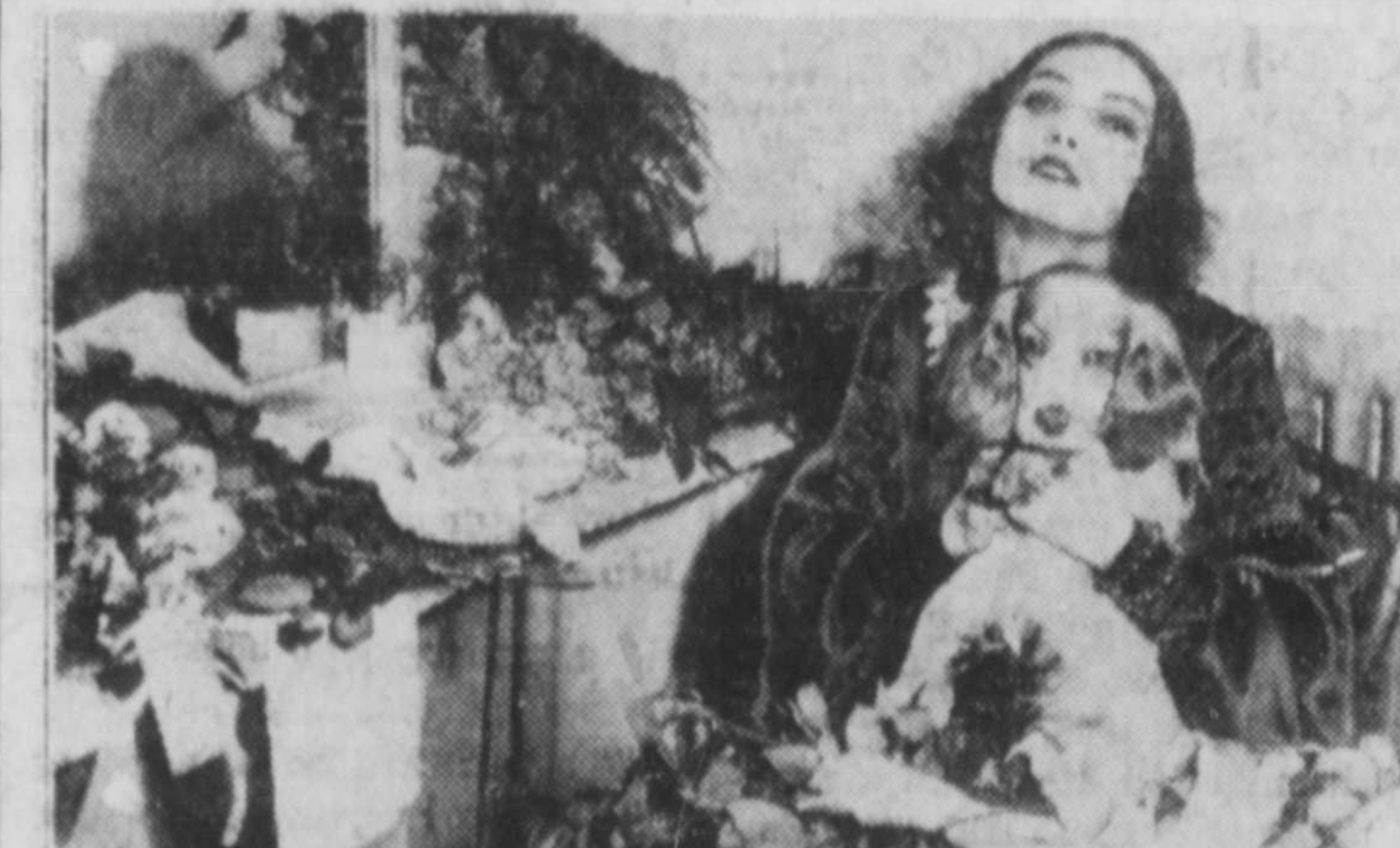
Katherine Cornell, noted actress, after she had scored a success in American premier of "The Barrets of Wimpole Street," at Cleveland, recently.

LONDON, Feb. 27.—Like a bad little boy returning home, Sinclair Lewis, American author, is here on his way back to the United States. In an interview yesterday he admitted: "I am curious to discover if they are angry at what I said in Stockholm."