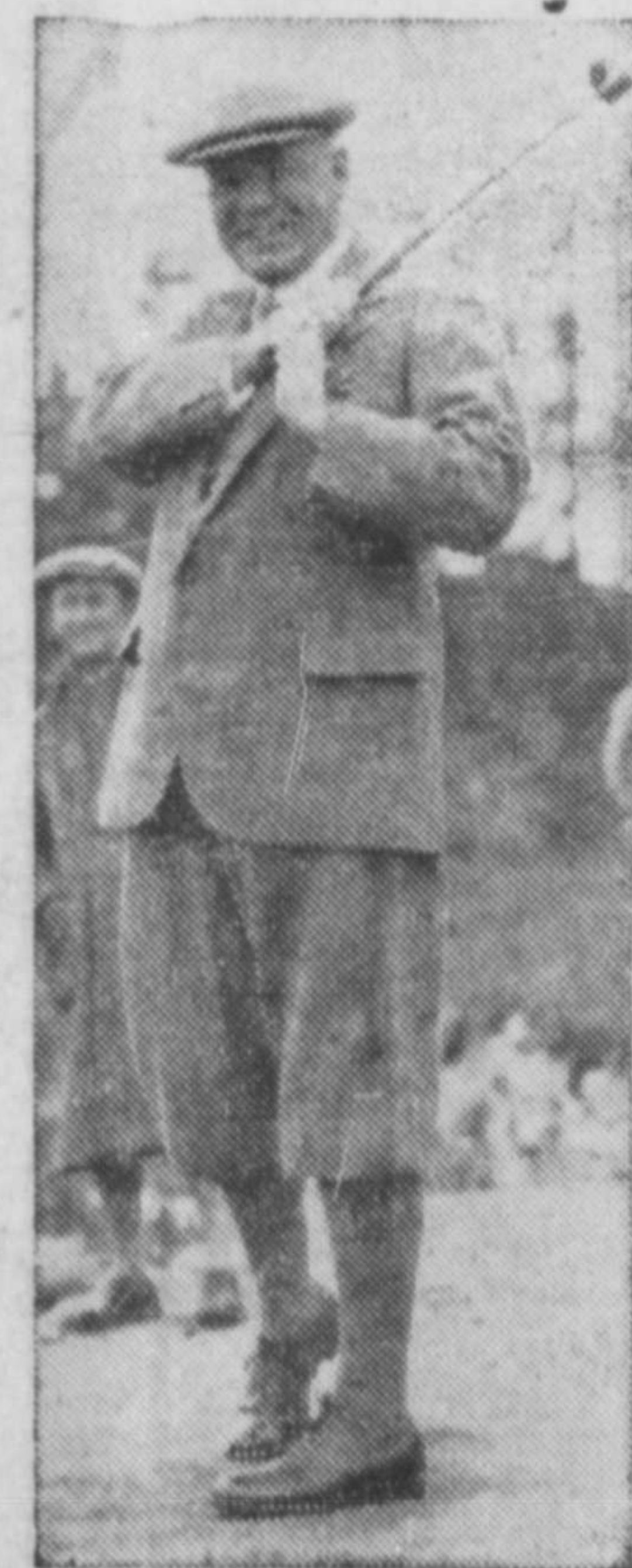
Lieutenant-Governor who is leaving soon for trip to Europe