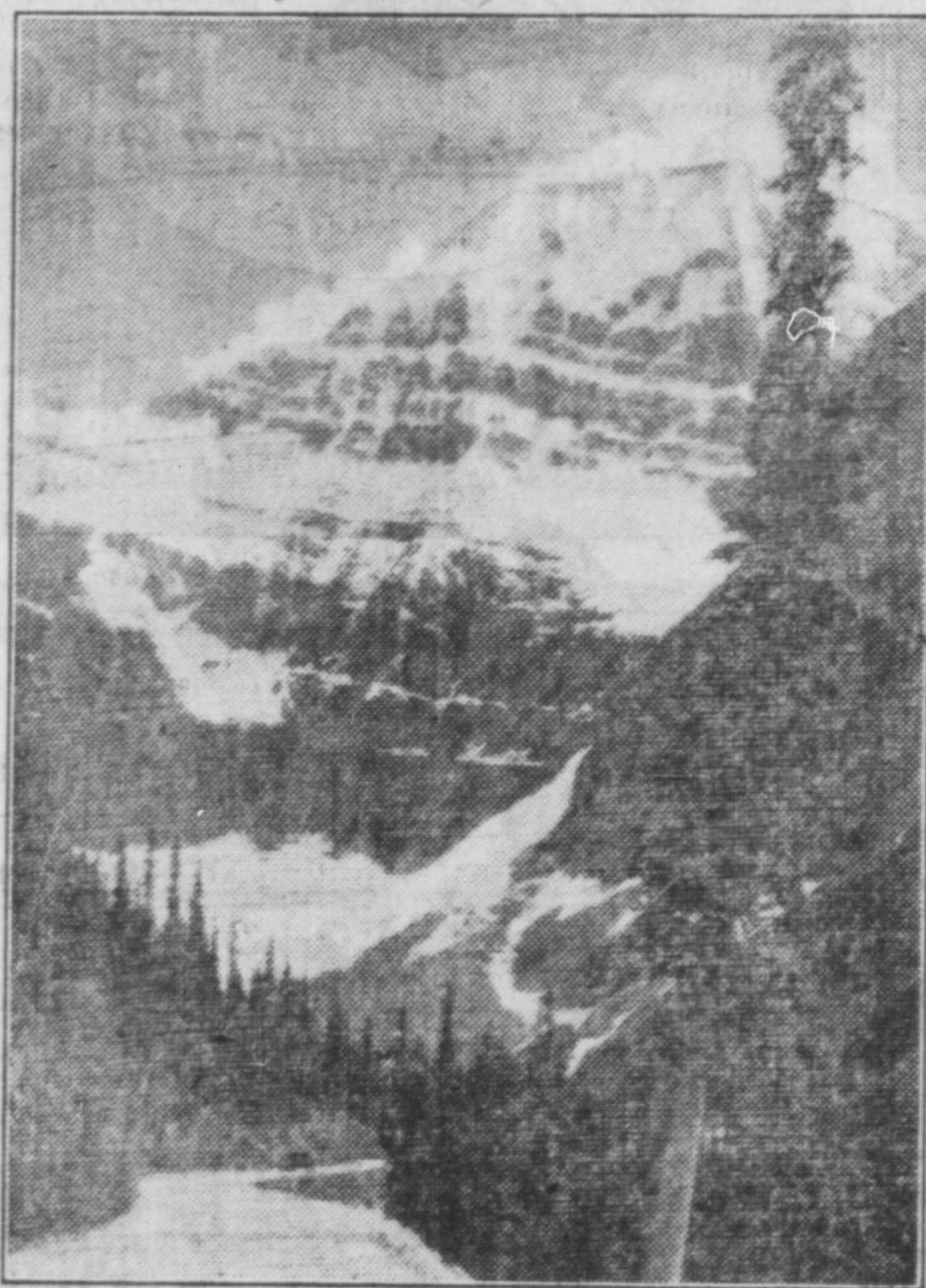
Fleecy clouds cress the summit of Mount Edith Cavell in Jasper National Park and the majestic peak looks down on the motor road at its base where pigmy humans shade their eyes in wonderment while they gaze upward. The approach to Cavell is a delight to trail riders.