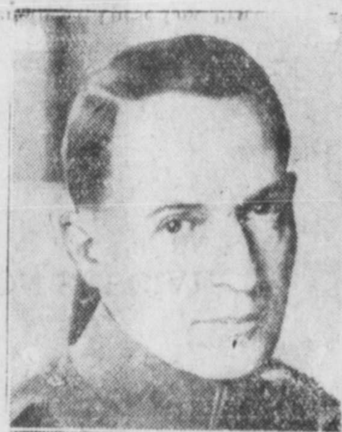
Major-General Douglas MacArthur, scion of fighting stock and much decorated warrior, who is new chief of staff of United States army.

They will take up residence in the Rand Block upon returning to the city.