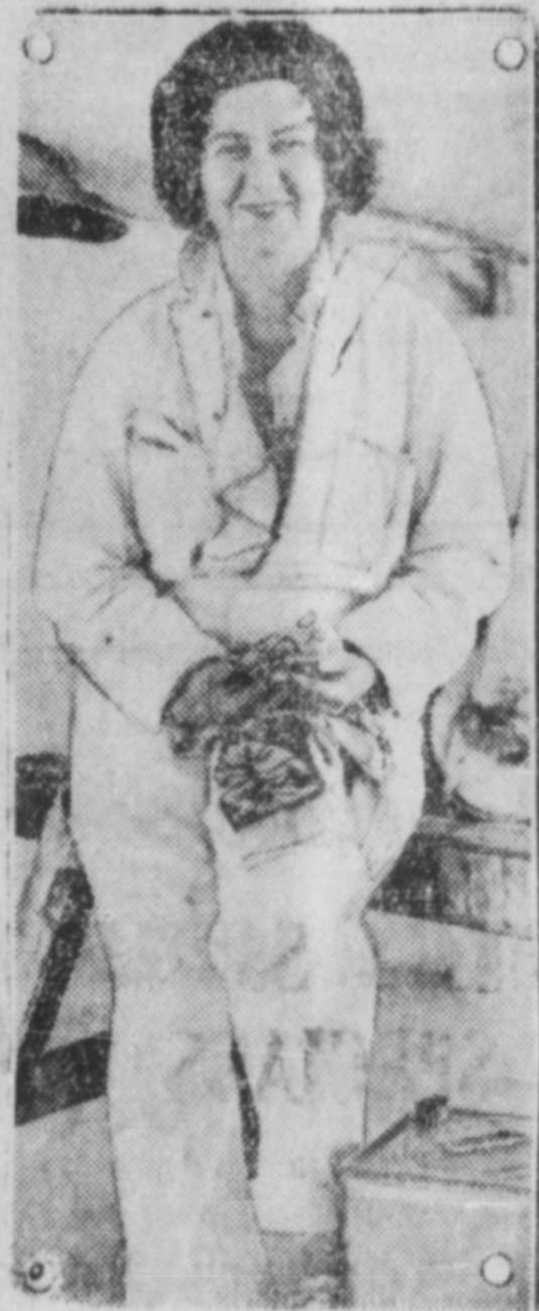
Laura Ingalls, St. Louis, Mo., aviatrix is in New York, preparing for her prospected solo flight attempt of the Atlantic.