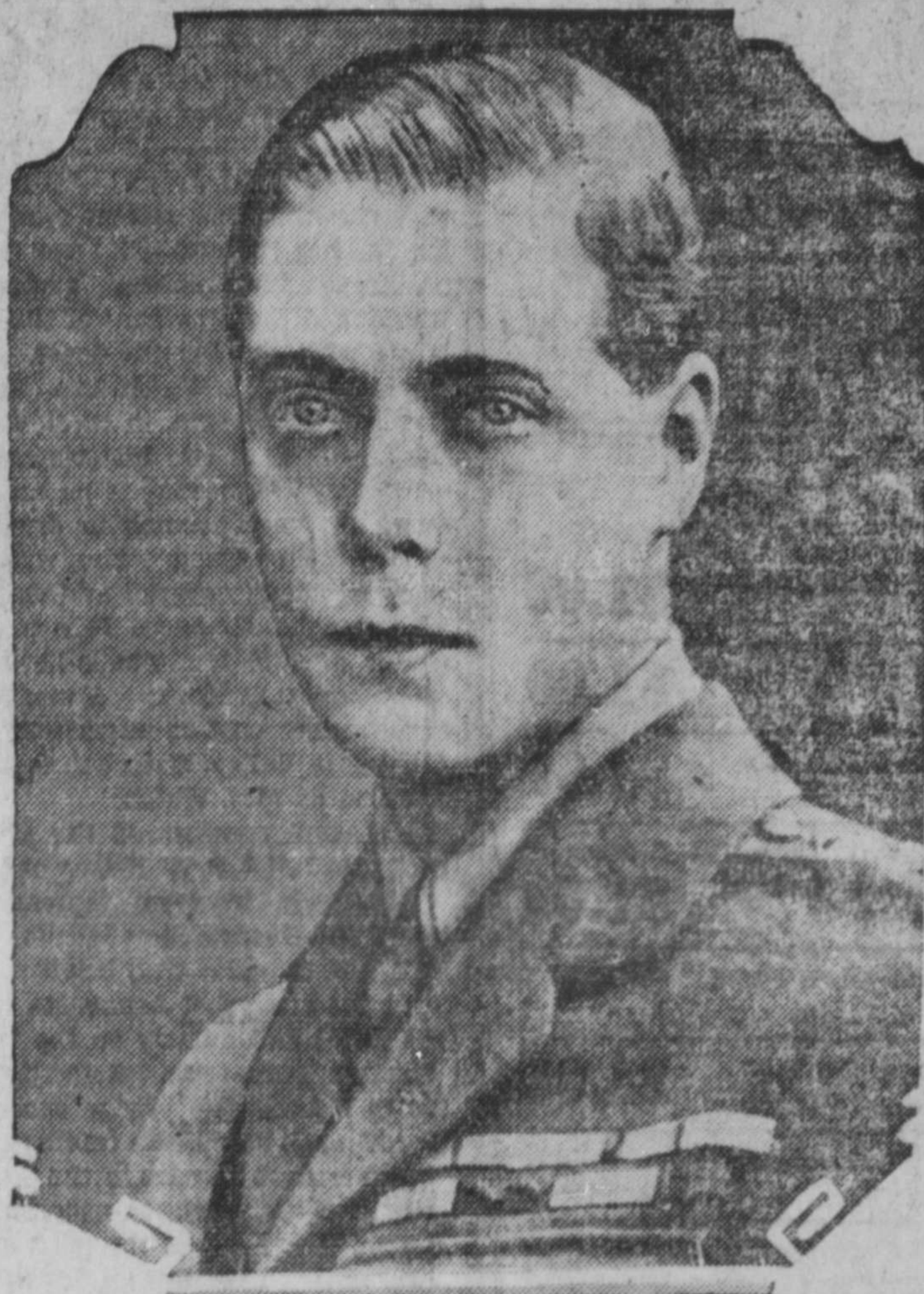
Prince of Wales who was hurt yesterday when his auto struck fence after collision.