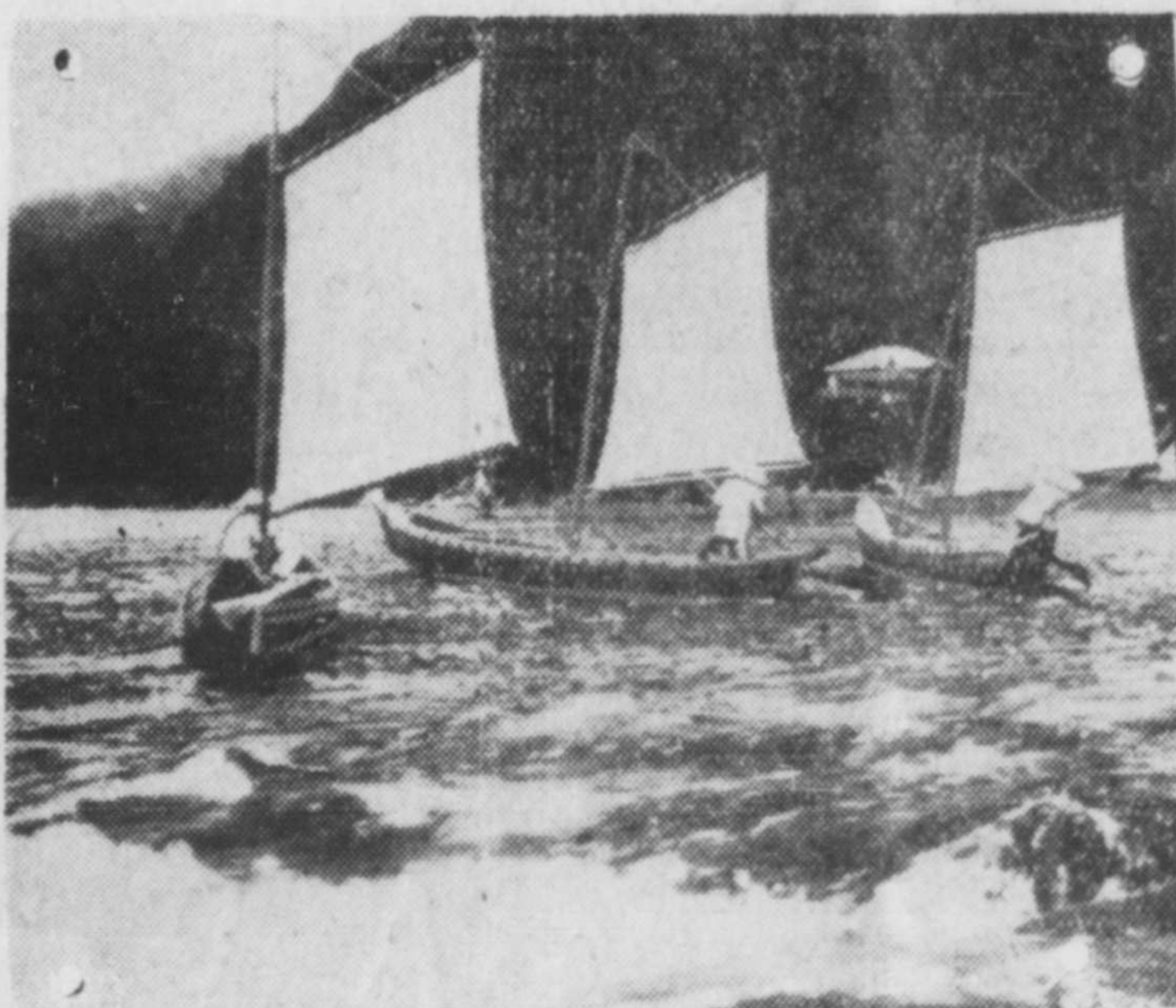
Turbulent waters of Kiso river, Japan, are successfully navigated by these venturesome boatmen, who ply hazardous rapids in same type craft their ancestors used thousands of years before them.

from the present system of marketing. Certainly, it could hardly be reasonably expected that a scheme such as that of this spring, which sprang up virtually overnight, could be anything else but a failure. Possibly, if the necessary organization were effected and the essential capital provided, a scheme of co-operative marketing of halibut might be successful. Both these most necessary factors seemed, however, to be lacking in this spring's experiment on the Pacific Coast.