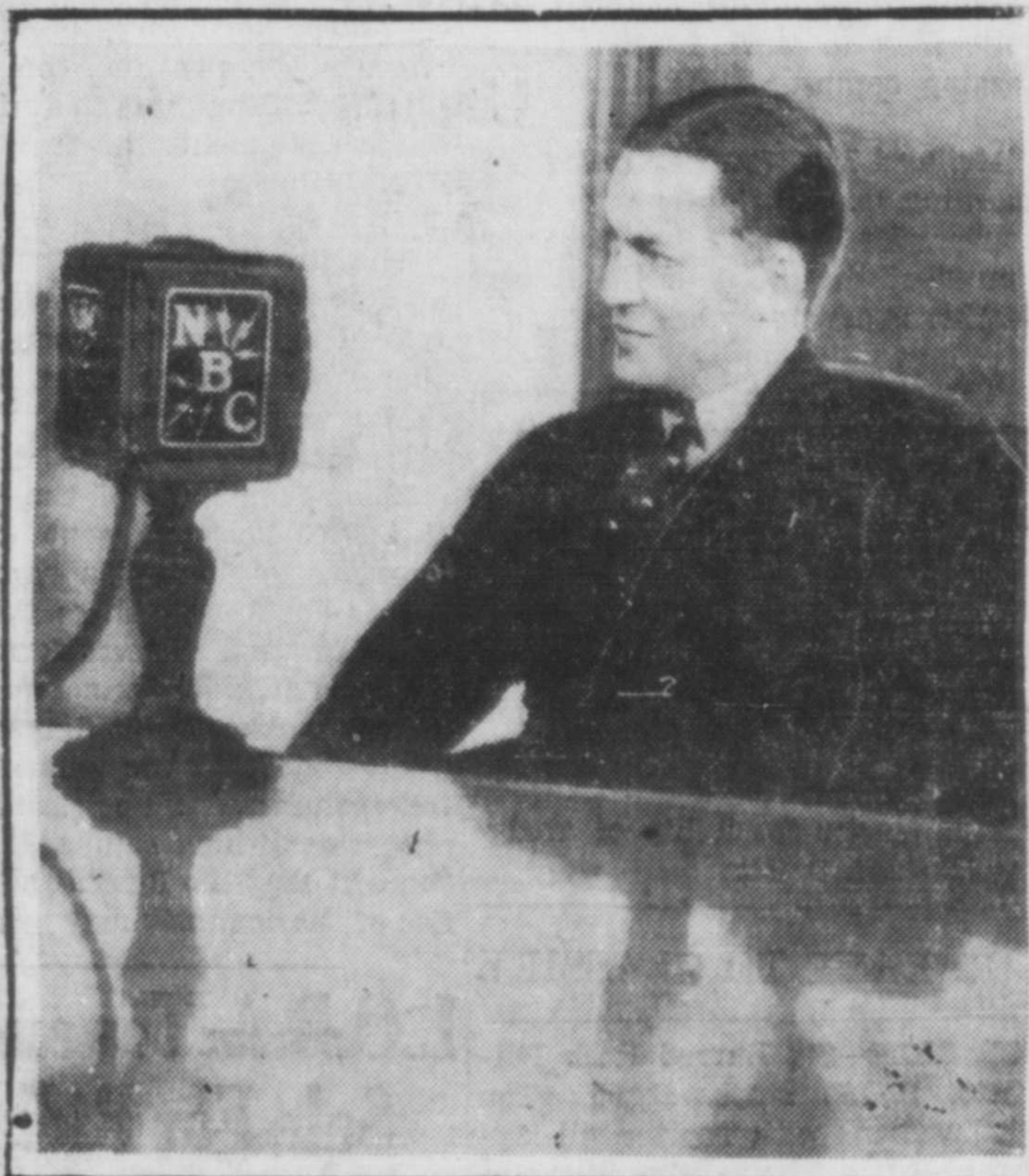
The retired golf champion, better known as Bobby Jones, has accepted officership in the United States Reserve Corps.