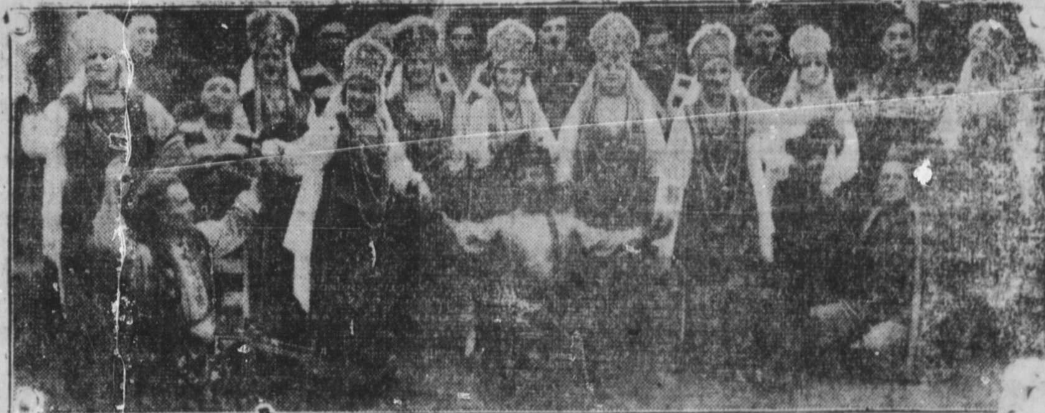
The group of musicians shown above will be heard in Prince Rupert on July 9 and again July 17 in Moose Hall, under auspices of the Prince Rupert Gyro Club.

commissioned by the Russian Czar to draft 100 of the nation's best singers from the Imperial Opera House and Conservatory to form a choir.