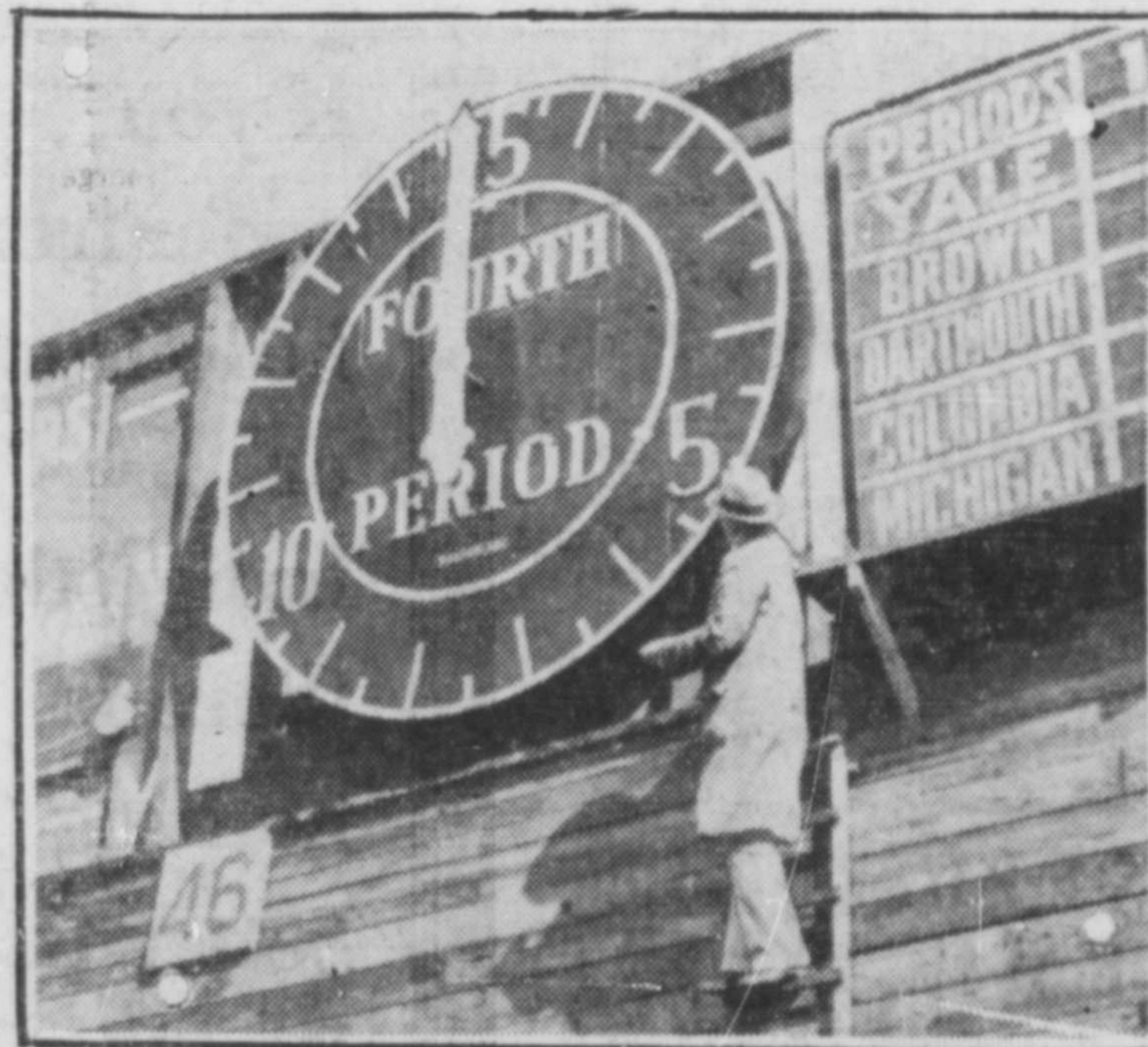
View of clock at Harvard stadium, Cambridge, Mass., to show time of play of spectators. It is the first electrical timing device in history of American football. Dial of the clock is ten feet in diameter