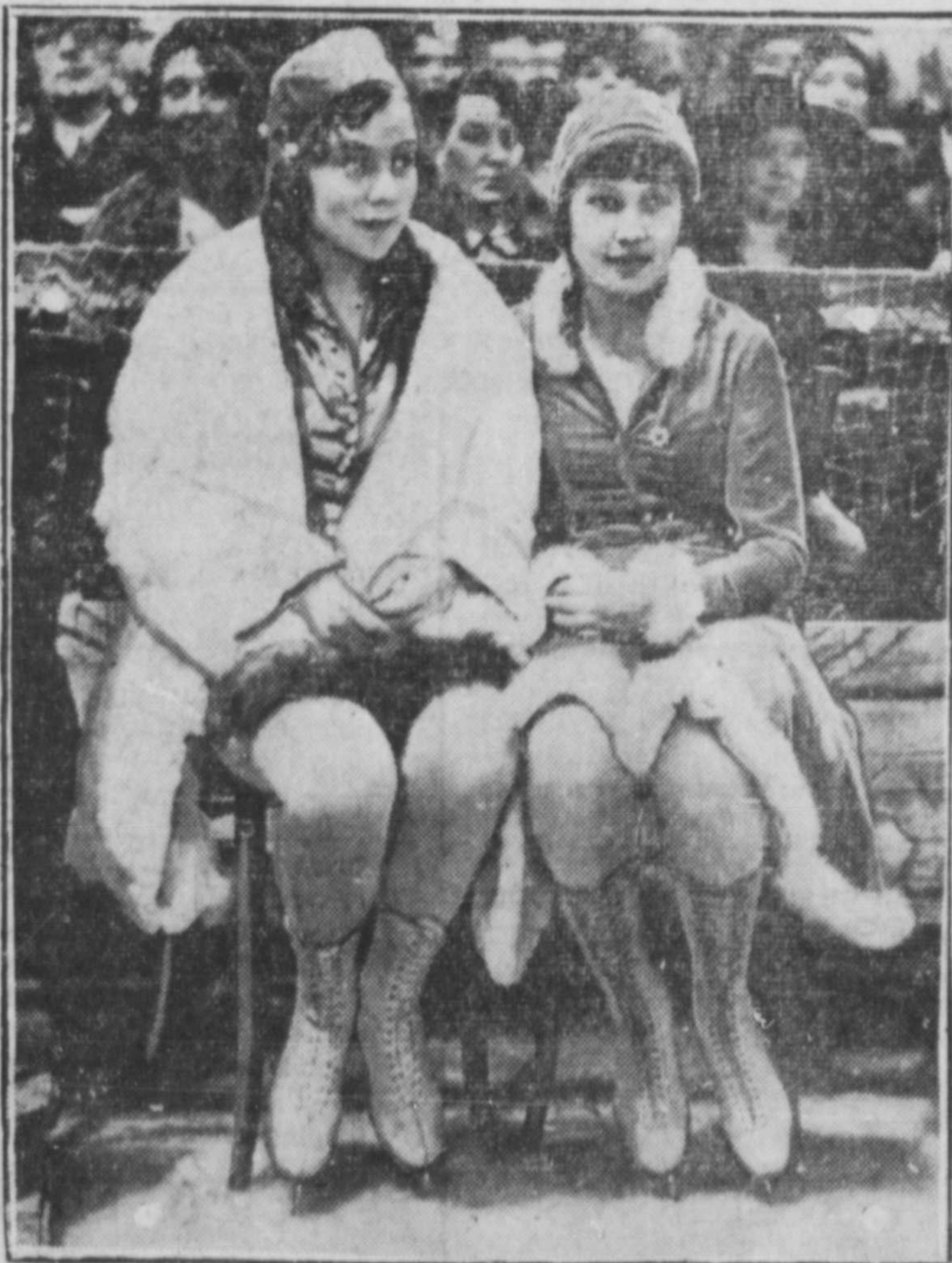
For the fifth successive year, Sonja Heine (left), blonde skating star from Oslo, Norway, retained world's skating championship for women.