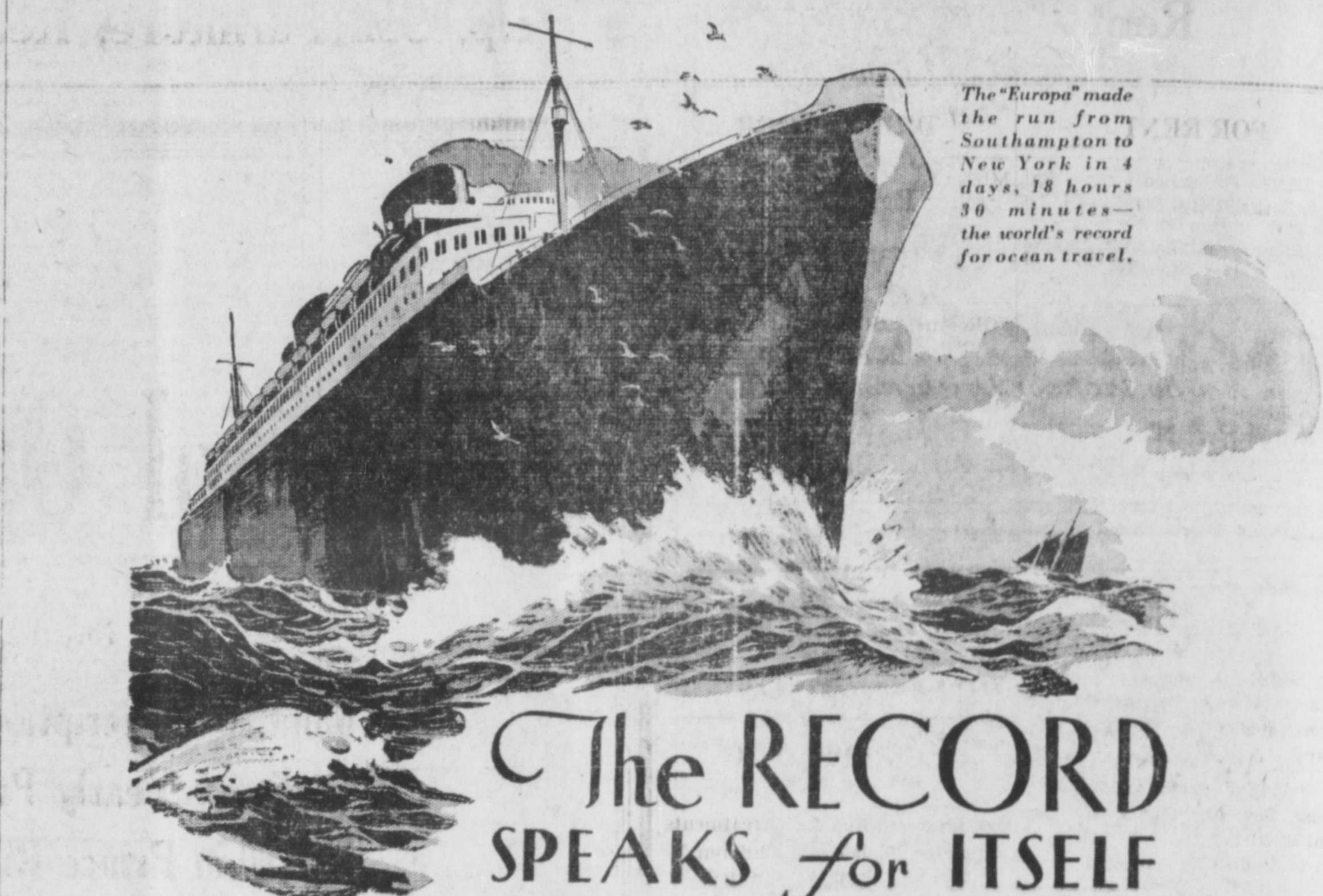
The 'Europa' made the run from Southampton to New York in 4 days, 18 hours 30 minutes—the world's record for ocean travel.