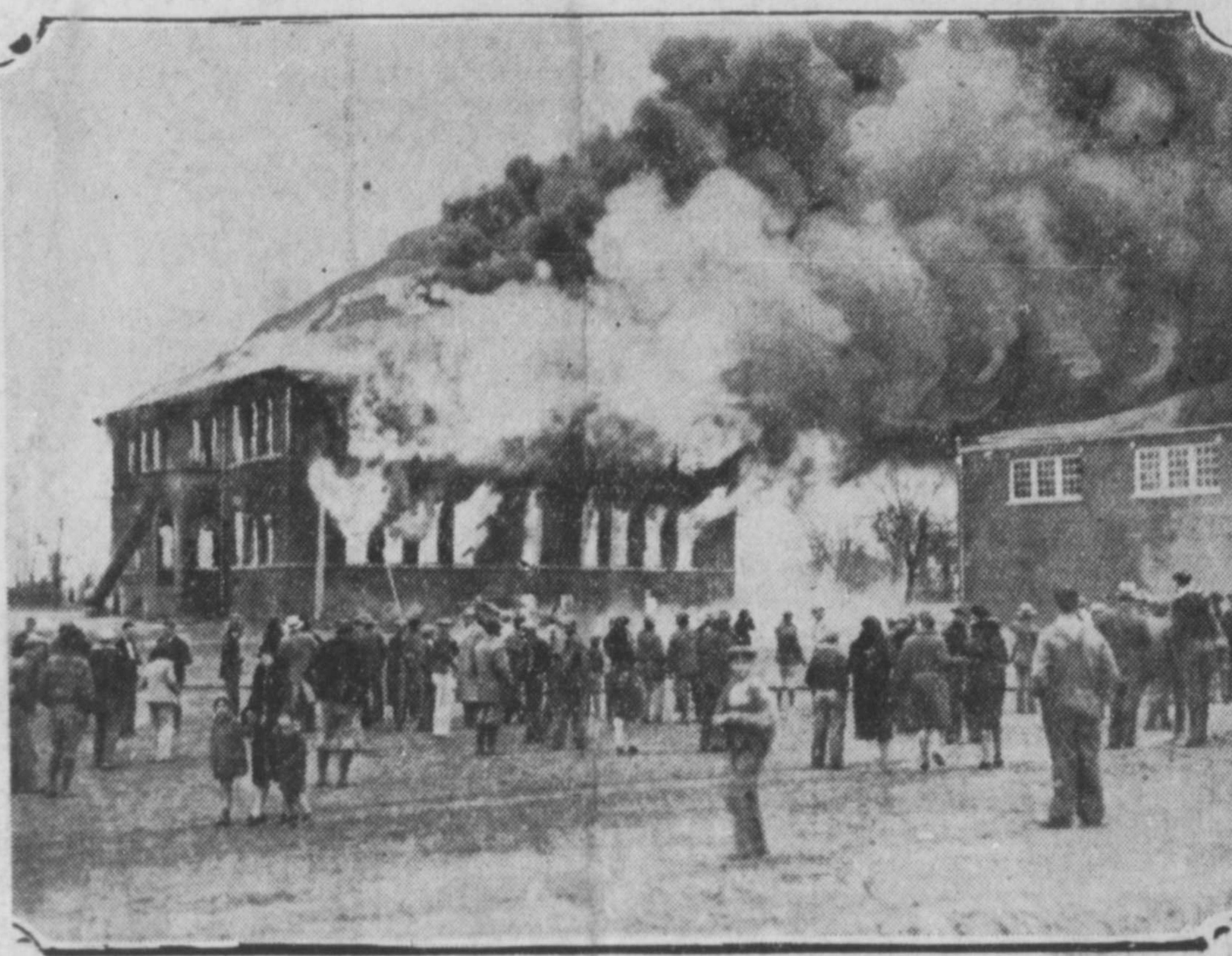
Here is a little red schoolhouse at Harrah, Okla., fulfilling wish made by many in their younger days. Flames completely swept building. The 400 pupils were marched to safety without injury.