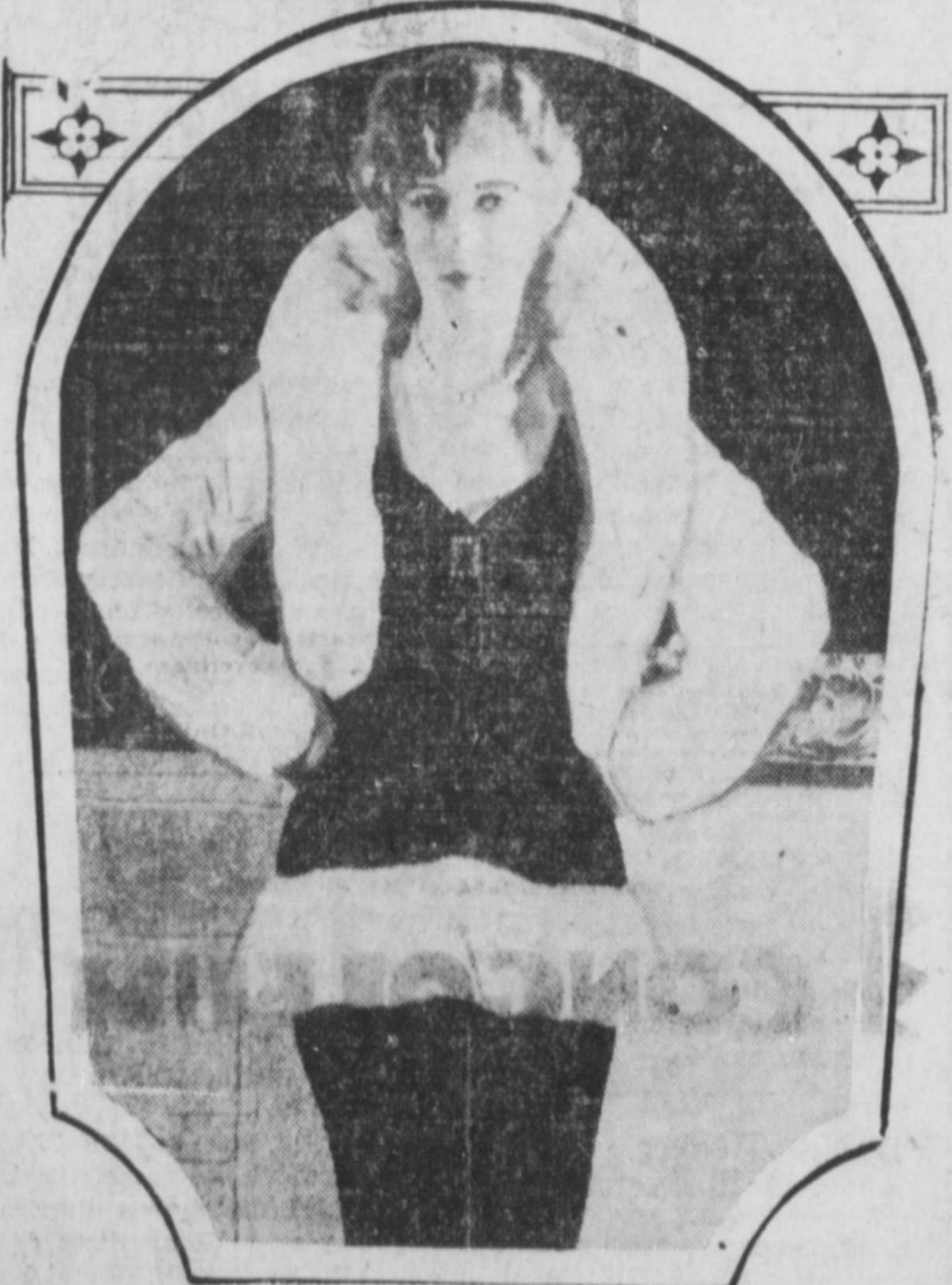
Marion Davies, screen star, wears this evening gown of black chiffon velvet, showing severely straight lines, relieved only by a pepum of white ermine at hipline.

This advertisement is not published or displayed by the Liquor Control Board or by the Government of British Columbia