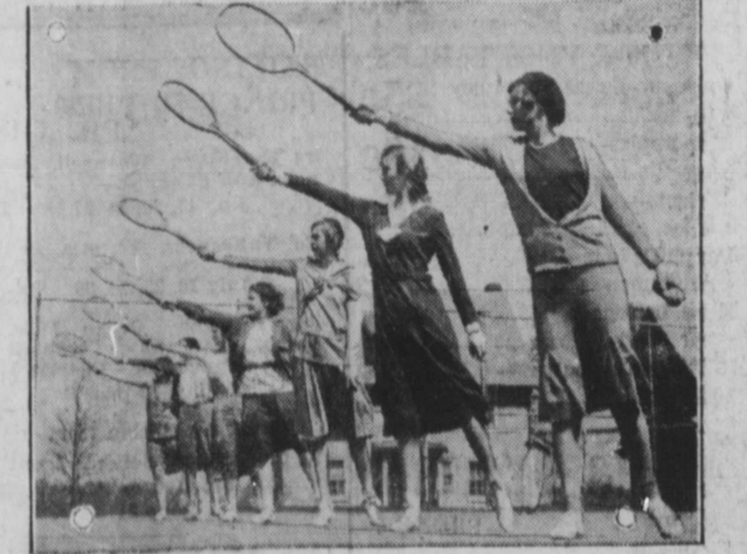
Encouraged by continued dry weather, students at Women's State College, New Brunswick, N.J., are out for sports practise. This group is practising the overhead stroke.

A farmer once asked the editor of a country paper for advice, as follows: "I have a horse that at times appears normal, but at other times is lame to an alarming degree. What shall I do?" The reply came: "The next time your horse appears normal, sell him!"