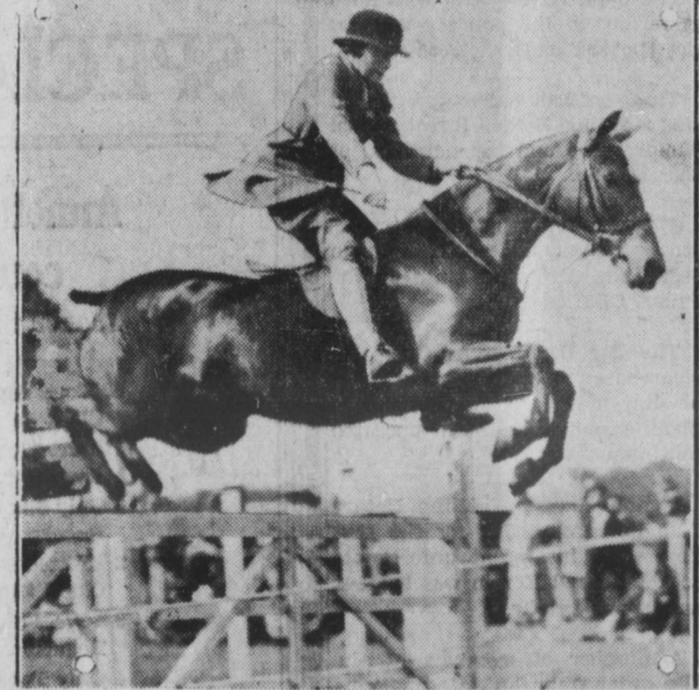
Young competitor in the children's (under fifteen) jumping class at Richmond, England, horse show, recently, taking a high one