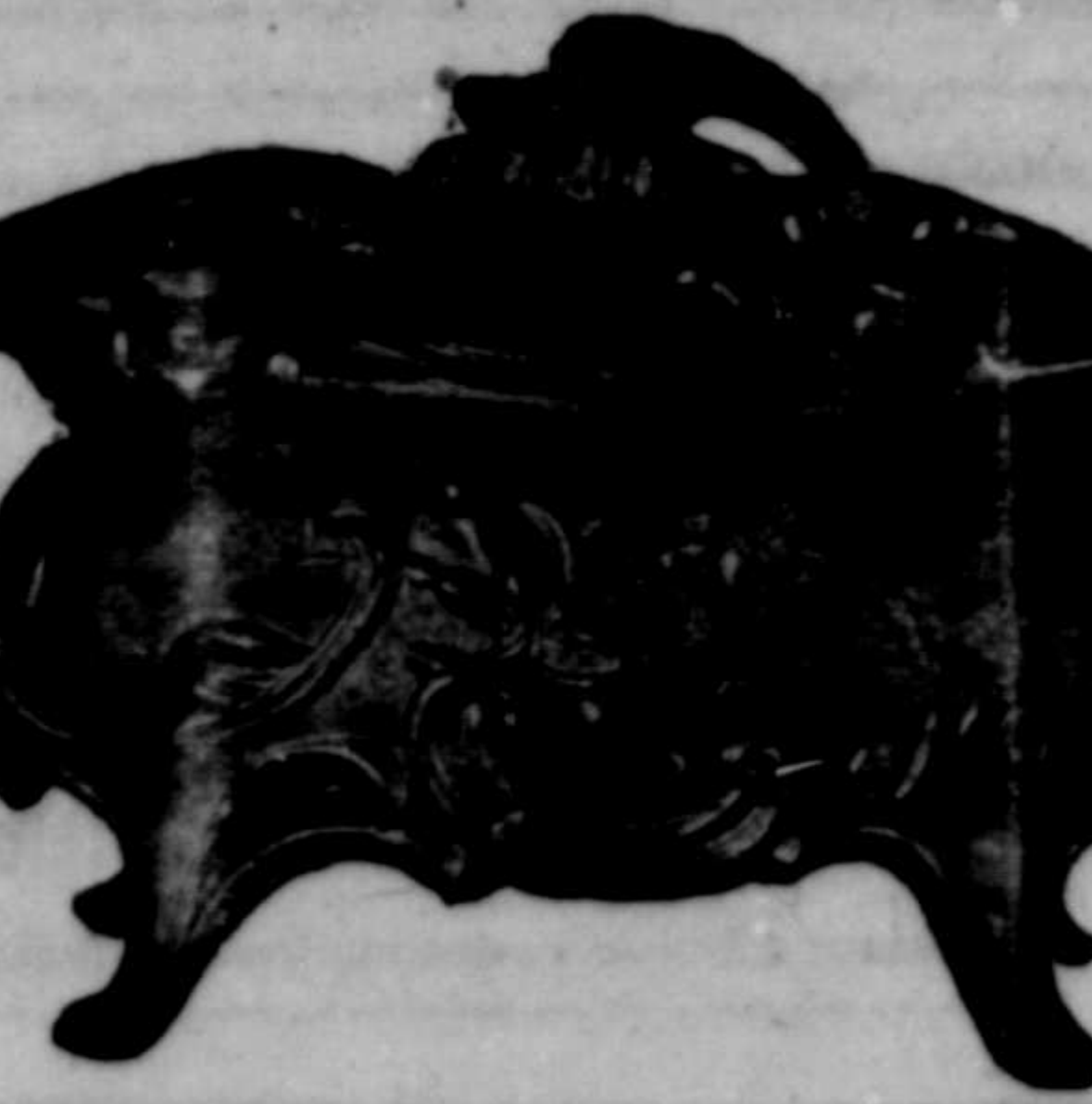
Fancy Jewel Case, Mesh Chain Bags, Ladies' Vanity Purses and Satchels.

Fancy China Royal Dalton, Derby, Ainsley, Wedgewood, and hand painted Japanese.