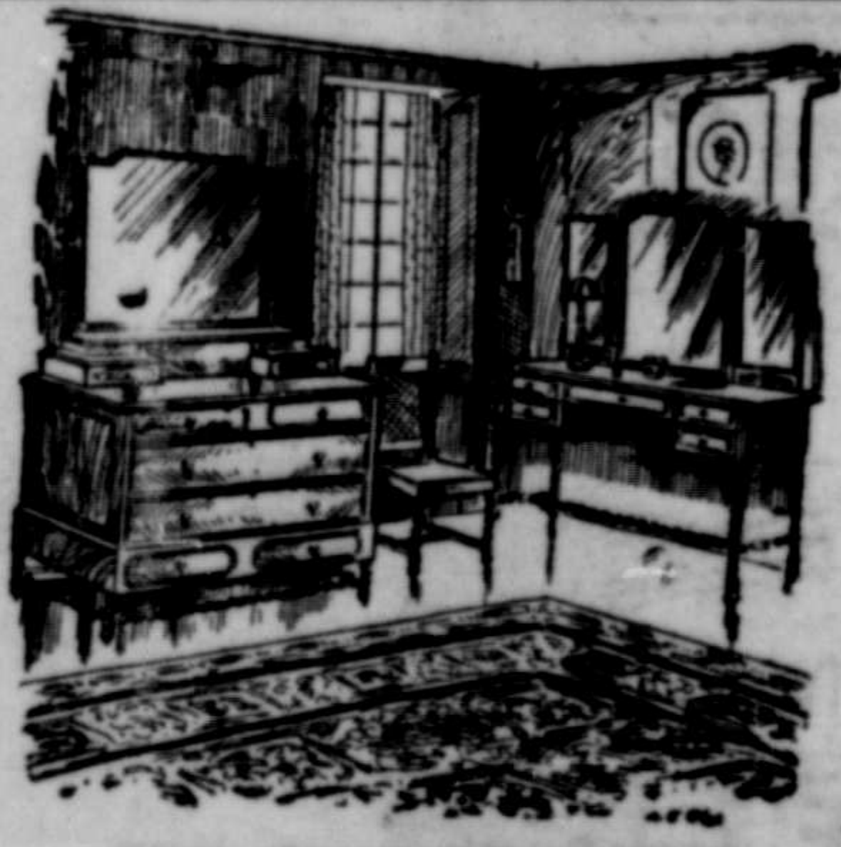
FOR YOUR BEDROOM Furniture in one of the period styles would be particularly pleasing and always in good taste. Call and see our large stock of HIGH-CLASS FURNITURE

THREE BEAUTIFUL DESIGNS—ADAM, PATRICIAN and SHERATON—The Gift de Luxe—Solid or Hollow Handle Knives, Spoons, Forks, Berry and Salad Spoons, Sugar Tongs, Butter Knives, Baby Spoons, Meat and Fish Forks. Also Leather and Mahogany Cases filled to suit your price. Axminster Carpet Square Tapestry or Brussels. Special Discount Price for Xmas.