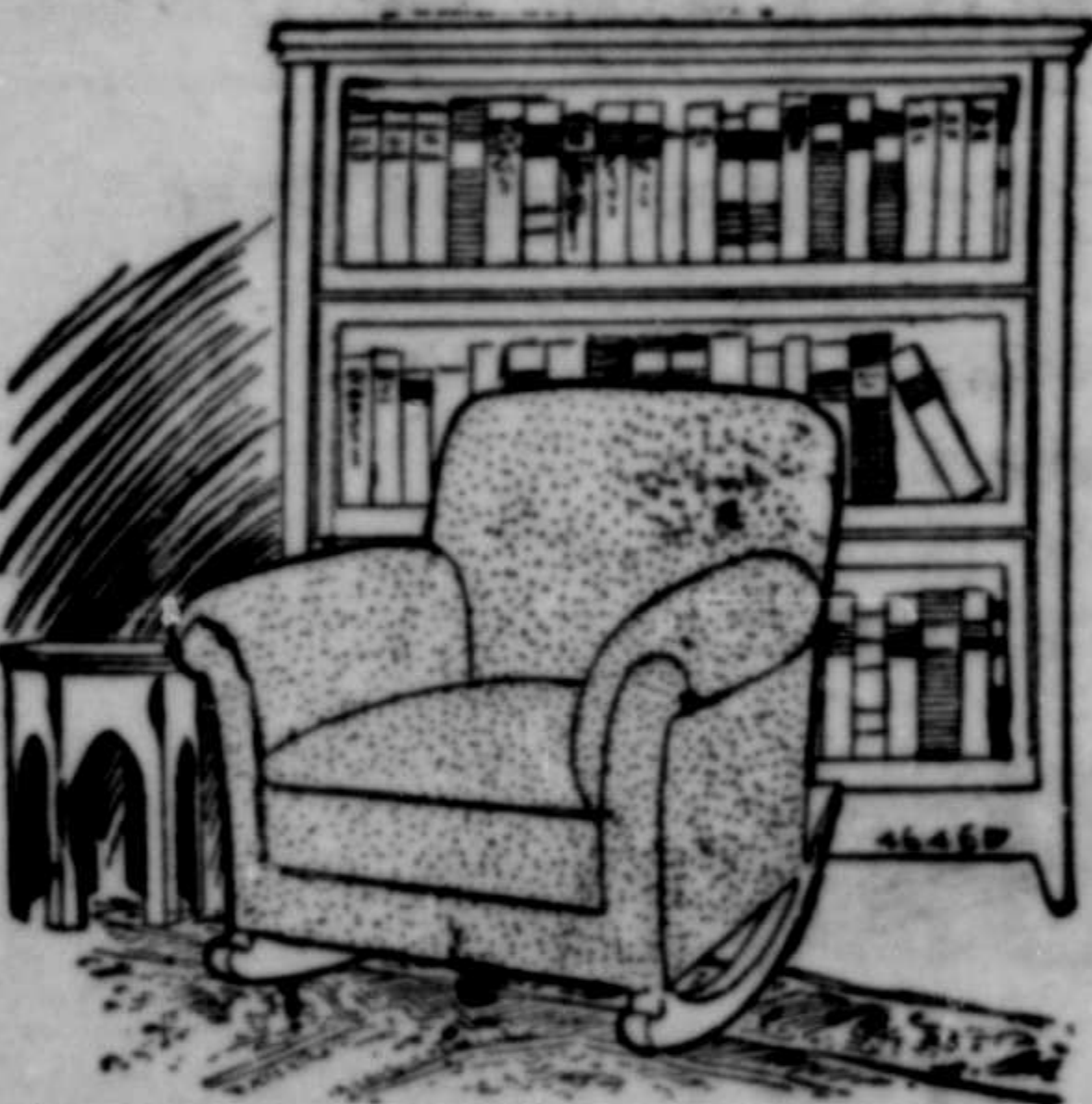
YOUR FAVORITE CORNER— Is it furnished as you would like it? Have you a convenient case for your books, a chair that gives you rest and comfort and everything else in the line of the RIGHT FURNITURE?

SPECIAL DISCOUNTS FOR 'XMAS ON ALL FURNITURE