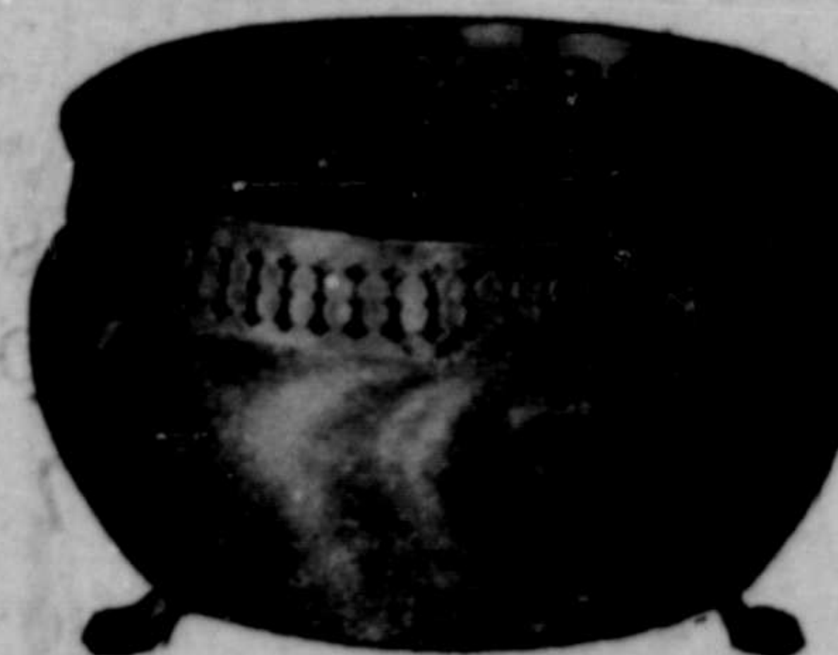
Fern Bowls, Brass Jardineres, Smoker Stands, Fancy Baskets, Ladies' Handkerchiefs and note paper in fancy boxes.

Cut Glass Berry Bowls, Nappies, Bon Bon, Water Sets, Creams, and Sugars, At Special discount prices for Xmas.