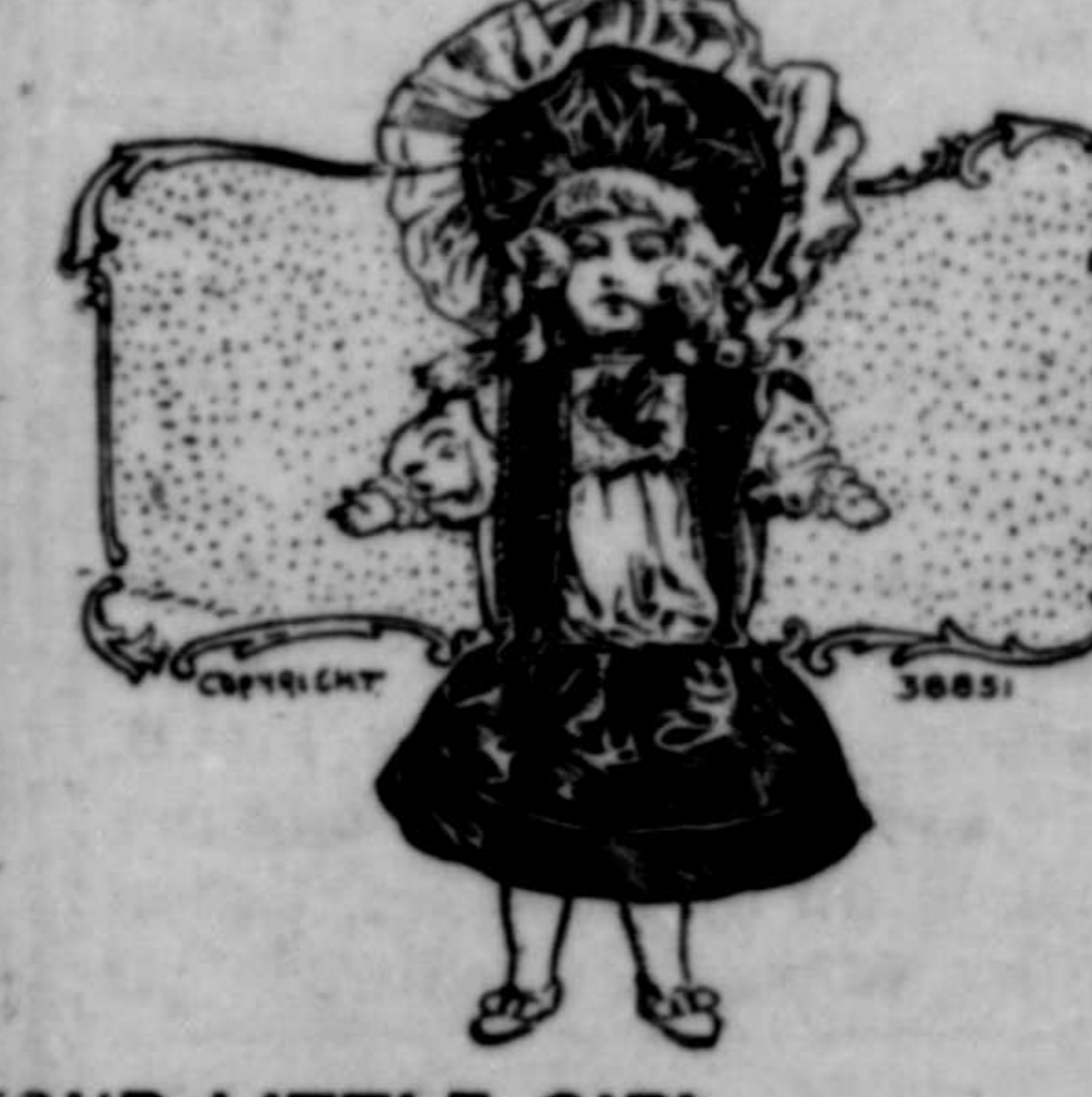
YOUR LITTLE GIRL— the one you delight in pleasing—whether or not she belongs to you, will just love a dolly that you give her. So bring her here and let her choose. THE DOLL SHE WANTS

Trains, Books, Dolls, Animals, Games, Balls, Tanks, Pistols, Wagons, Sleighs, in fact, see everything in Toyland at our store.