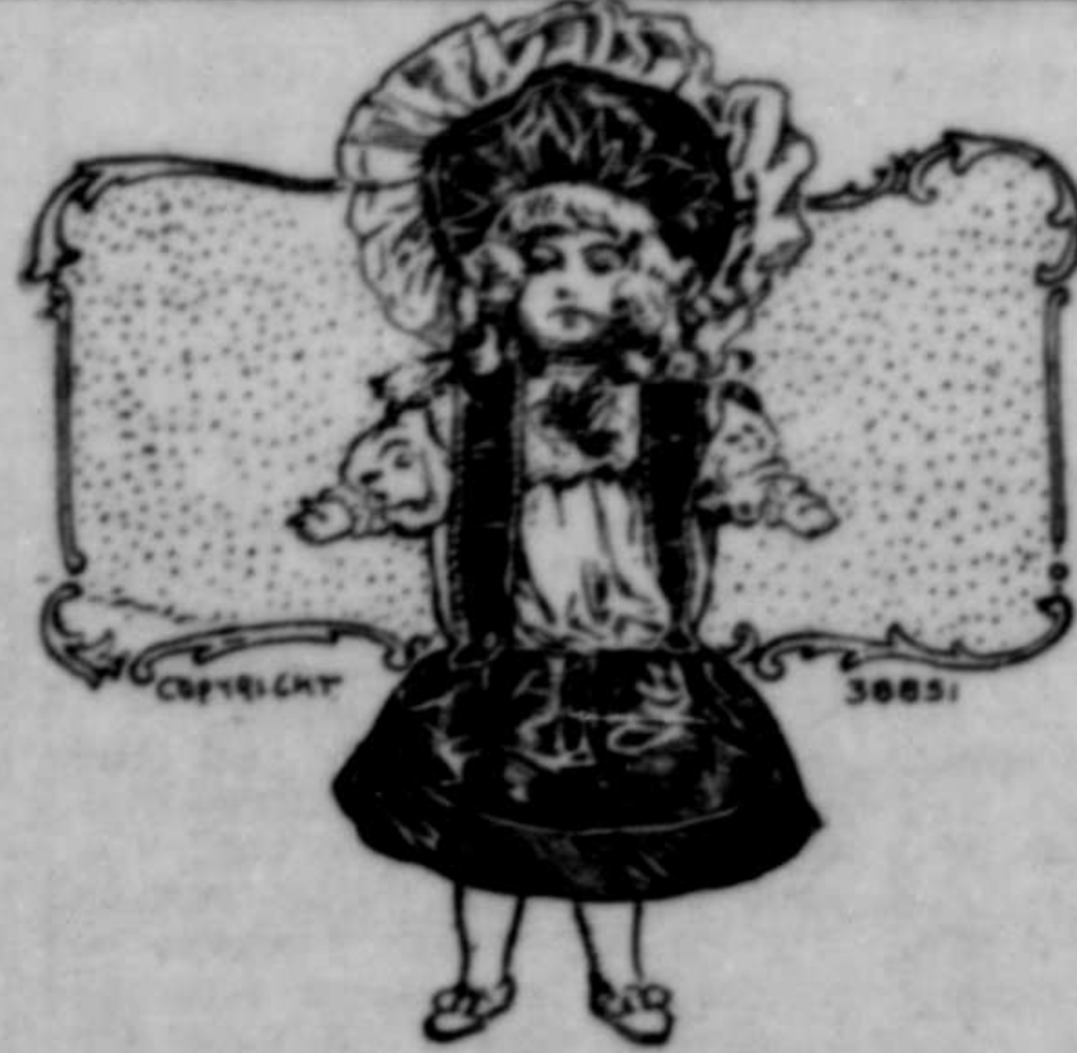
YOUR LITTLE GIRL

Trains, Books, Dolls, Animals, Games, Balls, Tanks, Pistols, Wagons, Sleighs, in fact, see everything in Toyland at our store.