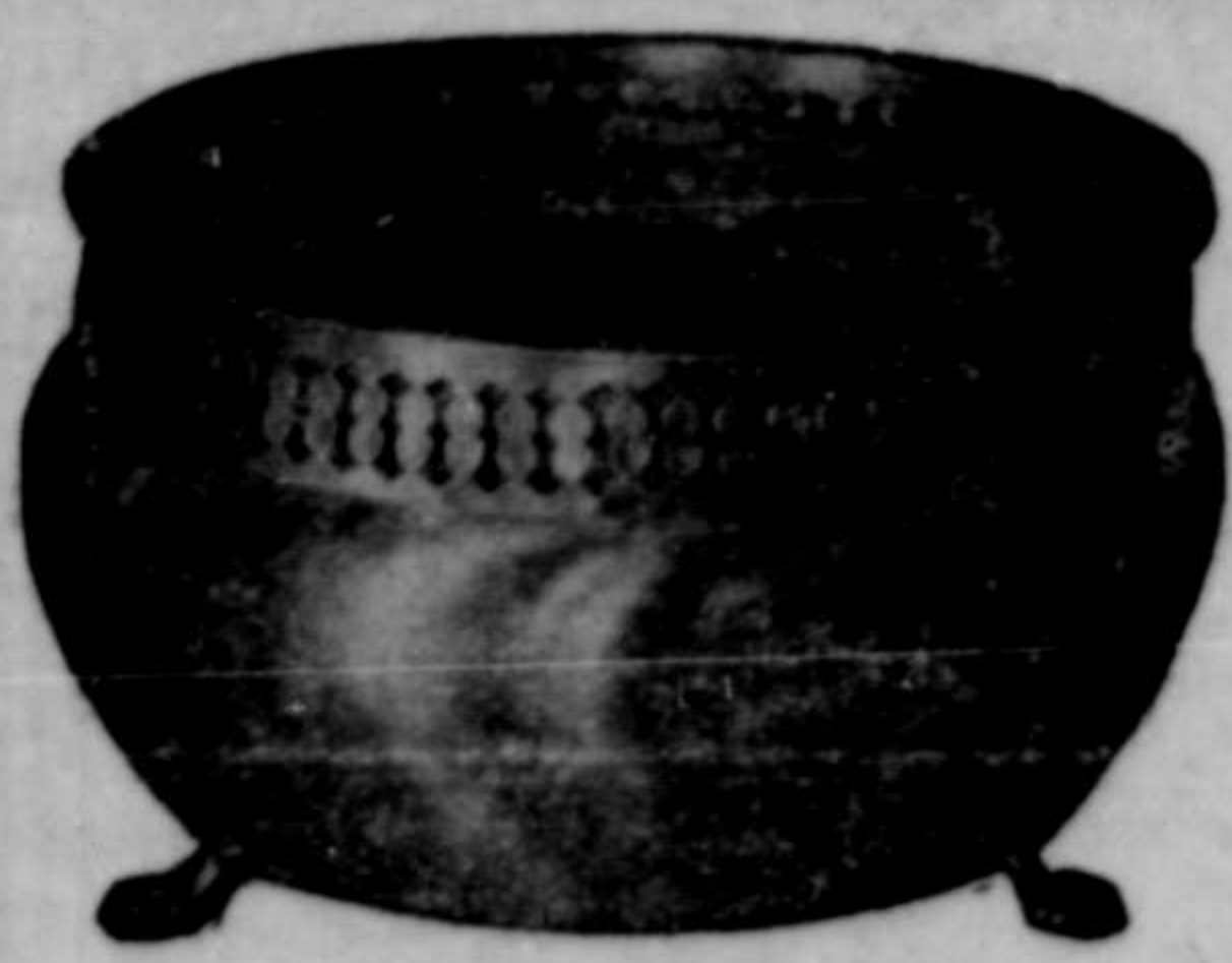
Fern Bowls, Brass Jardinieres, Smoker Stands, Fancy Baskets, Ladies' Handkerchiefs and note paper in fancy boxes.

Berry Bowls, Nappies Bon Bon, Water Sets, Creams and Sugars. At Special discount prices for Xmas.