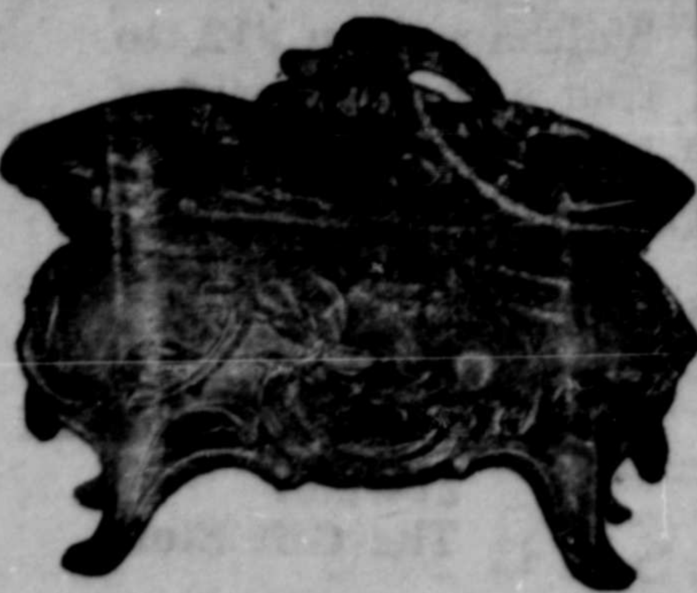
Fancy Jewel Case, Mesh Chain Bags, Ladies' Vanity Purses and Satchels.