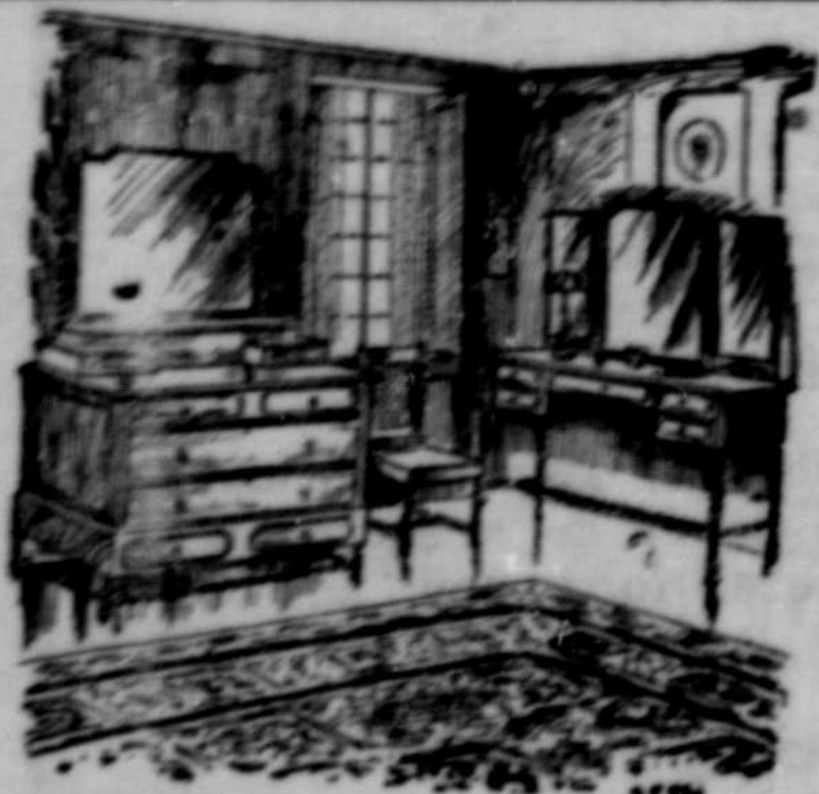
FOR YOUR BEDROOM

THREE BEAUTIFUL DESIGNS—ADAM, PATRICIAN and SHERATON—The Gift de Luxe—Solid or Hollow Handle Knives, Spoons, Forks, Berry and Salad Spoons, Sugar Tongs, Butter Knives, Baby Spoons, Meat and Fish Forks. Also Leather and Mahogany Cases filled to suit your price. Axminster Carpet Square Tapestry or Brussels. Special Discount Price for Xmas.