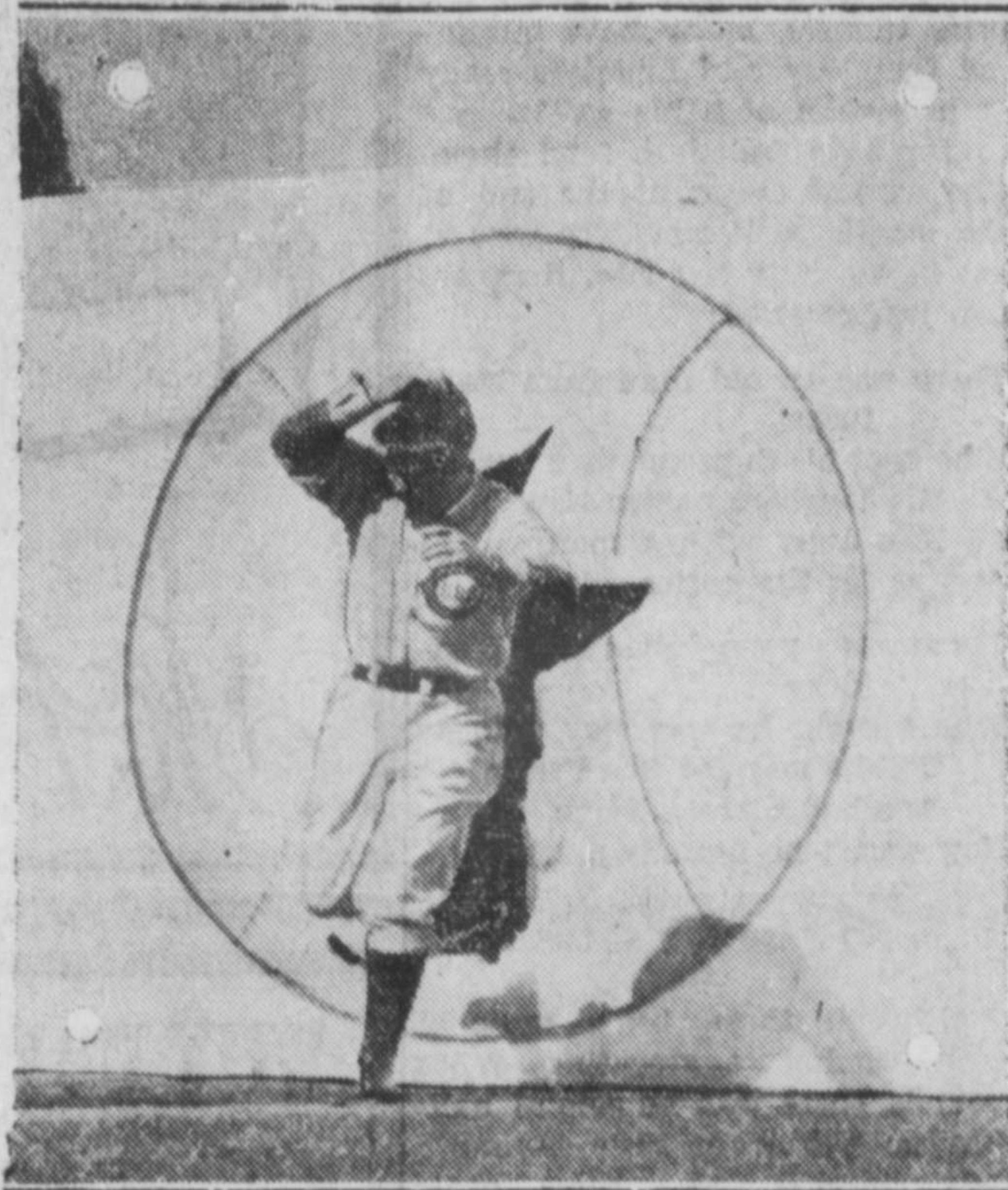
Rogers Hornsby got his Chicago Cubs out in front in the National League race yesterday, when he defeated the world's champions, St. Louis Cardinals.