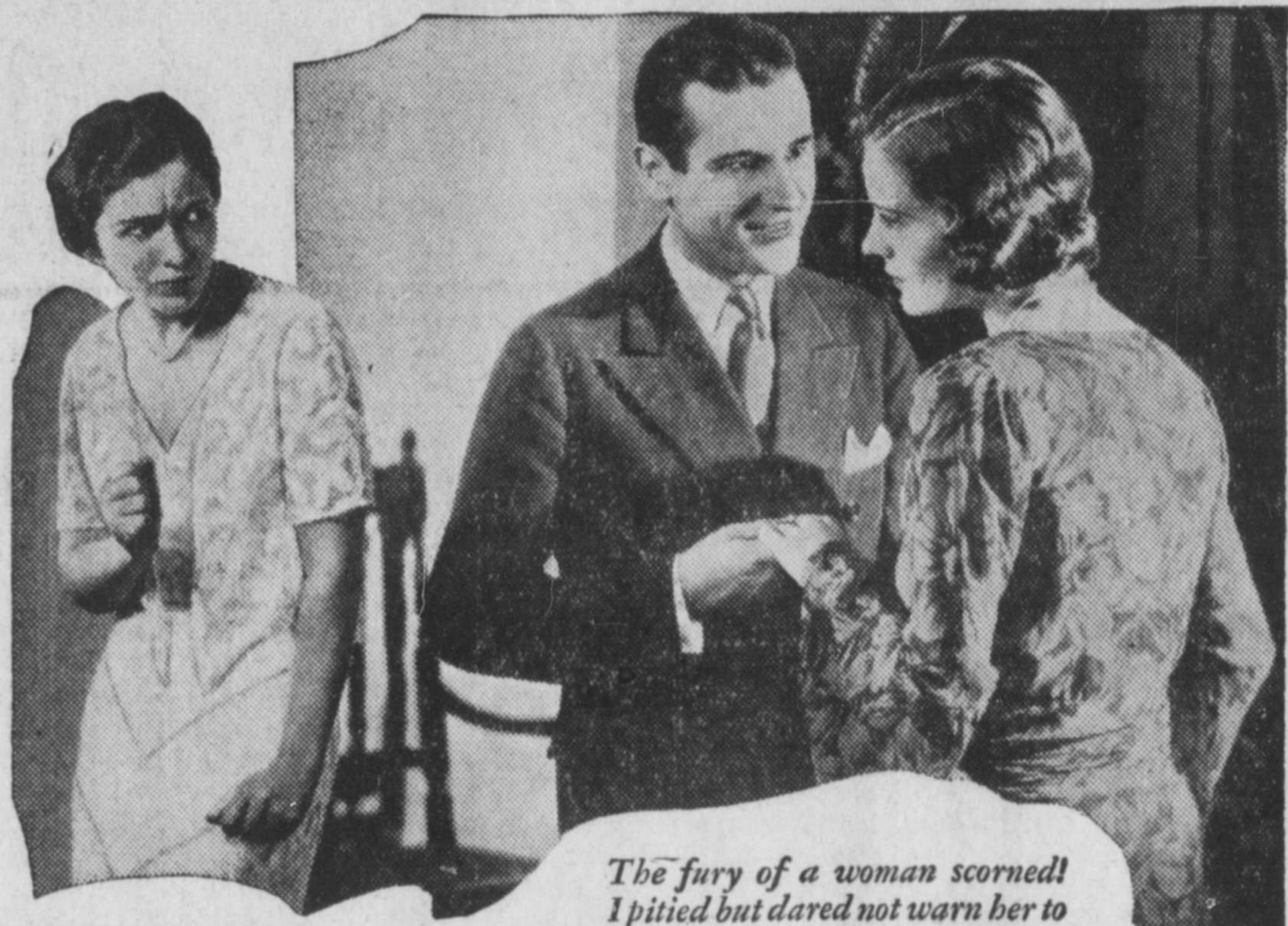
The fury of a woman scorned! I pitied but dared not warn her to be more careful about "B.O."