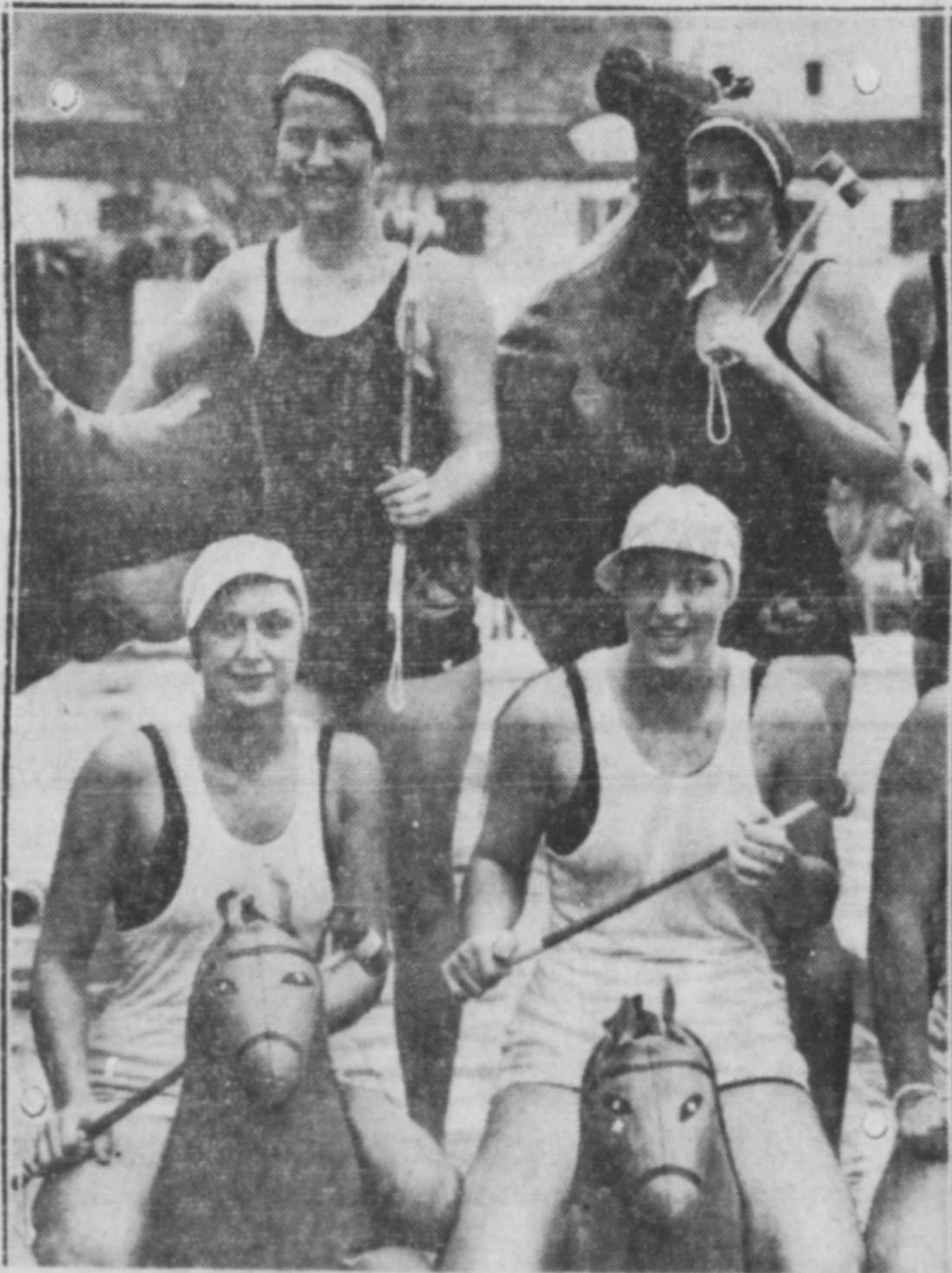
Two of the "ponies" blew up when struck by mallets during the polo game which followed this snap. All members of the team are swimmers of Los Angeles enjoying a bit of fun at Palm Springs