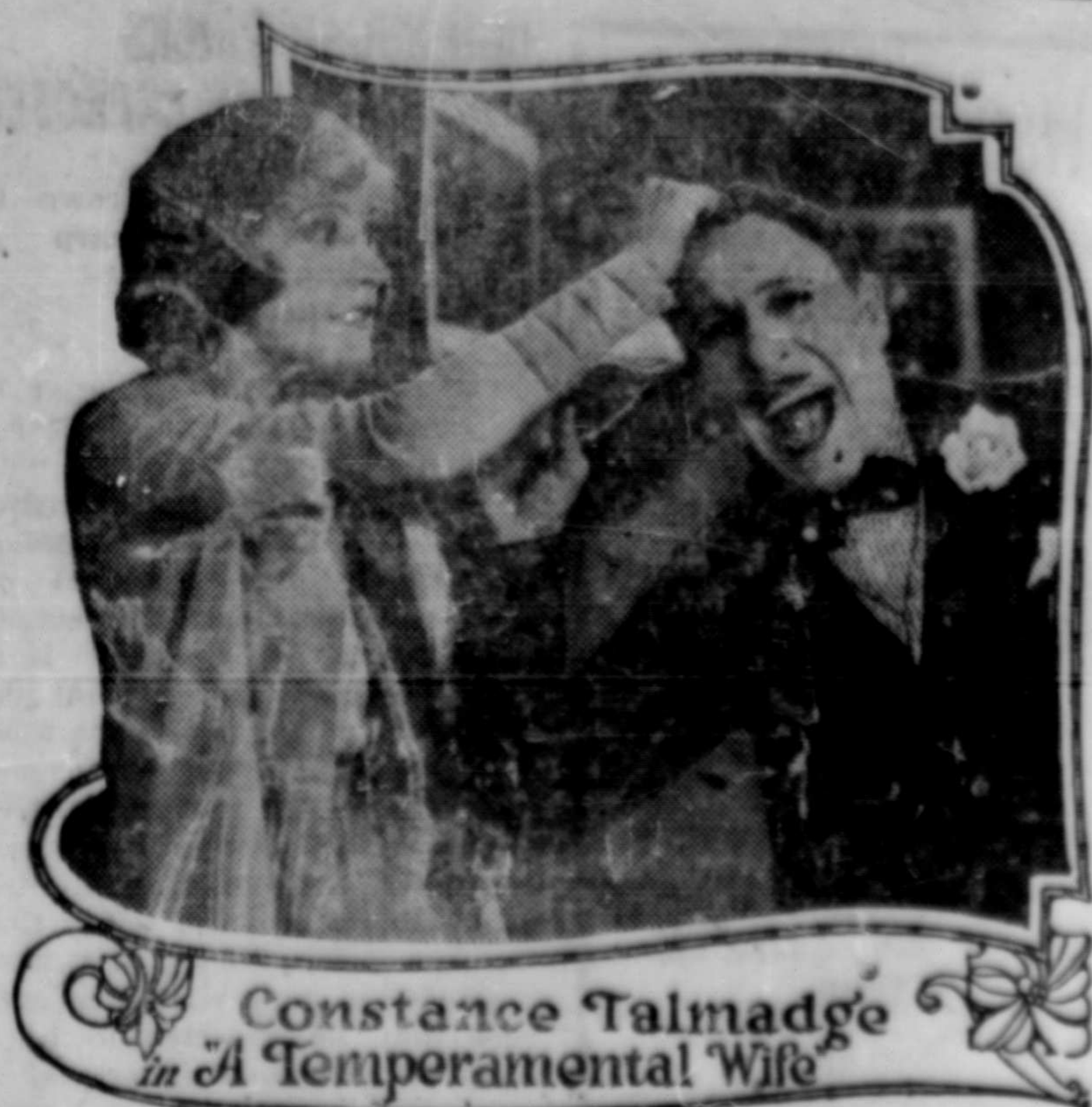
Constance Talmadge in "A Temperamental Wife" Starring tonight at the Westholme Theatre.

The British Government has financed Canadian operations on the other side, while the Canadian Government has established imperial credits here. The only credit now operating is for the purchase of timber, though arrangements regarding the wheat crop are to be made. As the balance now stands, Great Britain owes Canada $200,000,000, interest on which is being paid at 5 1/2 per cent.