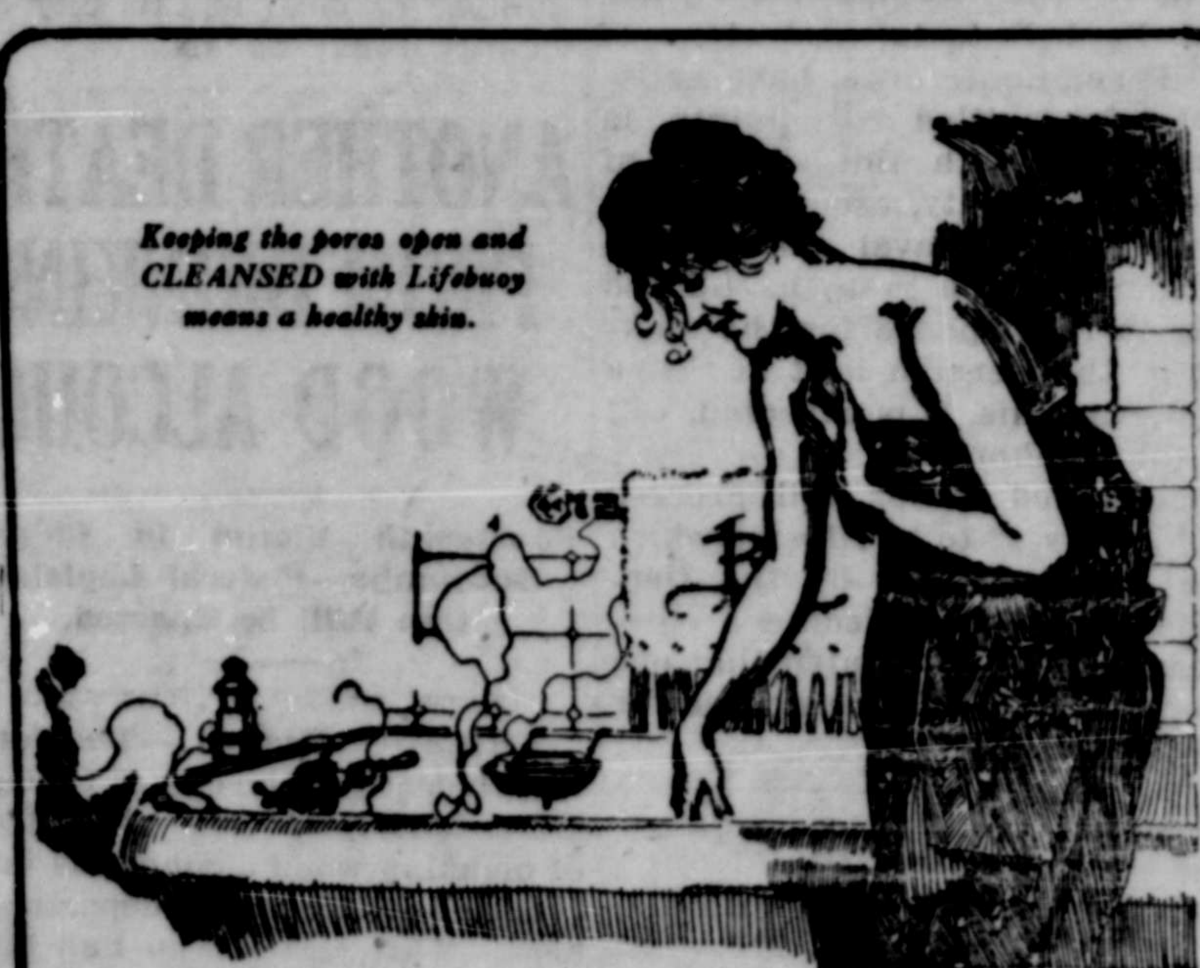
Keeping the pores open and CLEANSED with Lifebuoy means a healthy skin.

In this community we have people who are of almost a hundred different religions, of several different political faiths, men and women of many nationalities, educated and uneducated, cultured and uncultured, tall and short, dark and fair, industrious and lazy. No two people are alike. And yet all these may coordinate and form a harmonious whole, working together for the common good. Much depends upon our desires and on the spirit of toleration that is displayed.