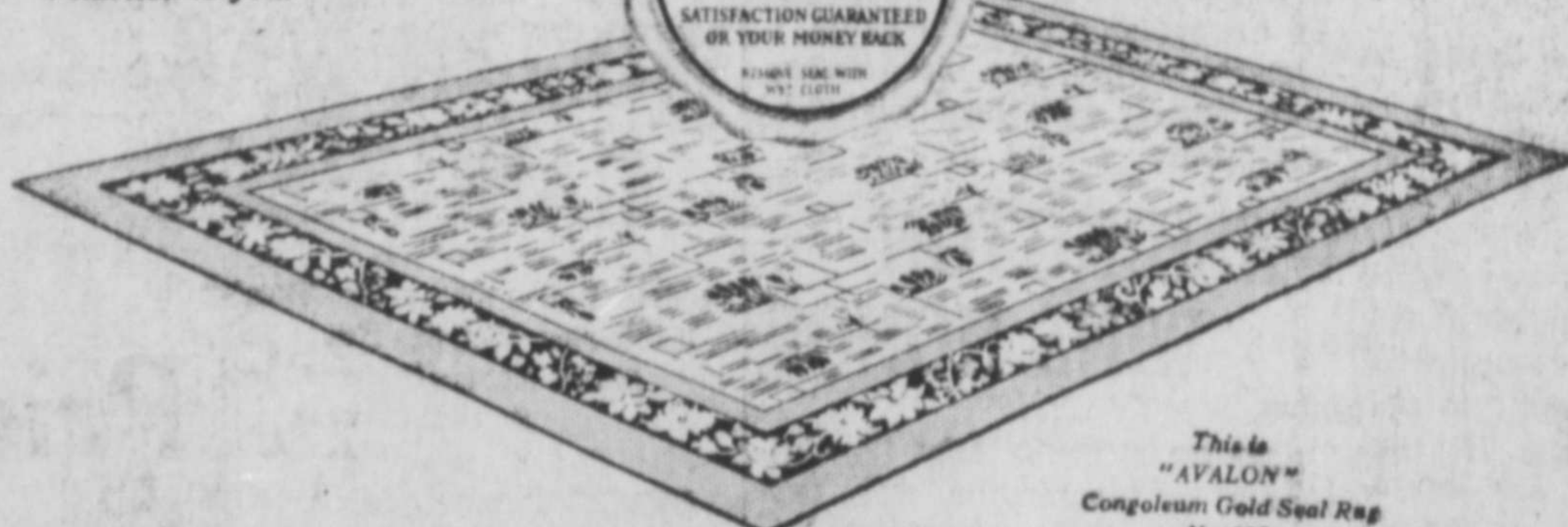
This is "AVALON" Congoleum Gold Seal Rug No. 628