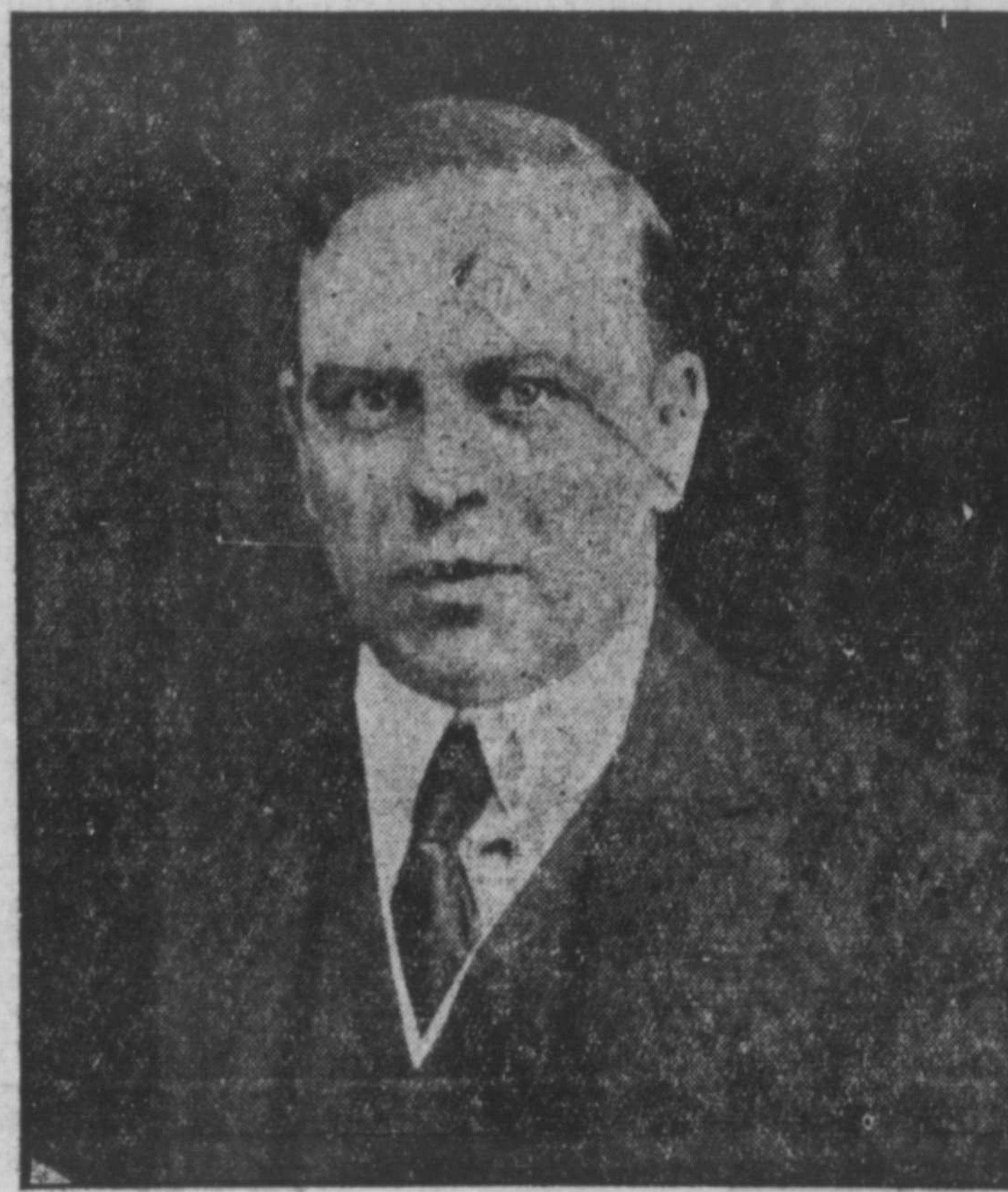
Hon. W. L. Mackenzie King demands action on unemployment relief but not in way of blank check.