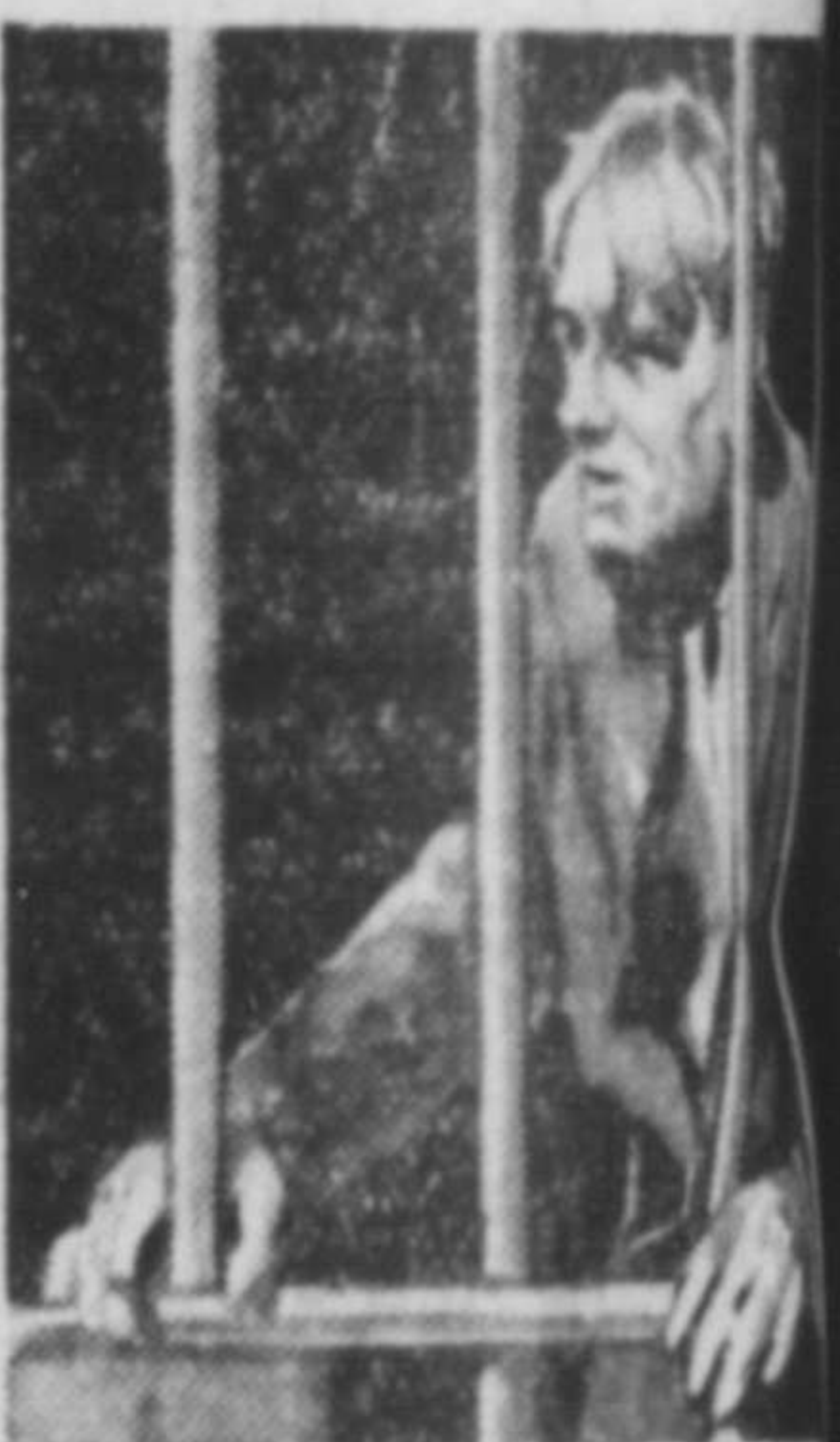
A thumb print sent him here out, beneath the culprit's ban. He put him behind the bars. He made a mistake of leaving a record with a finger print impressed.