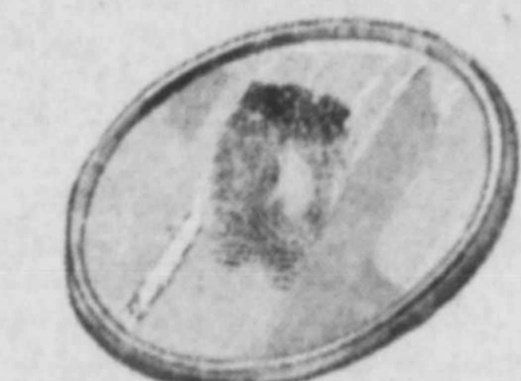
Pocket mirror with tell-tale thumb print