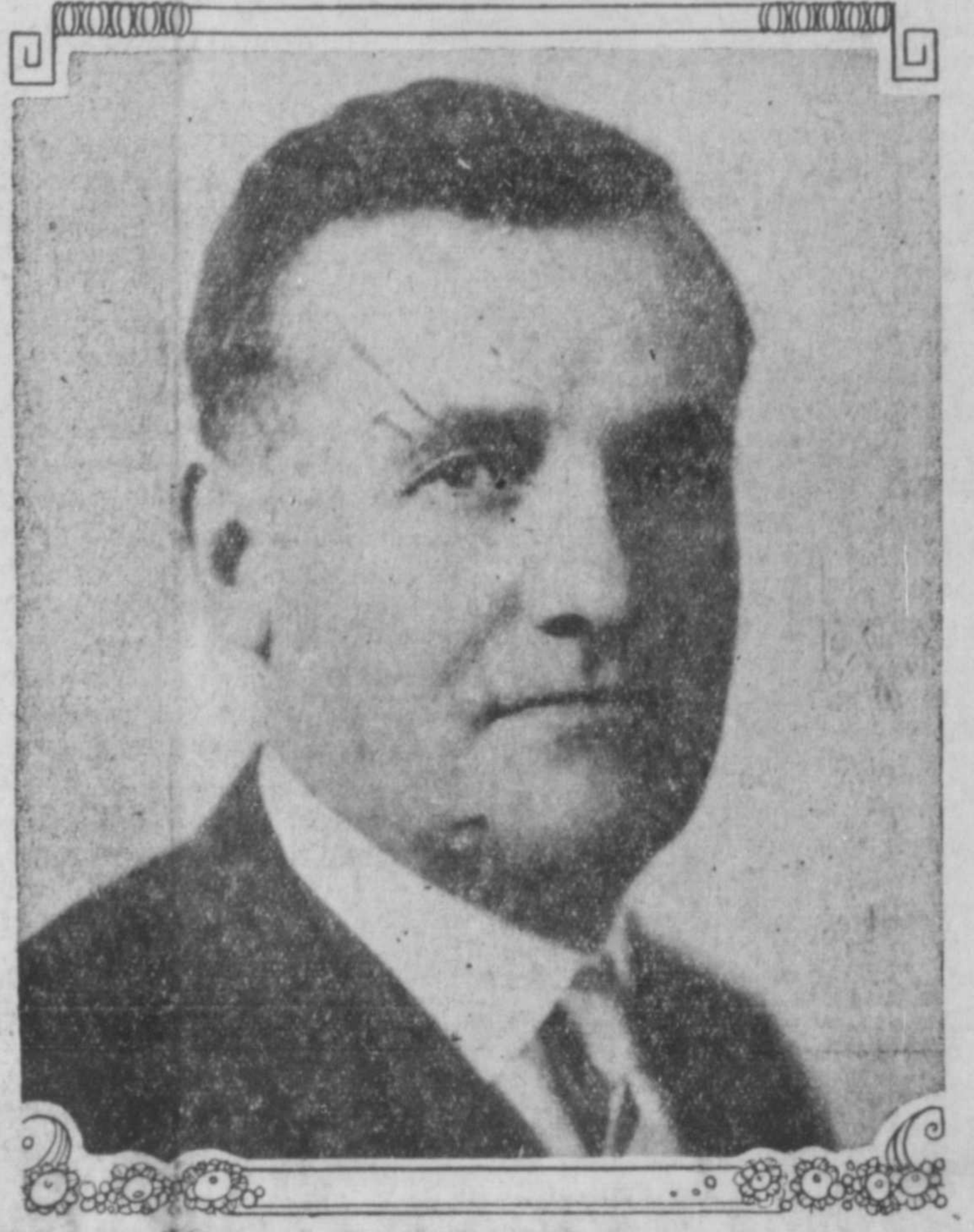
Asks government what is being done in regard to fish duty negotiations.