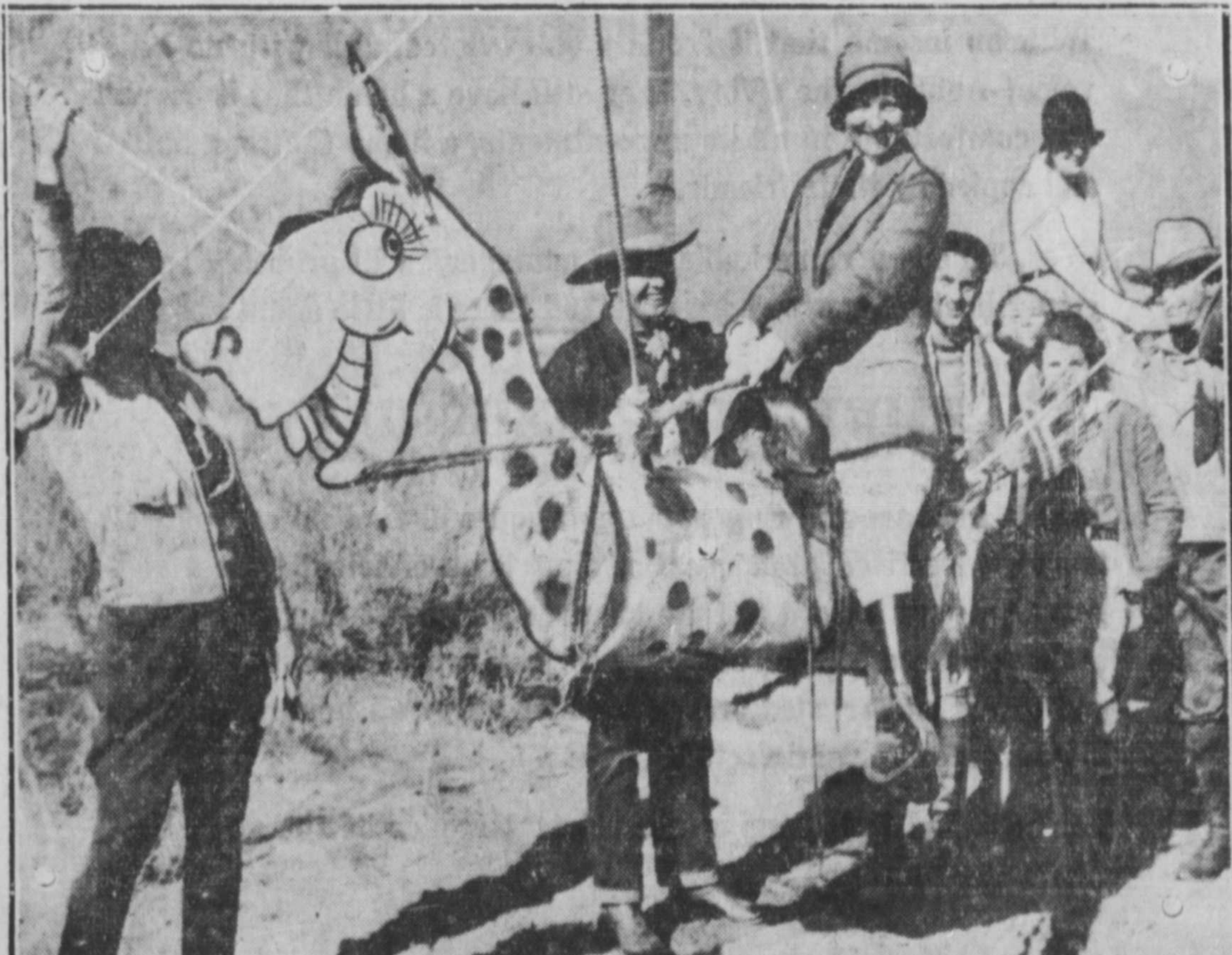
The idea is to stick on the painted pony's back while husky cowpunchers make it buck and rear. Just another thrill for Palm Springs visitors provided by an energetic publicity man.