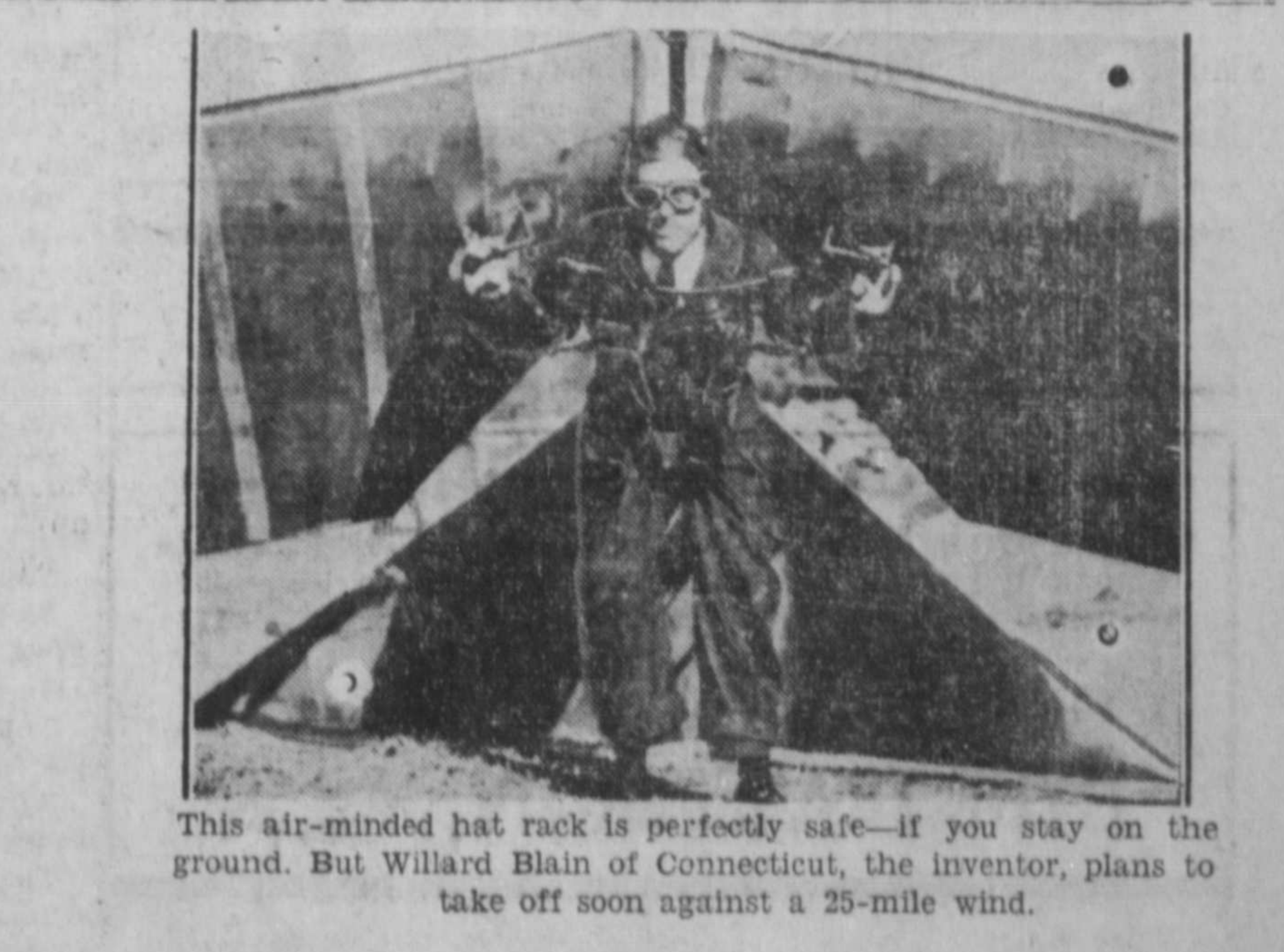
This air-minded hat rack is perfectly safe—if you stay on the ground. But Willard Blain of Connecticut, the inventor, plans to take off soon against a 25-mile wind.