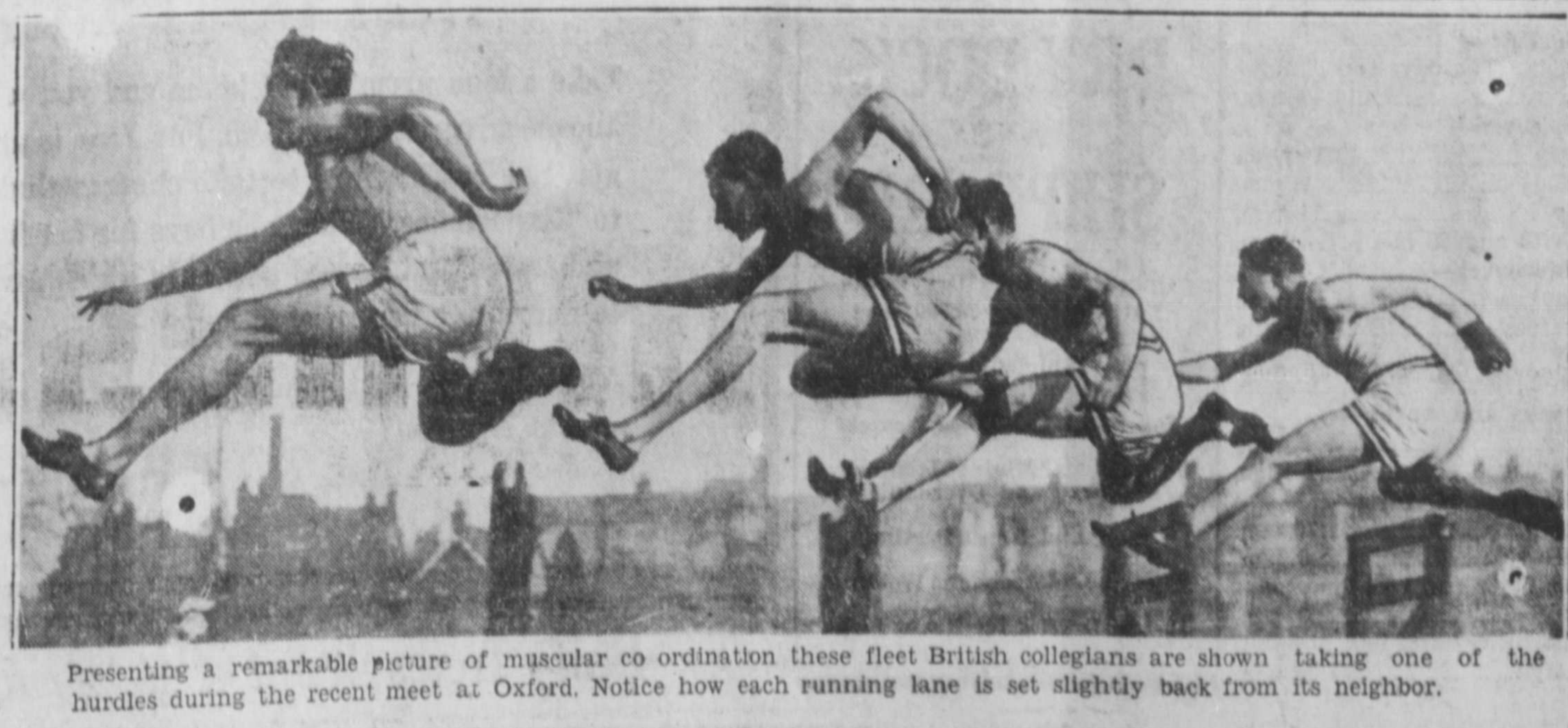
Presenting a remarkable picture of muscular co ordination these fleet British collegians are shown taking one of the hurdles during the recent meet at Oxford. Notice how each running lane is set slightly back from its neighbor.