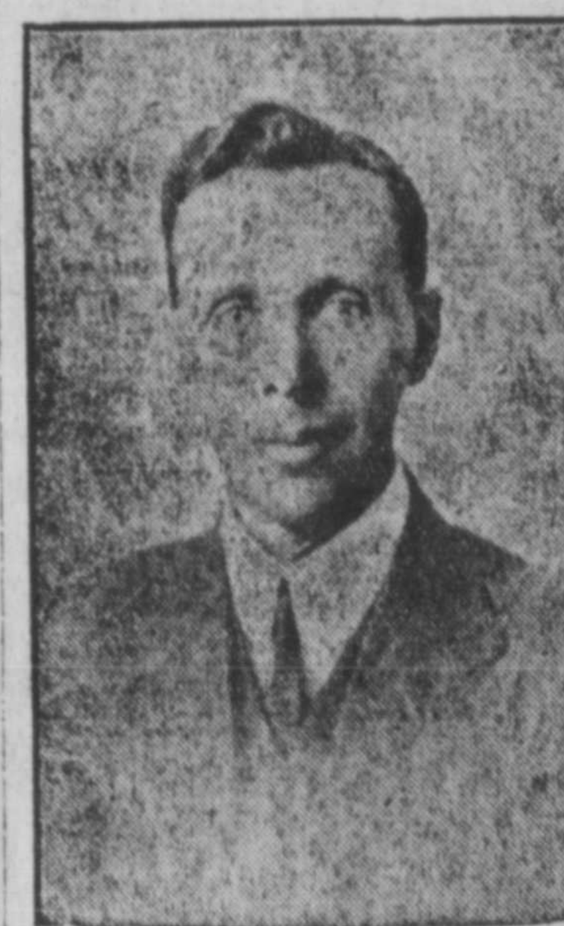
Minister of Finance who presented budget to Legislature today.