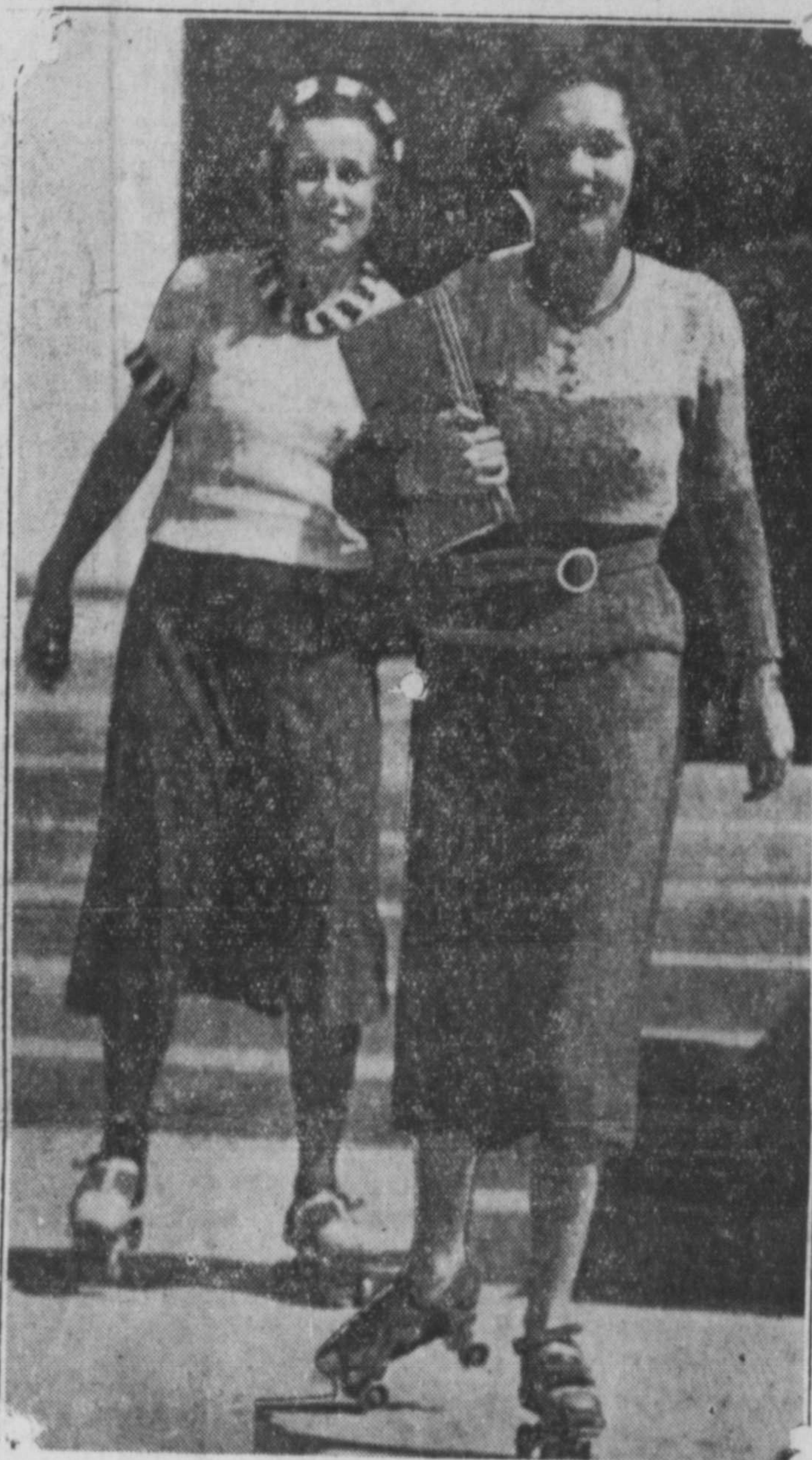
Couple of pretty nice skates, eh? They've got the co-eds on roller bearings out in Tucson, Arizona, now. It saves gas and, anyway, what did you expect them to do—walk home?