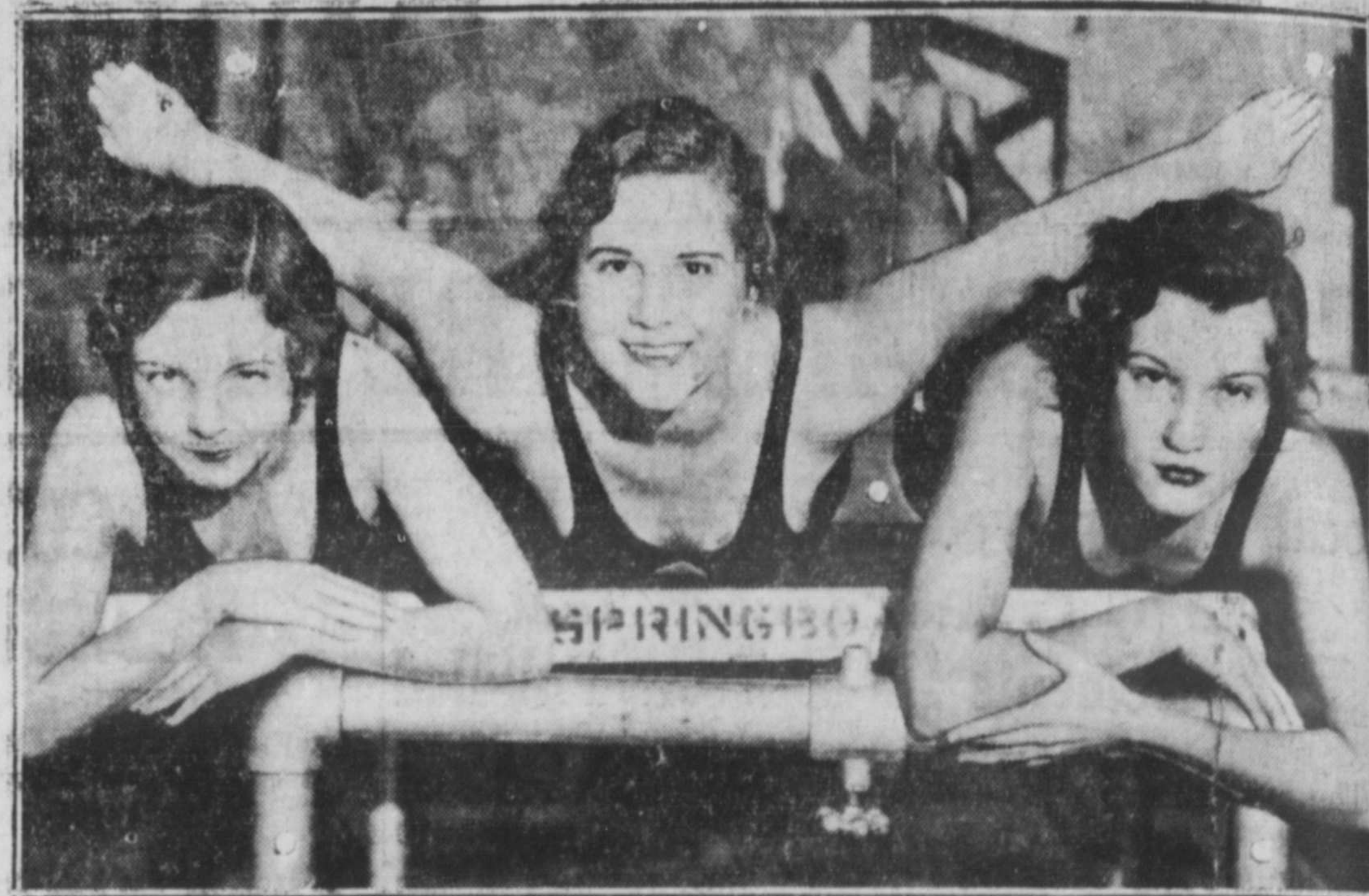
And can they do a swan dive? Oa, boy! This stellar trio from Chicago will display many graceful curves and fancy twirls to the Olympic judges this summer.