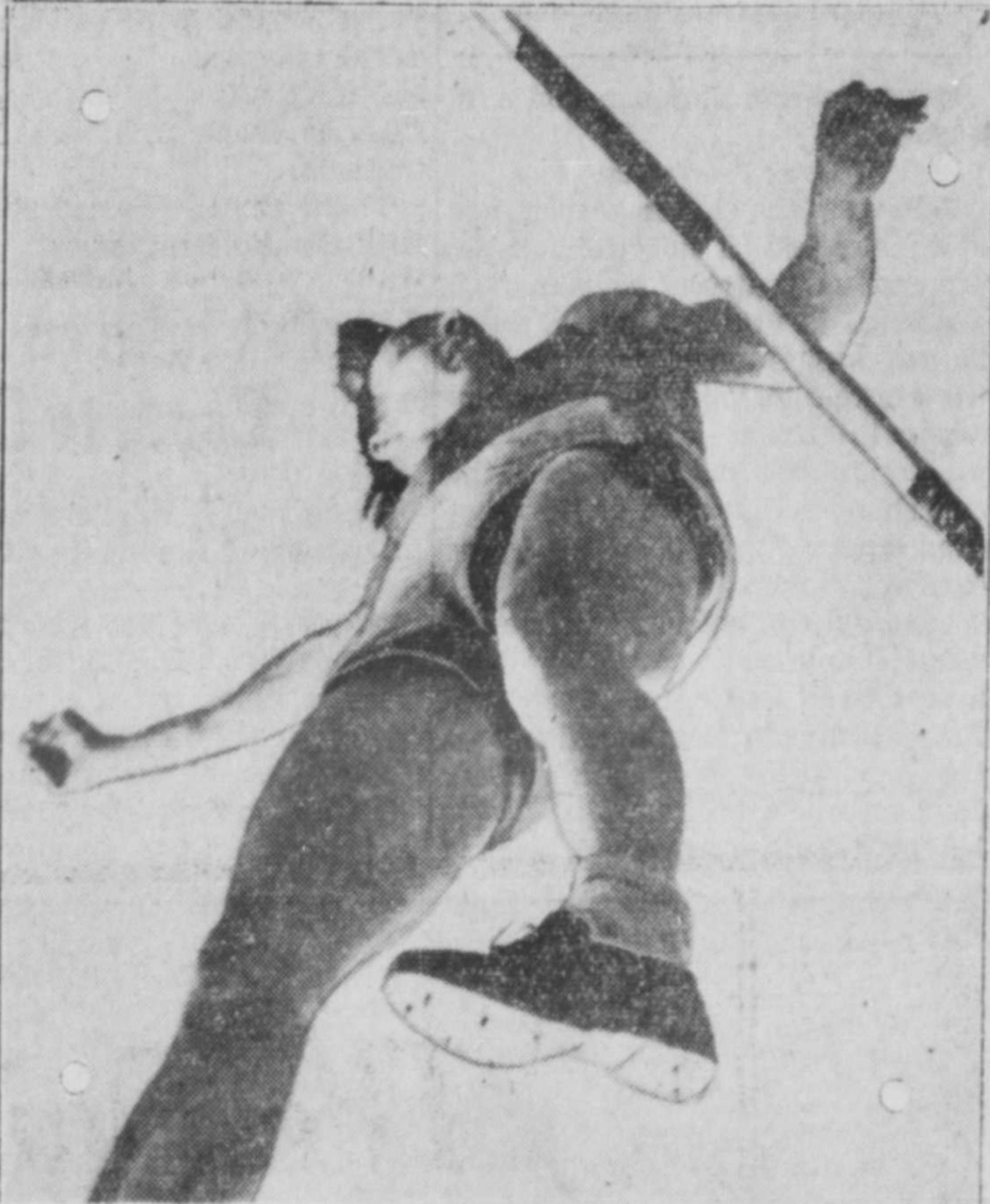
A startling bit of action is shown in this view from down under as Bryant Dunn of the University of Washington cleared the bar at six feet during an intercollegiate meet, recently.