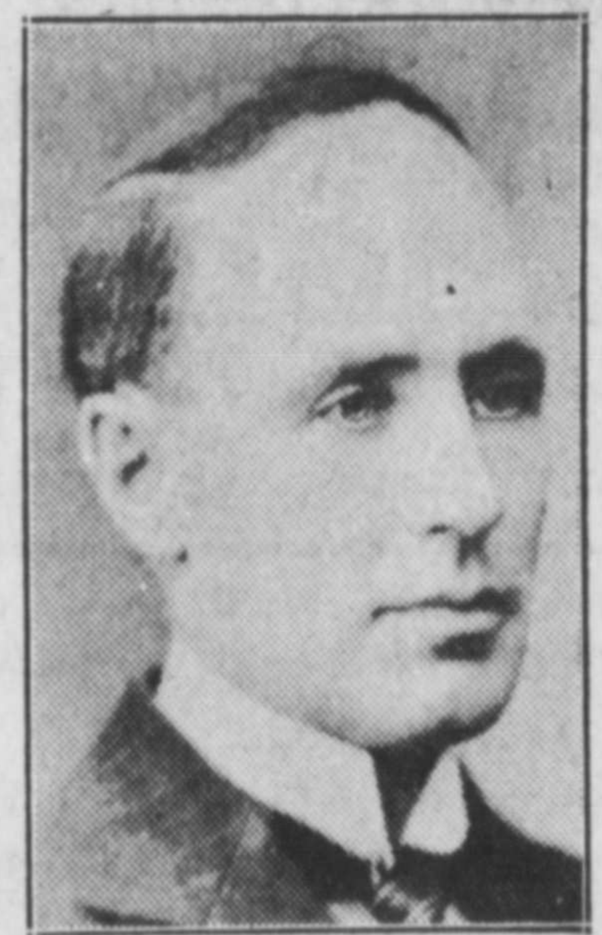
Rt. Hon. Arthur Meighen, also made cabinet minister without portfolio.