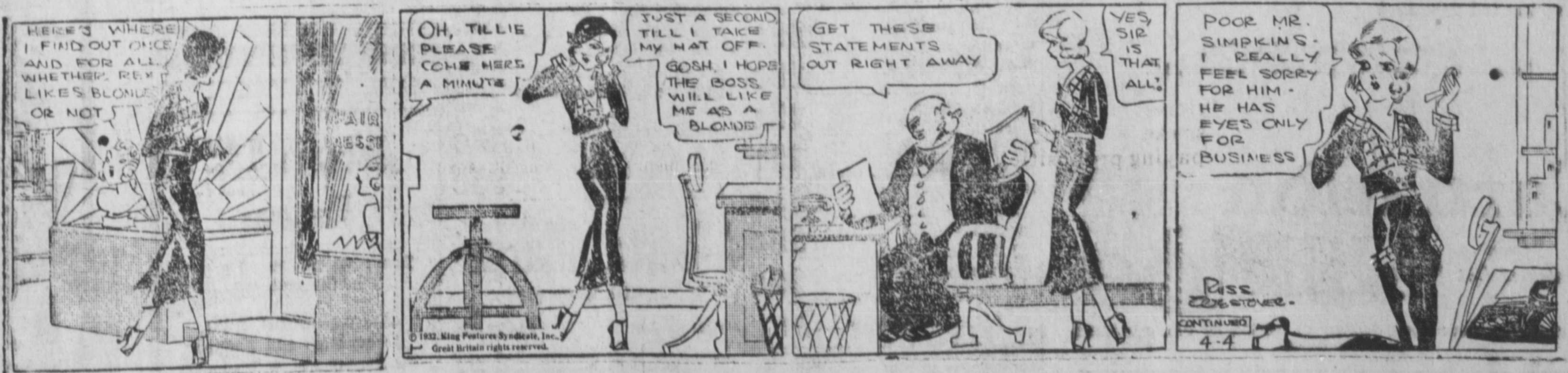
© 1932, King Features Syndicate, Inc. All rights reserved. Great Britain rights reserved.