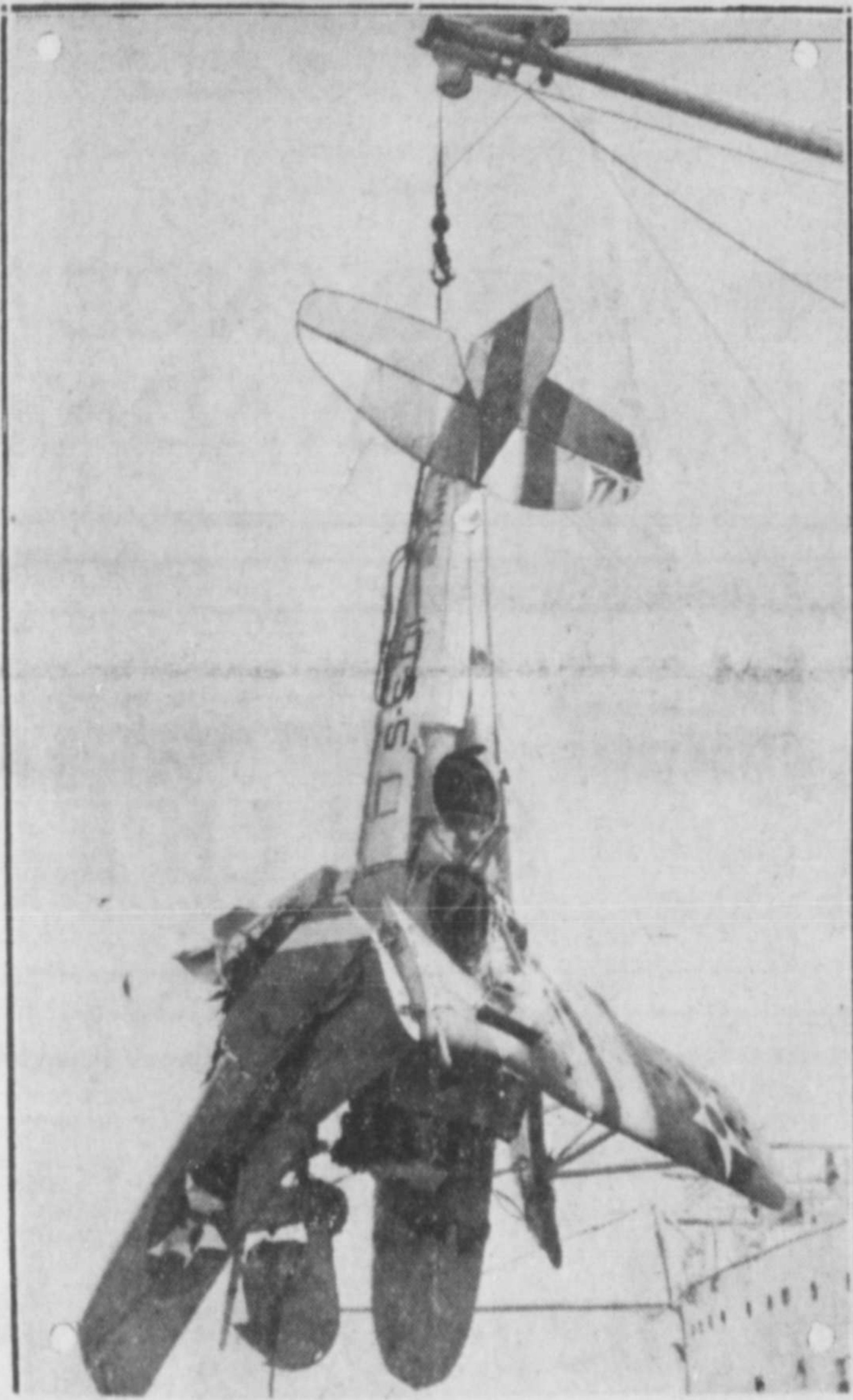
Crew of U.S. cruiser Louisville hoisting damaged plane aboard after two planes collided in the air. One was a total wreck, the other was only slightly damaged. None of the pilots was injured.

SIGNIFICANT FINDING OF SIR ALEXANDER GIBB, BRITISH ENGINEER, ANNOUNCED TODAY WITH TABLING OF ROYAL COMMISSION RETURN