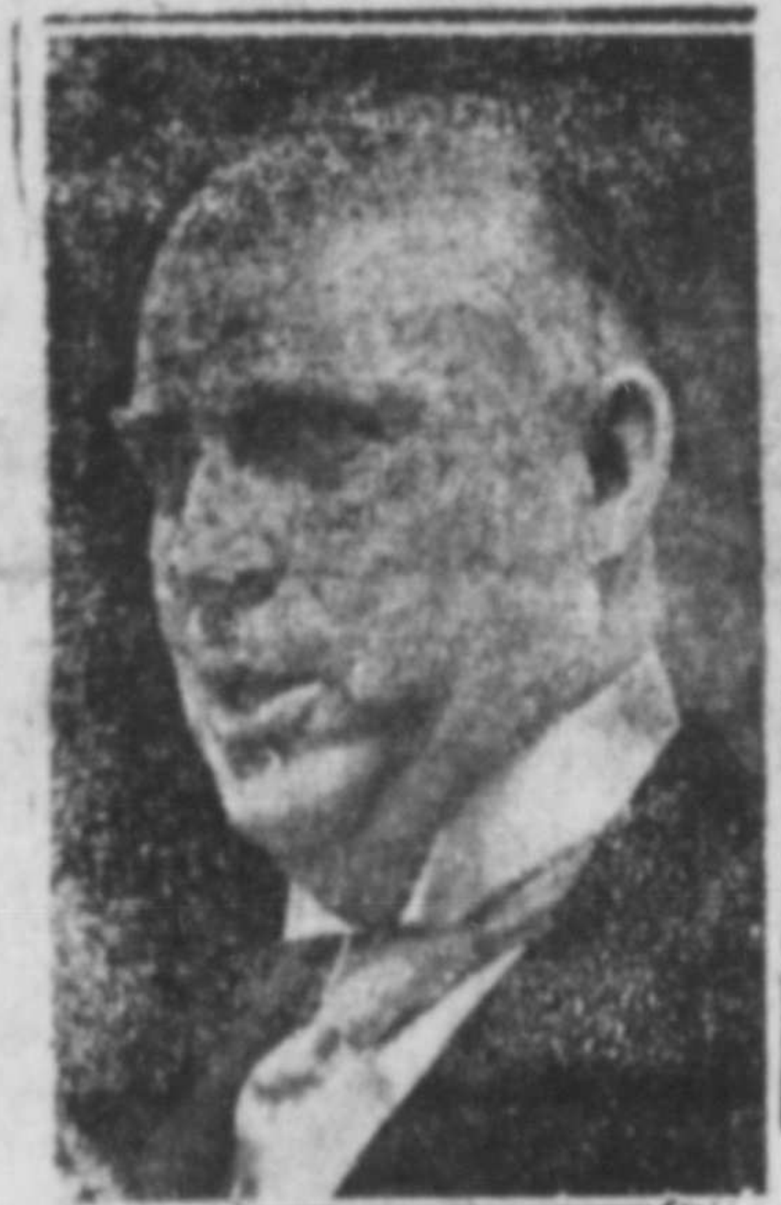
Hon. R. B. Bennett makes important announcement in regard to Canadian railways.