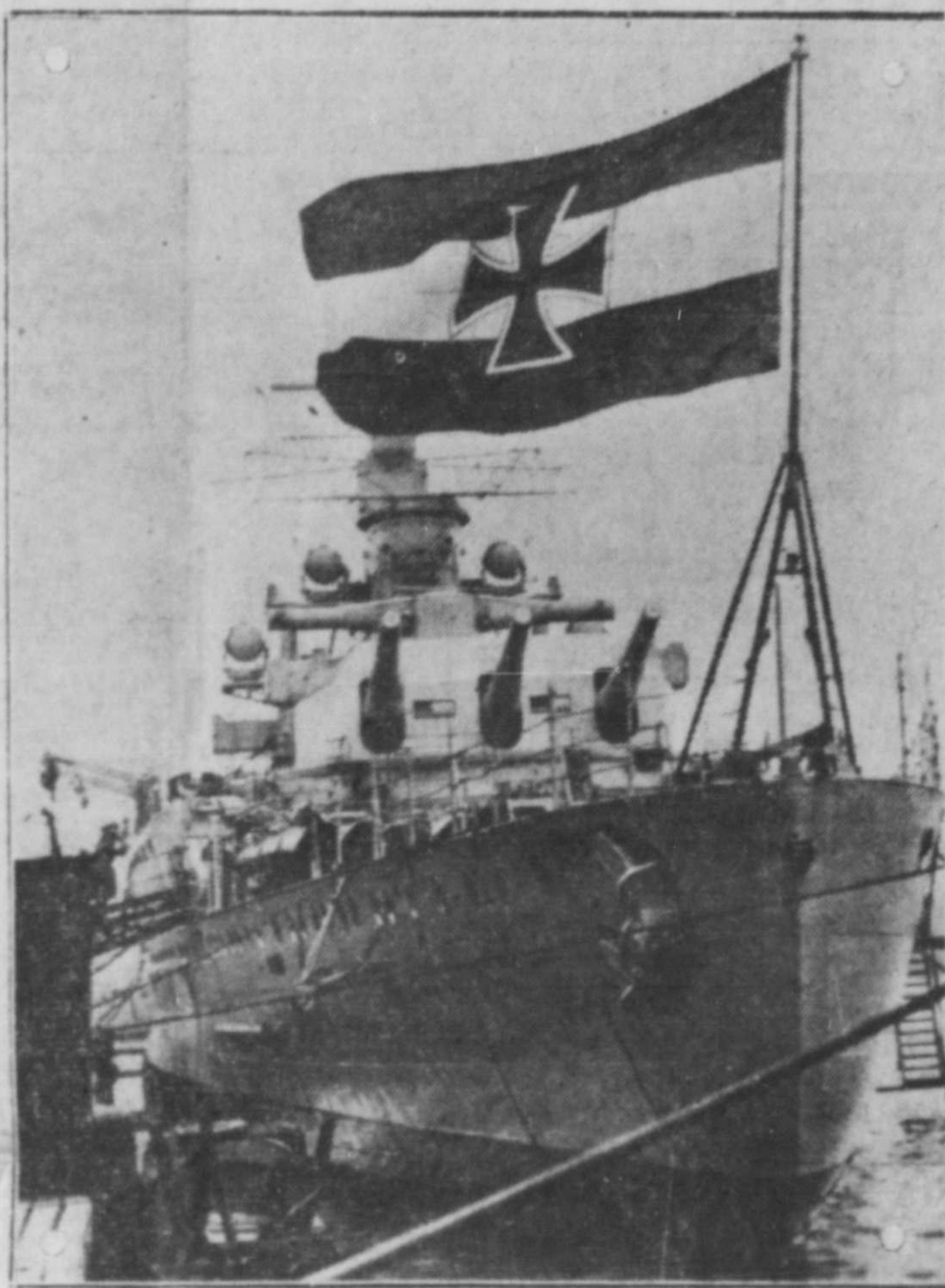
The new German cruiser "Deutschland," having completed its trial runs and proven successful, starts on its first official cruise, flying the new flag. This is one of the 10,000 ton battleships, built under the Versailles Treaty.