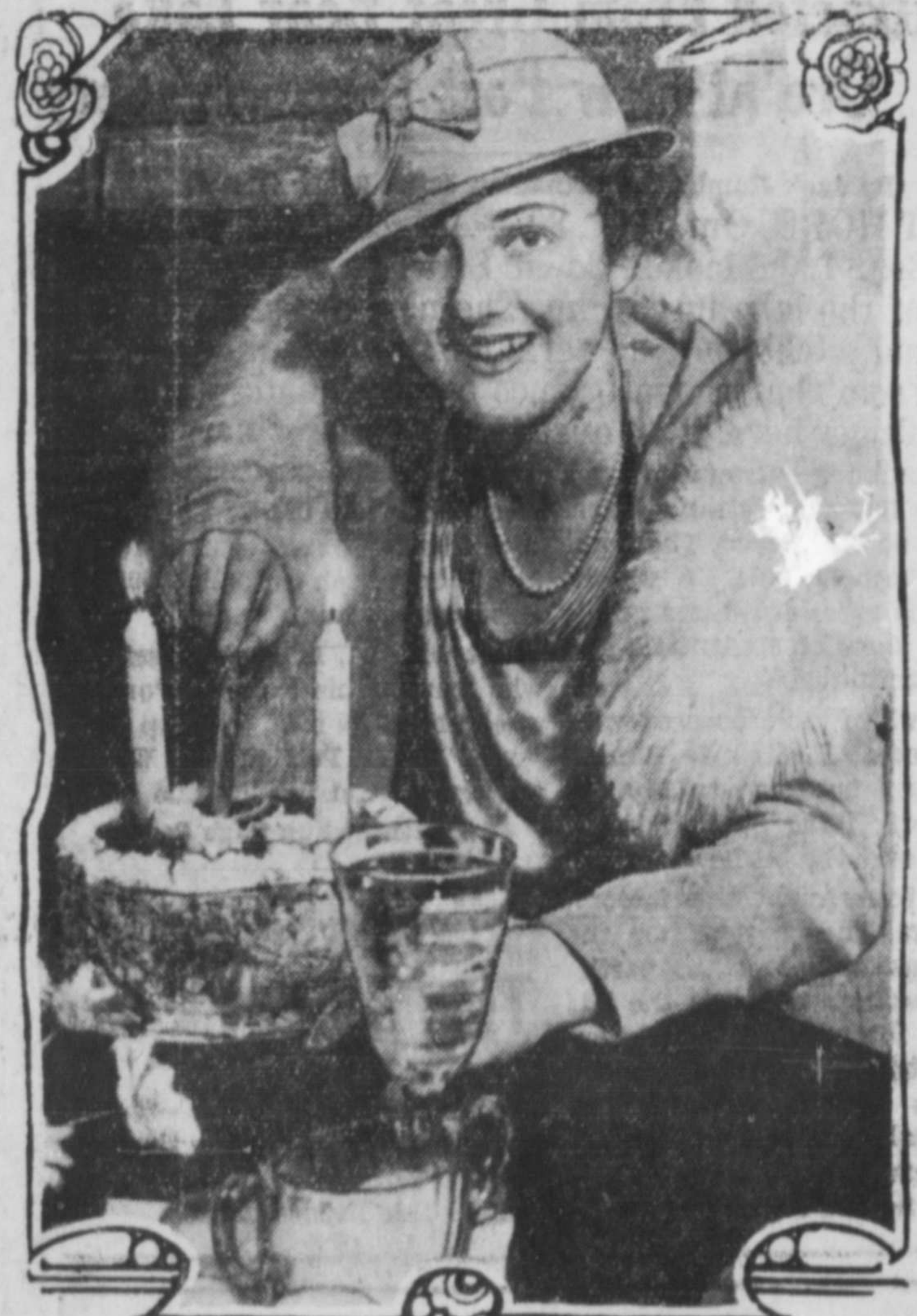
Miss Frances Rich, daughter of Irene Rich, motion picture star, attended the recent luncheon given by the Assistance League in Hollywood and was pleasantly surprised when presented with an impromptu cake in honor of Miss Rich's eighteenth birthday. And for a birthday present she received a contract to do a feature part in "Zoo in Budapest."